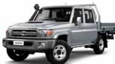
LX DOUBLE CAB CHASSIS IN SILVER PEARL