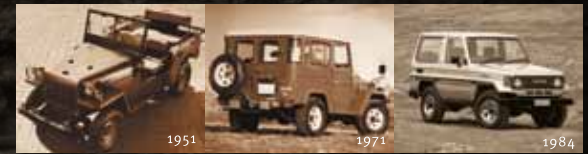
Many of the early Land Cruiser models can still be seen on our roads in daily use - testimony to their legendary reliability.