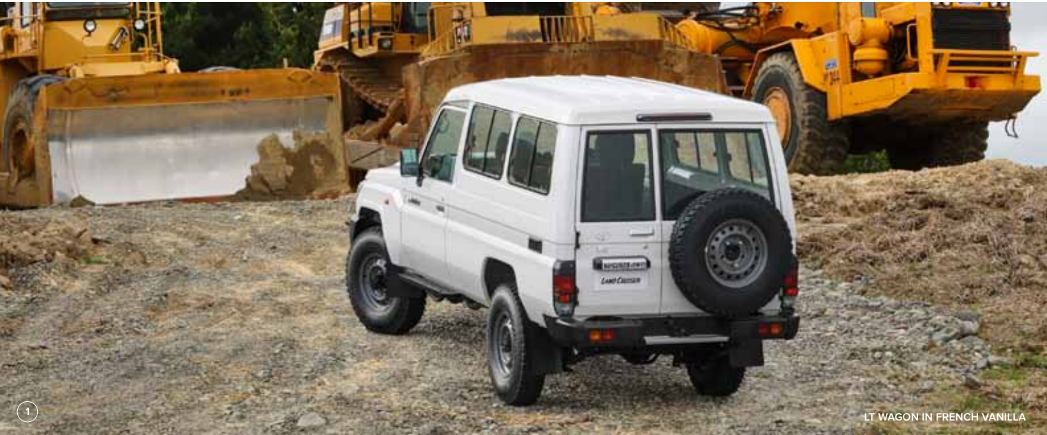
LT WAGON IN FRENCH VANILLA