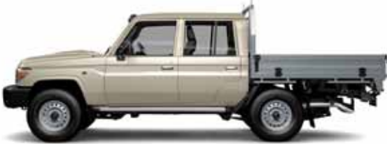
LT DOUBLE CAB CHASSIS IN VINTAGE GOLD

There are plenty of tough jobs requiring a whole team to be on site. The Double Cab will carry five people and their gear anywhere.