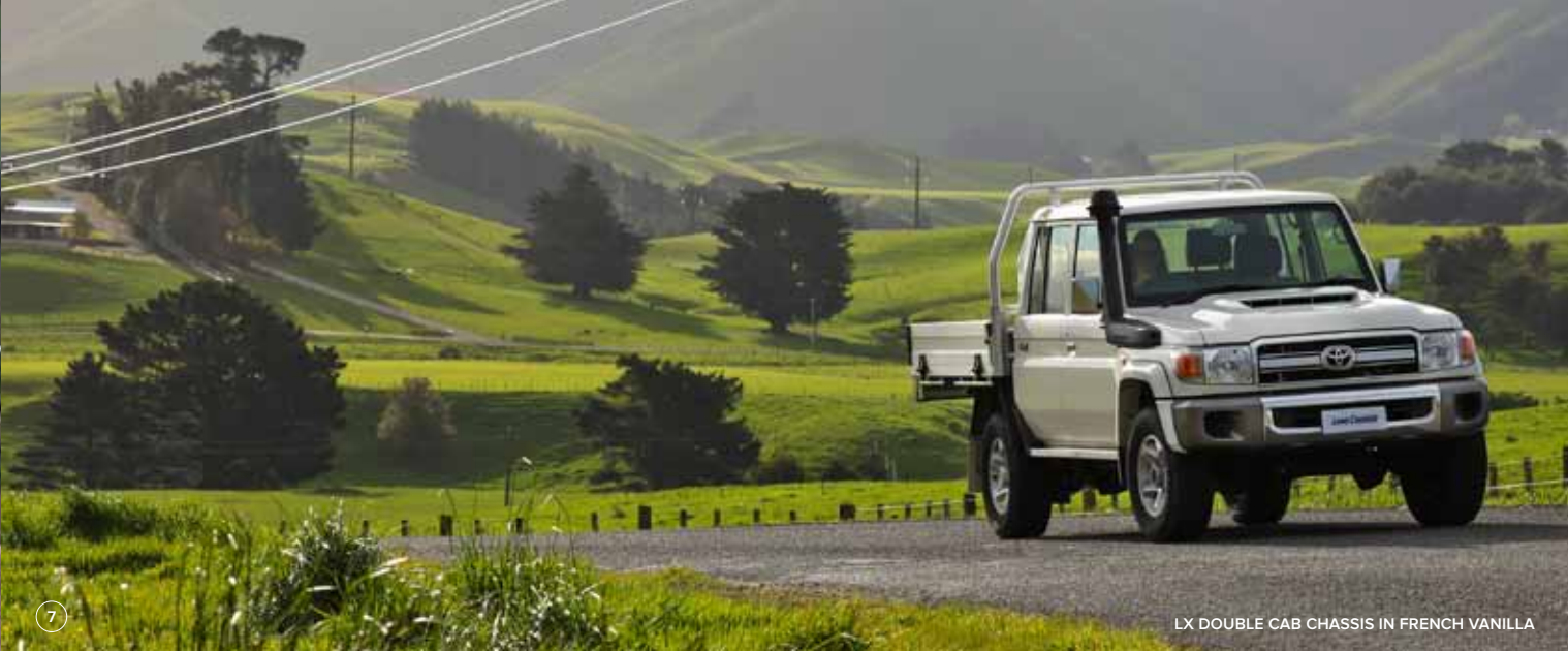
LX DOUBLE CAB CHASSIS IN FRENCH VANILLA