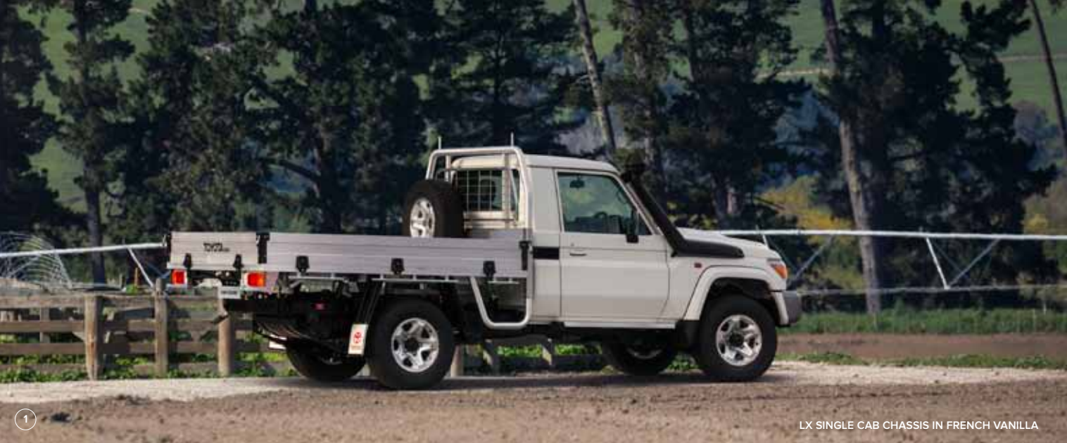
LX SINGLE CAB CHASSIS IN FRENCH VANILLA

Needing five people at a remote site or out the back of the farm is no longer an issue with the Double Cab Land Cruiser 70. If the day will be a long one the Double Cab models like the Single Cabs carry 130 litres of fuel so you can cover a lot of distance.