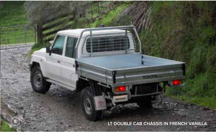
LT DOUBLE CAB CHASSIS IN FRENCH VANILLA