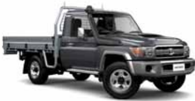
LX SINGLE CAB CHASSIS IN GRAPHITE