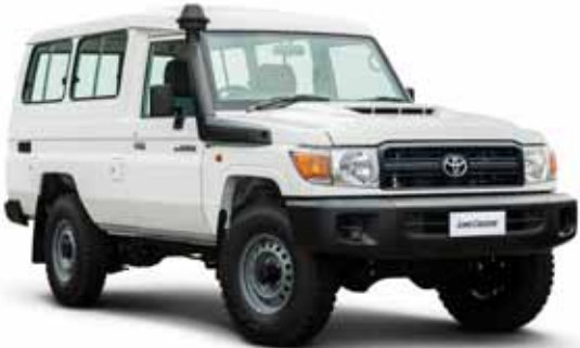
LT WAGON IN FRENCH VANILLA

Moving gear to distant off-road worksites? Land Cruiser LT Wagon’s massive load space will carry your cargo with ease.