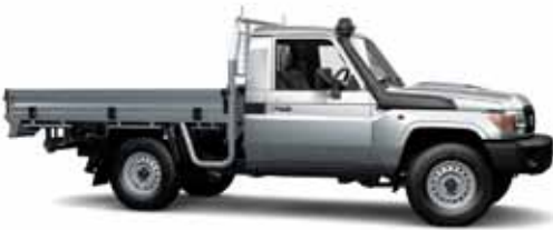
LT SINGLE CAB CHASSIS IN SILVER PEARL

If you are serious about your work you'll be serious about your tools. Best you have a tough tool kit to get you to work and back.