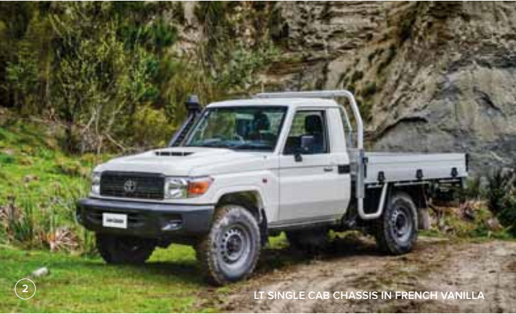
LT SINGLE CAB CHASSIS IN FRENCH VANILLA