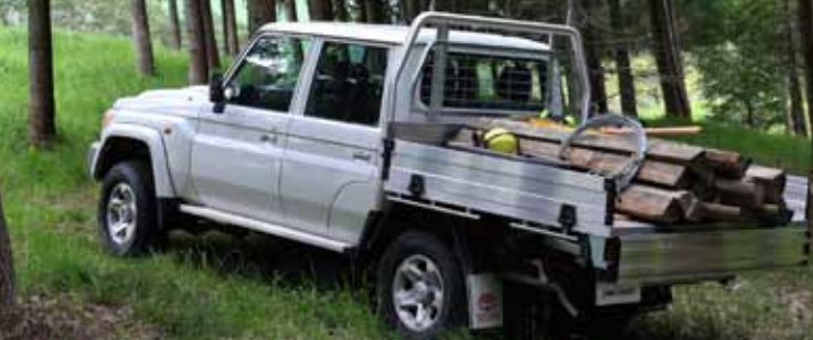
LX DOUBLE CAB CHASSIS IN FRENCH VANILLA WITH ACCESSORY ALLOY DECK FITTED

Only Toyota Genuine Accessories are designed and manufactured to the same high standard as original parts. They are engineered using manufacturer data to ensure that vehicle integrity is not compromised. This means the functionality of important precision systems such as airbags will not be impaired by their installation.