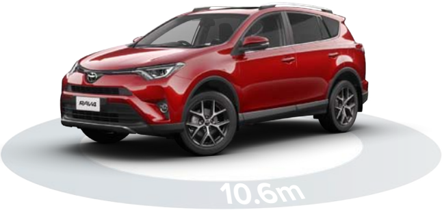
Electric Power Steering (EPS) is vehicle speed sensitive so low speed manoeuvres require minimal effort while at highway speeds less assistance is provided. The turning circle is a city friendly 10.6m.

Also standard in GXL and Limited grades is the Toyota Safety Sense system. This advanced suite of technologies is designed to help support your awareness and decision-making while out on the road. Toyota Safety Sense incorporates a Pre-Crash Safety System (PCS), Lane Departure Alert (LDA) with Steering Assist Function, Dynamic Radar Cruise Control (DRCC) and Automatic High Beam (AHB).