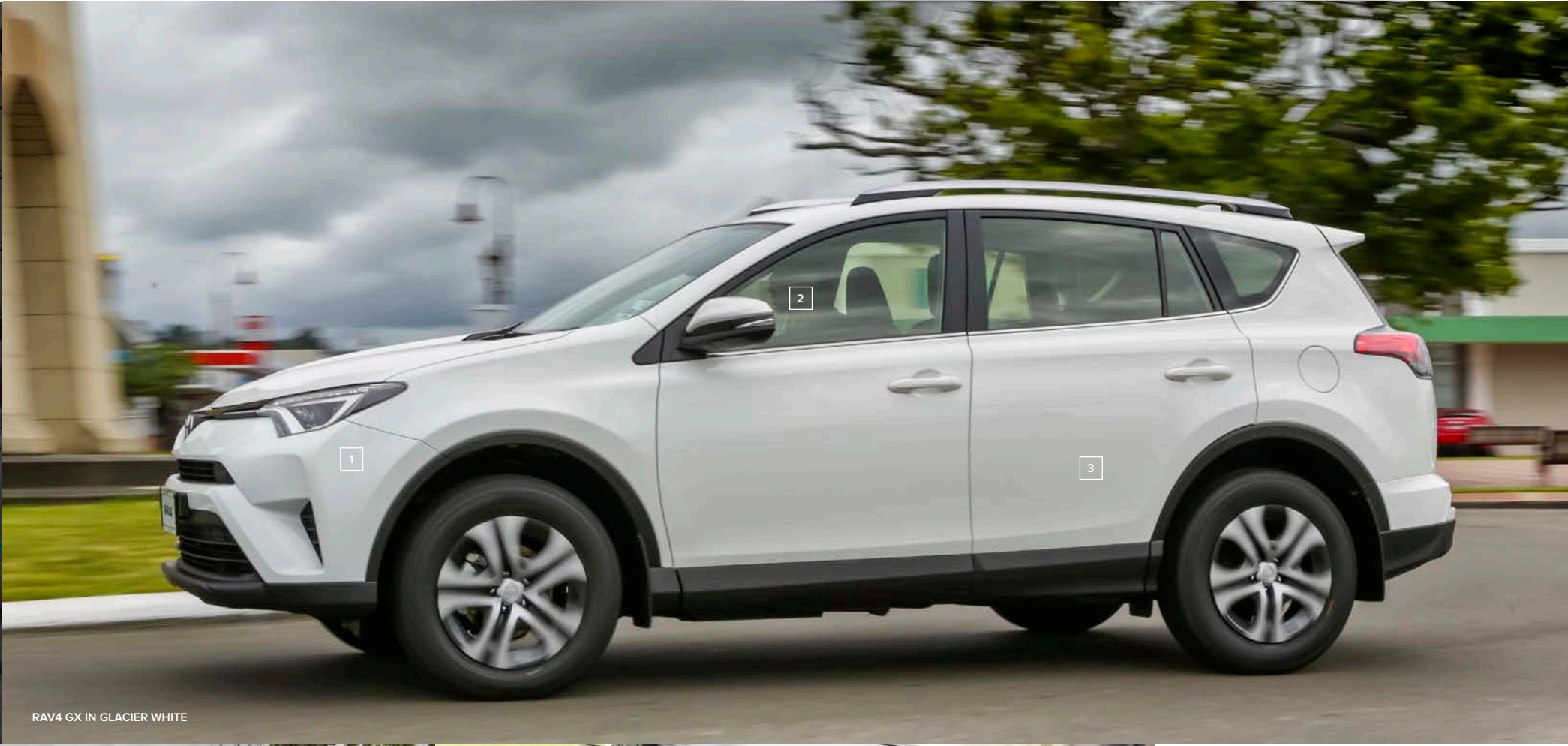
RAV4 GX IN GLACIER WHITE

Offering economy and reliability from its 2.0-litre four-cylinder petrol engine, the RAV4 2WD still packs plenty of punch, with maximum power of 107kW and maximum torque of 187Nm. Thanks to its clever Dual Variable Valve Timing-intelligent (VVT-i) and Electronic Fuel Injection (EFI), it remains fantastically frugal to run as well, with combined fuel consumption of just 7.0-litres/100km. Outside the RAV4 2WD sports modern looks, while inside it rewards with an impressive level of specification across three distinct grades; GX, GXL and Limited. Something every RAV4 2WD has in common though is style and comfort. Matte black trim with contrasting silver detailing in all models gives the cabin a premium feel while in GXL and Limited the interior trim has soft touch faux leather accents. There are storage solutions everywhere and the centre console has received a thorough update. Information, entertainment and safety go hand-in-hand with a large 6.1" touchscreen display featured in every RAV4. This system allows the driver and front seat passenger to access audio functions, Bluetooth-paired phone book details and other vehicle data. It also acts as the high quality monitor for the standard reversing camera.