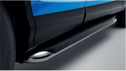
Side Steps - these stylish alloy side steps feature non-slip plastic step plate to assist entry and exit.