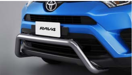
Nudge Bar - Alloy This alloy nudge bar is for those who encounter more than the odd sheep on their travels. It's airbag compatible, and has driving light mounts. Plus it looks great.