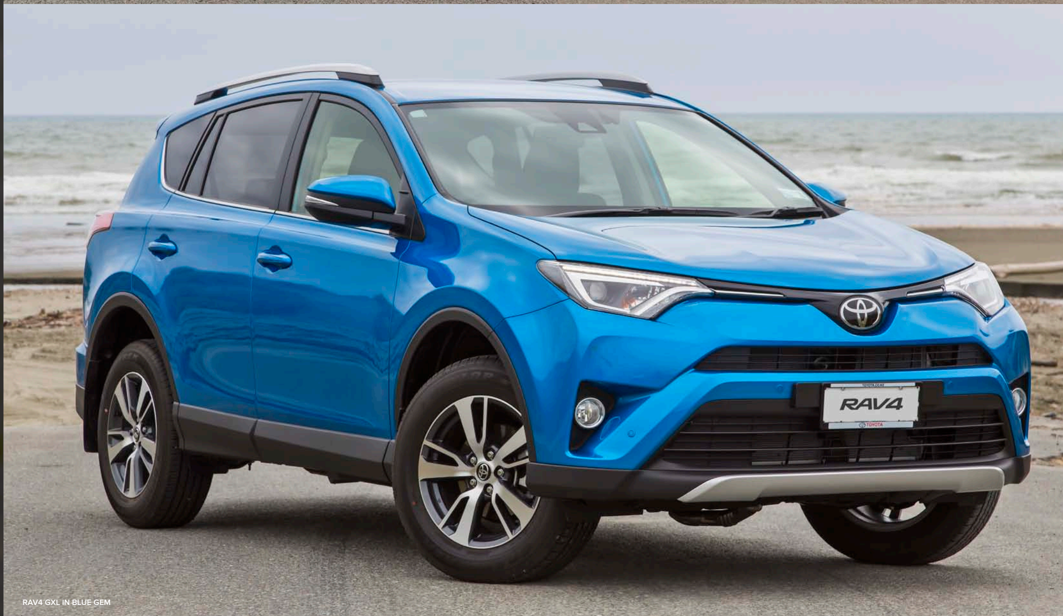
RAV4 GXL IN BLUE GEM