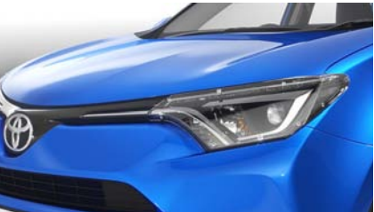
Headlight Protectors-Acrylic (Clear) - travelling on metal roads? These hard wearing clear acrylic headlight protectors will be invaluable.