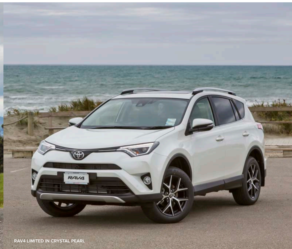
RAV4 LIMITED IN CRYSTAL PEARL