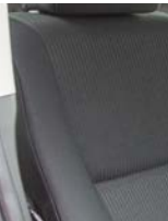
GX BLACK FABRIC