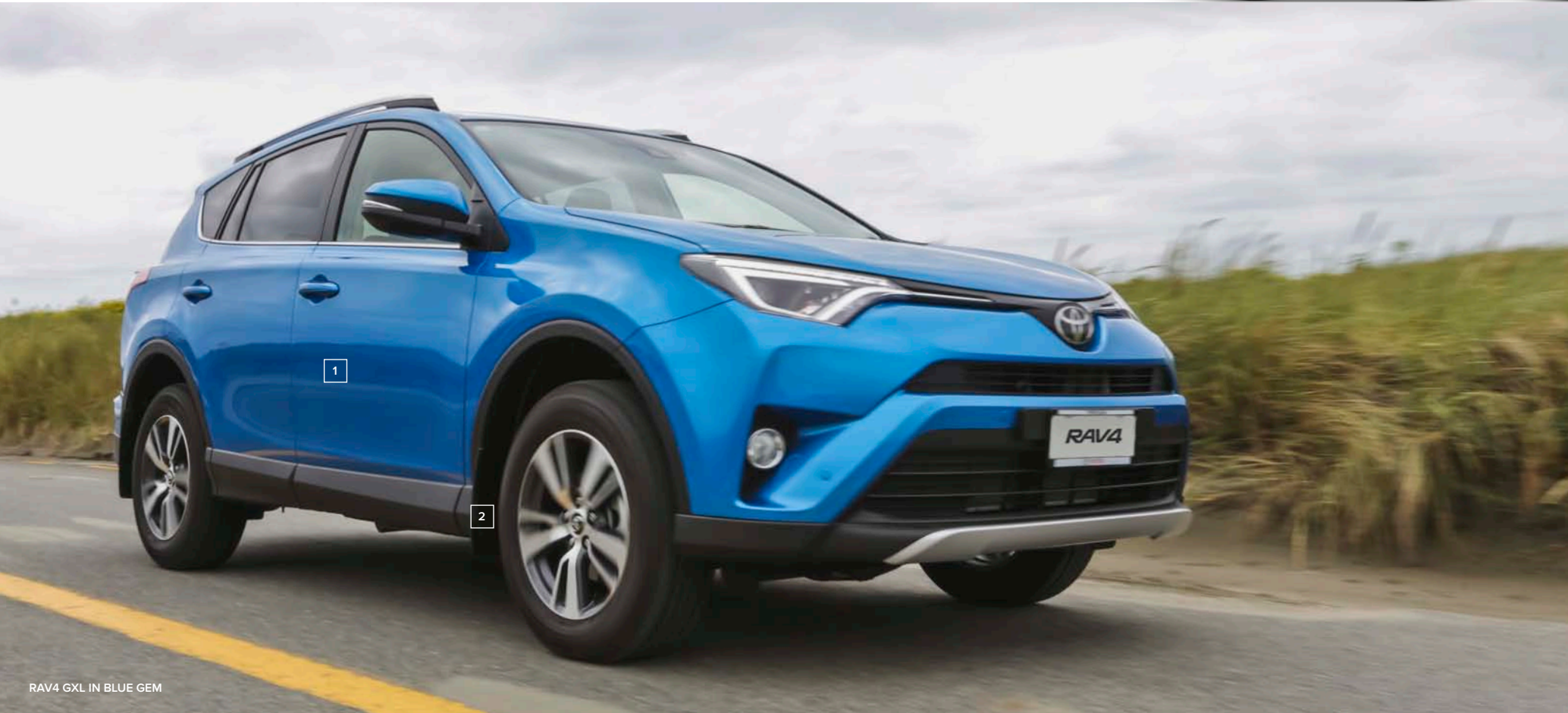
RAV4 GXL IN BLUE GEM