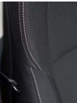
GXL BLACK FABRIC