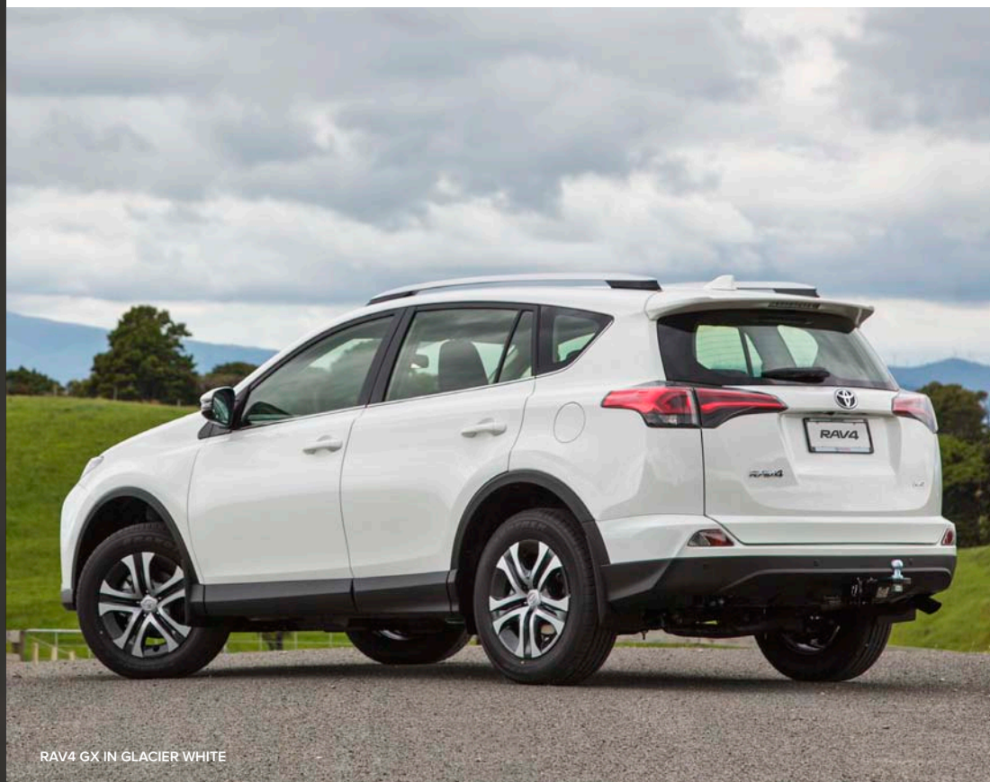
RAV4 GX IN GLACIER WHITE

If it's an active life you lead, the reliable, efficient and spacious RAV4 range is perfectly tailored to suit. With a total of nine variants, three grade and powertrain options to choose from, there is a RAV4 for every driver. And you can even bring the family along for the ride.