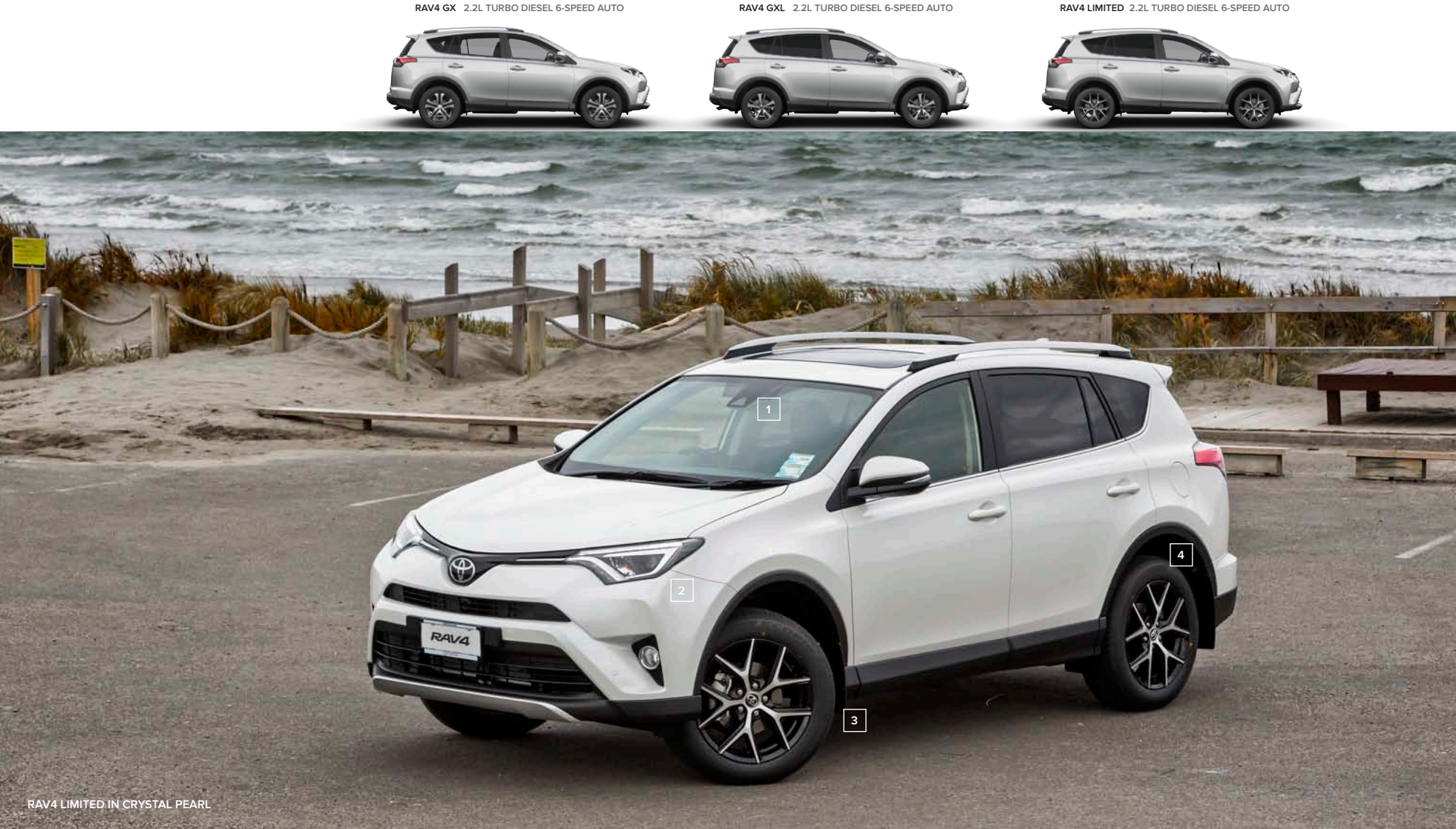
RAV4 LIMITED IN CRYSTAL PEARL

Thanks to expanded insulation coverage in order to reduce road, tyre and exhaust noise, the RAV4’s cabin is now quieter than ever for greater occupant comfort and ease of conversation.