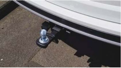
Towbar and Wiring Harness - the towbar has a removable tongue and is rated to a braked load of 800/1500/1800kg (depending on model type) - shown with trailer wiring harness and towball.