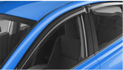
Weathershields - Slim-line - This slimline set comes in a light tint acrylic to reduce glare and is resistant to cracking and UV discolouration. Supplied as a set for front and rear doors.