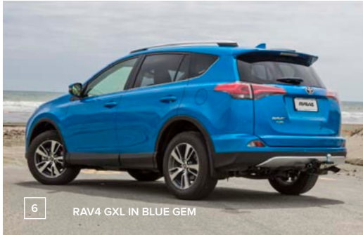
RAV4 GXL IN BLUE GEM