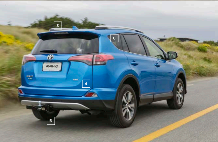
RAV4 shown with Towbar Genuine Accessory fitted