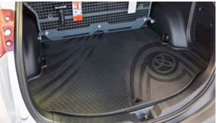
Cargo liner - this all weather rubber cargo liner will keep your boot protected. It's custom moulded to ensure a secure fit but can be removed and hosed off for easy cleaning. Low deck for space saver wheel shown, full size spare wheel version available.