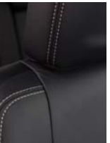
Limited BLACK LEATHER ACCENTS