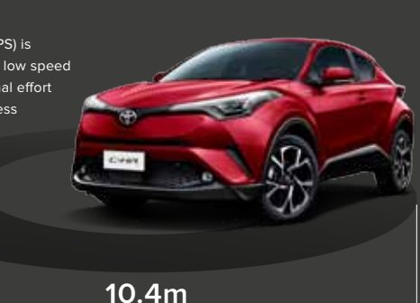
Electric Power Steering (EPS) is d sensitive so low sr require minimal ef while at highway speeds less sistance is provided The turning circle is a city friendly 10.4m

Combining a turbocharger with a small capacity engin nsures smooth and icient power while drivin