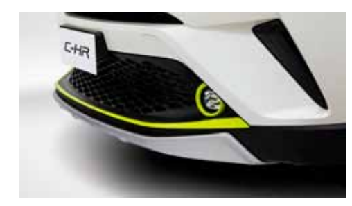
Front Guard, Front Underrun and Front Garnish.