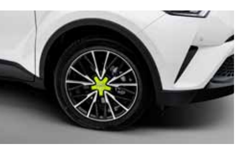
Alloy wheels. Add extra flare with a range of 18" wheels and coloured centre caps - doesn't require tyre replacement.