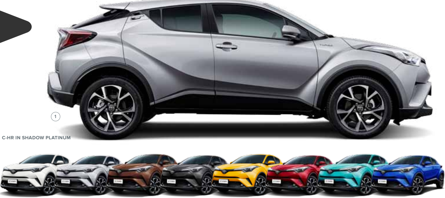
Pale, mid-tone or dark, rich warm colours and vibrant cool colours allow the stunning exterior detailing to shine through