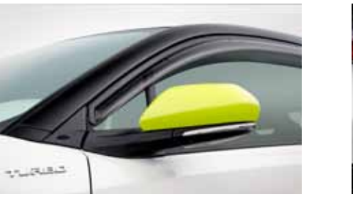
Mirror covers. Add a touch of colour to your ride with personalised outside Mirror Covers. Available in White, Grey, Red or Dark Brown and Lime Green.