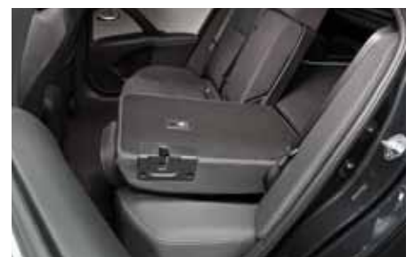
Avensis features a cargo capacity of 543-litres and 1105mm load space length. The second row splits 60:40 too, for extra convenience.