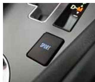
The centre console Sport button engages Sports Mode for more engine responsiveness.