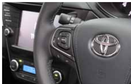
The Avensis features all the benefits of Bluetooth so you can receive hands-free phone calls on the go, as well as stream playlists; perfect when you want to listen to your own mix of music or podcasts on that long drive out of town.