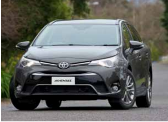
Daytime Running Lights cleverly integrated into the headlight lens will remind other road users of your presence.

Spacious, reliable and fuel efficient too, the Avensis is everything a mid-size wagon ought to be. But in addition to the large cargo-carrying capacity you expect, it also packs in convenience features and technology that will surprise you. What's more, this is no style-free box on wheels; the Avensis mixes practicality with panache, giving you a wagon you'll want to be seen in.