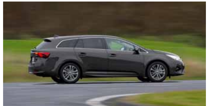
The Emergency Stop Signal (ESS) blinks the rear hazard lights to warn following drivers when emergency braking is occurring.

You'll stand out from the crowd in the redesigned Avensis. It features a sleek modern exterior, with a bold grille up front and a low, road-hugging silhouette. Whether you're out on the open road or going about your busy day in the city, the Avensis looks fantastic. With standard features like LED Daytime Running Lights, 17" alloy wheels, and rear privacy glass, the Avensis is a stylish wagon from tip to tail.