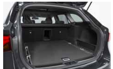
Separating the luggage space from second row passengers is easy with the retractable cargo net. Cargo tiedowns slide easily into the required place so any load can be secured for safer driving.