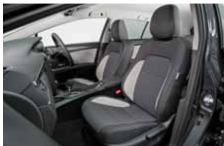
Premium interior detailing is obvious everywhere within the spacious cabin of the Avensis, including the use of high grade seat fabric and Alcantara throughout.

You can't go past the Avensis' boot for true load carrying ability. With a maximum load space length of 1105mm, all manner of gear can fit in the back. Even when you have the full complement of five people onboard, the boot still gives you plenty of storage possibilities, with 543-litres of space available.