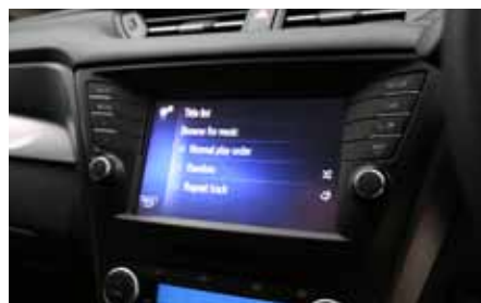
All audio and phone connectivity, and vehicle information is centered on the 8.0" touchscreen display.