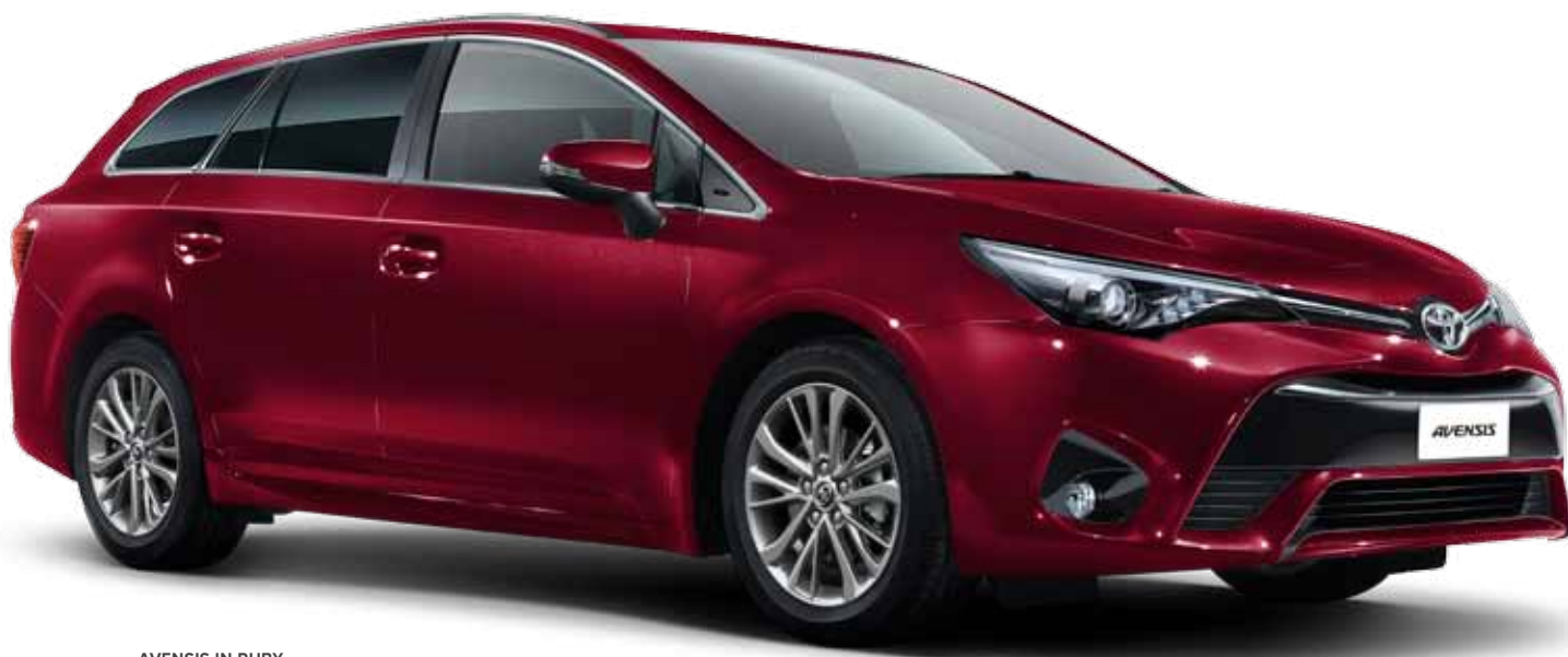
AVENSIS IN RUBY