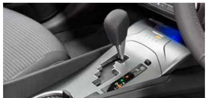
The Avensis features a smooth Continuously Variable Transmission (CVT) with 7-speed sport sequential manual mode. For an even more engaging drive, gear shifting can be done manually using the gear lever.