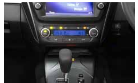
With the dual-climate control system, the driver and front passenger can choose a temperature to suit themselves with separate controls.

FRONT WHEEL DRIVE 2.0L PETROL CONTINUOUSLY VARIABLE TRANSMISSION