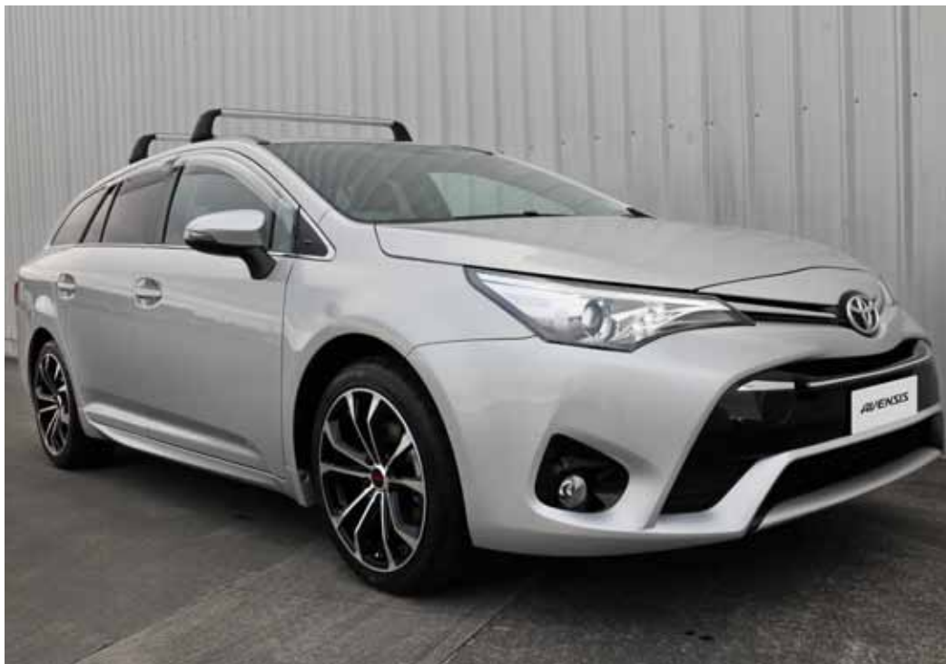
Avensis shown fitted with Slim-line weathershields - acrylic; TRD TR-03 18" alloy wheels; roofrack.