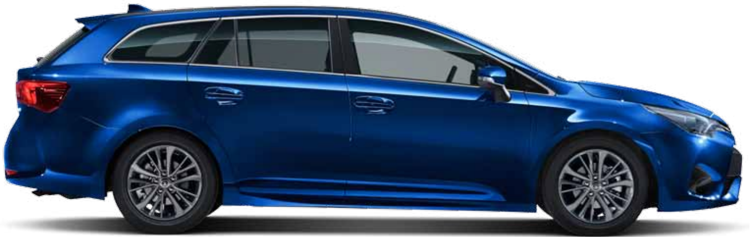
AVENSIS IN TASMAN