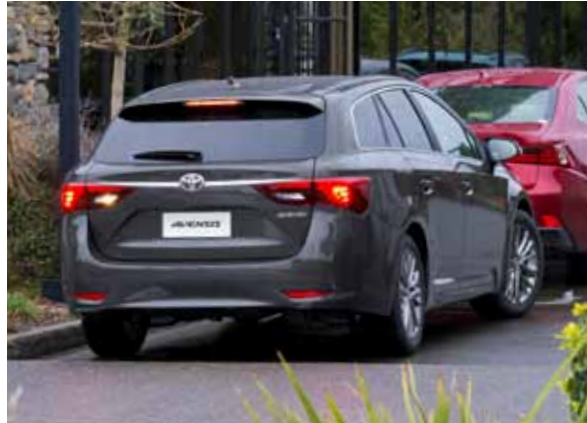
Privacy glass on the rear side and rear doors plus the retractable tonneau cover over the luggage compartment helps keep items you carry out of sight.