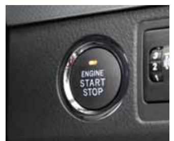
Avensis features smart key wireless entry; handy when you have your hands full.