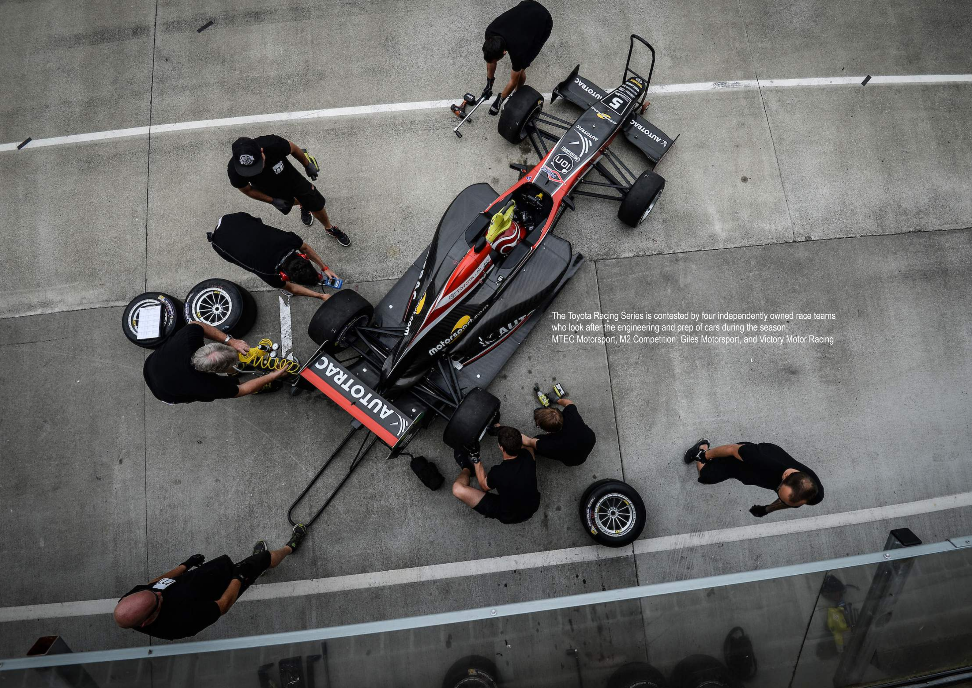
The Toyota Racing Series is contested by four independently owned race teams who look after the engineering and prep of cars during the season; MTEC Motorsport, M2 Competition, Giles Motorsport, and Victory Motor Racing.