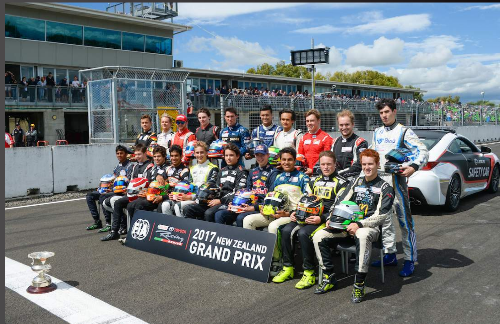
Castrol Toyota Racing Series, Class of 2017