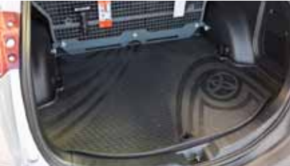
Cargo liner - this all weather rubber cargo liner will keep your boot protected. It's custom moulded to ensure a secure fit but can be removed and hosed off for easy cleaning. Low deck for space saver wheel shown, full size spare wheel version available.