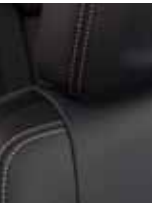
Limited BLACK LEATHER ACCENTS