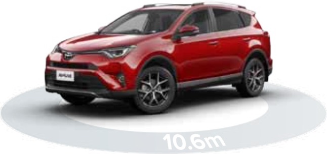
Electric Power Steering (EPS) is vehicle speed sensitive so low speed manoeuvres require minimal effort while at highway speeds less assistance is provided. The turning circle is a city friendly 10.6m.

Also standard in GXL and Limited grades is the Toyota Safety Sense system. This advanced suite of technologies is designed to help support your awareness and decision-making while out on the road. Toyota Safety Sense incorporates a Pre-Crash Safety System (PCS), Lane Departure Alert (LDA) with Steering Assist Function, Dynamic Radar Cruise Control (DRCC) and Automatic High Beam (AHB).