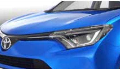
Headlight Protectors-Acrylic (Clear) - travelling on metal roads? These hard wearing clear acrylic headlight protectors will be invaluable.