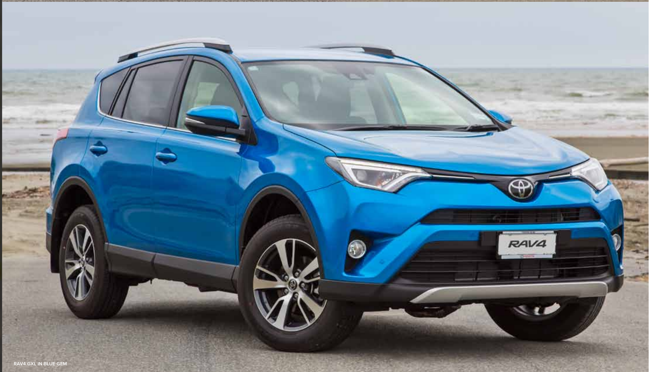
RAV4 GXL IN BLUE GEM