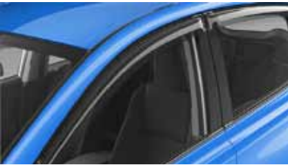
Weathershields - Slim-line - This slimline set comes in a light tint acrylic to reduce glare and is resistant to cracking and UV discolouration. Supplied as a set for front and rear doors.