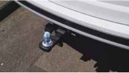
Towbar and Wiring Harness - the towbar has a removable tongue and is rated to a braked load of 800/1500/1800kg (depending on model type) - shown with trailer wiring harness and towball.