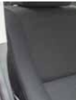
GX BLACK FABRIC