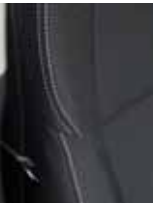
GXL BLACK FABRIC