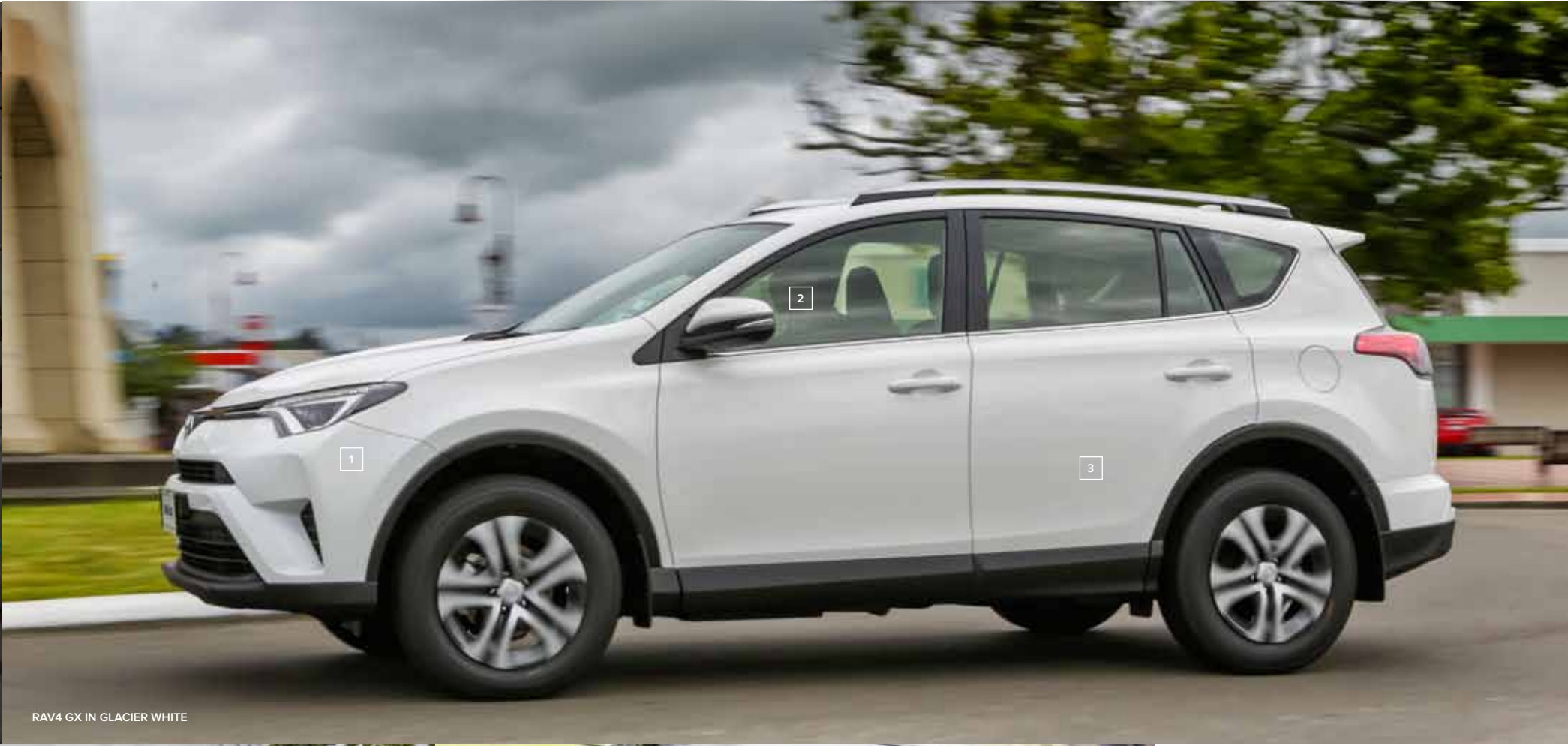
RAV4 GX IN GLACIER WHITE

Offering economy and reliability from its 2.0-litre four-cylinder petrol engine, the RAV4 2WD still packs plenty of punch, with maximum power of 107kW and maximum torque of 187Nm. Thanks to its clever Dual Variable Valve Timing-intelligent (VVT-i) and Electronic Fuel Injection (EFI), it remains fantastically frugal to run as well, with combined fuel consumption of just 7.0-litres/100km. Outside the RAV4 2WD sports modern looks, while inside it rewards with an impressive level of specification across three distinct grades; GX, GXL and Limited. Something every RAV4 2WD has in common though is style and comfort. Matte black trim with contrasting silver detailing in all models gives the cabin a premium feel while in GXL and Limited the interior trim has soft touch faux leather accents. There are storage solutions everywhere and the centre console has received a thorough update. Information, entertainment and safety go hand-in-hand with a large 6.1" touchscreen display featured in every RAV4. This system allows the driver and front seat passenger to access audio functions, Bluetooth-paired phone book details and other vehicle data. It also acts as the high quality monitor for the standard reversing camera.