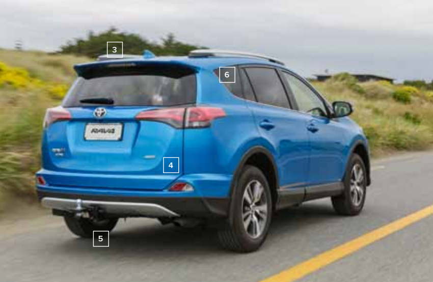
RAV4 shown with Towbar Genuine Accessory fitted