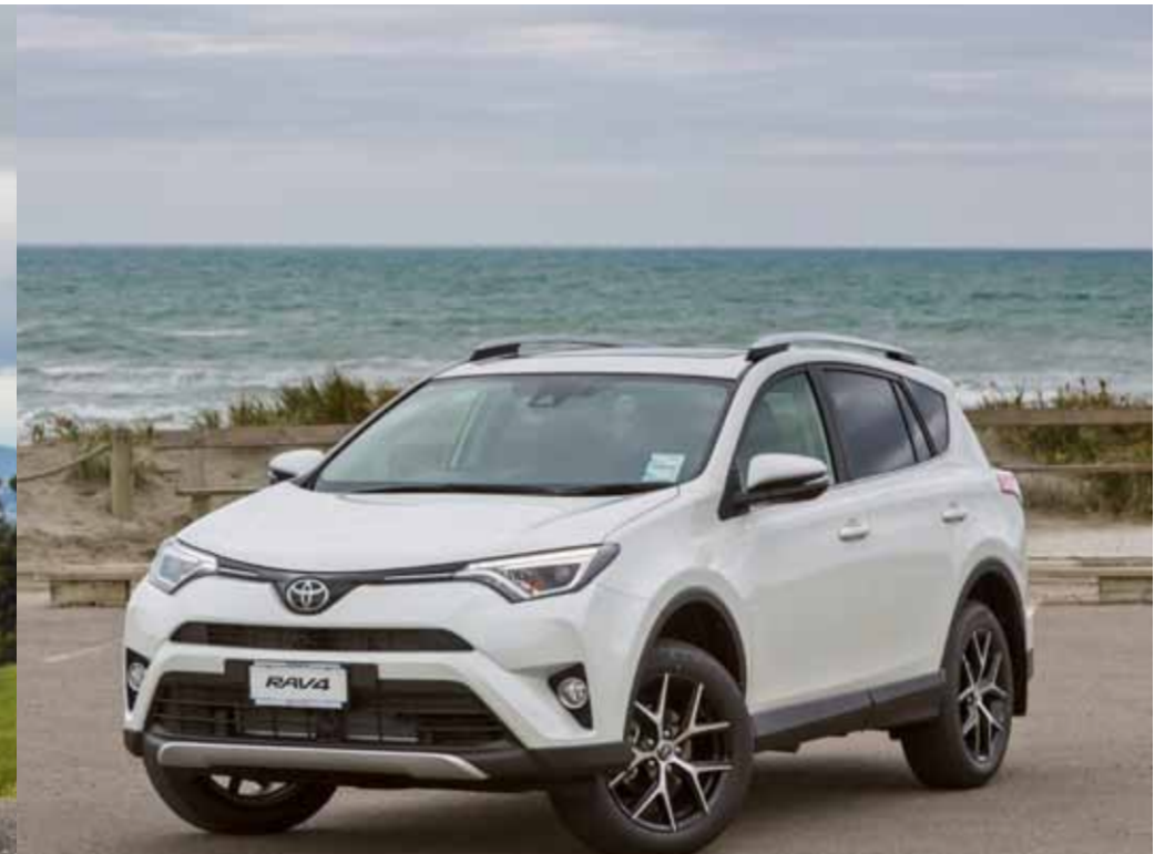
RAV4 LIMITED IN CRYSTAL PEARL