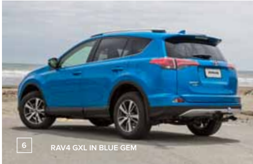
RAV4 GXL IN BLUE GEM