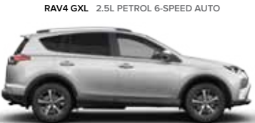
RAV4 GXL 2.5L PETROL 6-SPEED AUTO