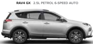
RAV4 GX 2.5L PETROL 6-SPEED AUTO