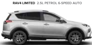
RAV4 LIMITED 2.5L PETROL 6-SPEED AUTO

The practicality and power of Toyota’s reliable petrol engine technology comes into its own when paired with the spacious, fantastically appointed RAV4 AWD Petrol. Powered by a 2.5-litre four-cylinder petrol engine capable of maximum power of 132kW and maximum torque of 233Nm, the RAV4 AWD Petrol records combined fuel consumption of 8.5-litres/100km, meaning you can go further in your working week.