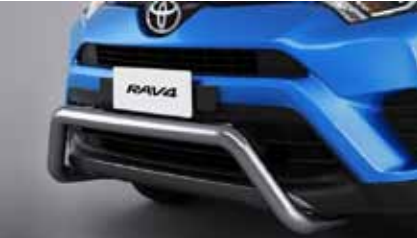
Nudge Bar - Alloy This alloy nudge bar is for those who encounter more than the odd sheep on their travels. It's airbag compatible, and has driving light mounts. Plus it looks great.