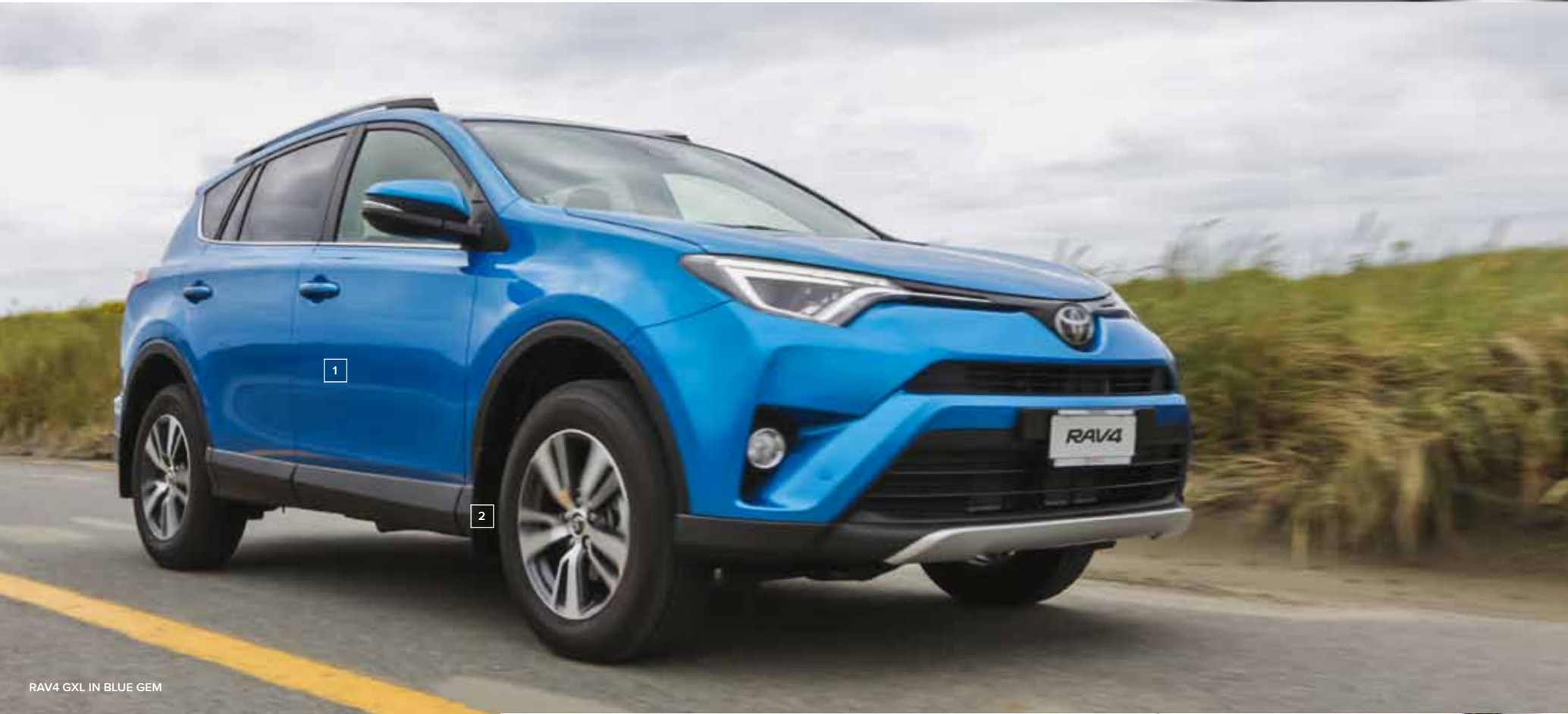
RAV4 GXL IN BLUE GEM