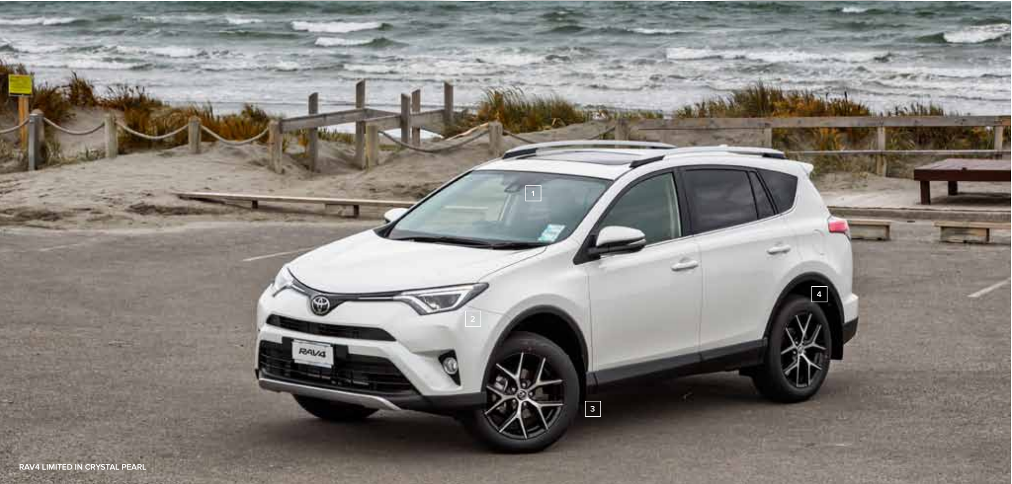
RAV4 LIMITED IN CRYSTAL PEARL