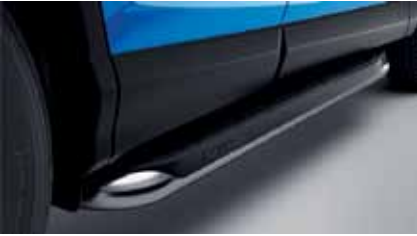
Side Steps - these stylish alloy side steps feature non-slip plastic step plate to assist entry and exit.