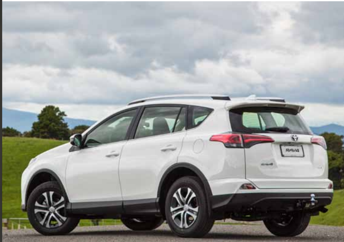
RAV4 GX IN GLACIER WHITE

If it's an active life you lead, the reliable, efficient and spacious RAV4 range is perfectly tailored to suit. With a total of nine variants, three grade and powertrain options to choose from, there is a RAV4 for every driver. And you can even bring the family along for the ride.