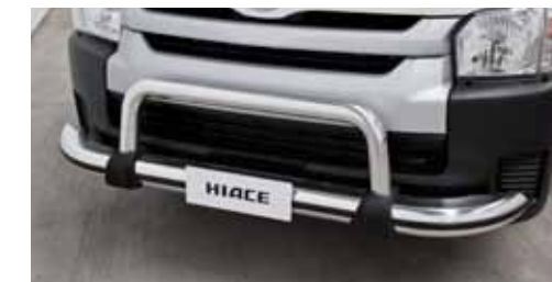
Nudge Bar - Deluxe This polished alloy nudge bar is SRS airbag compatible and has driving light mounts.