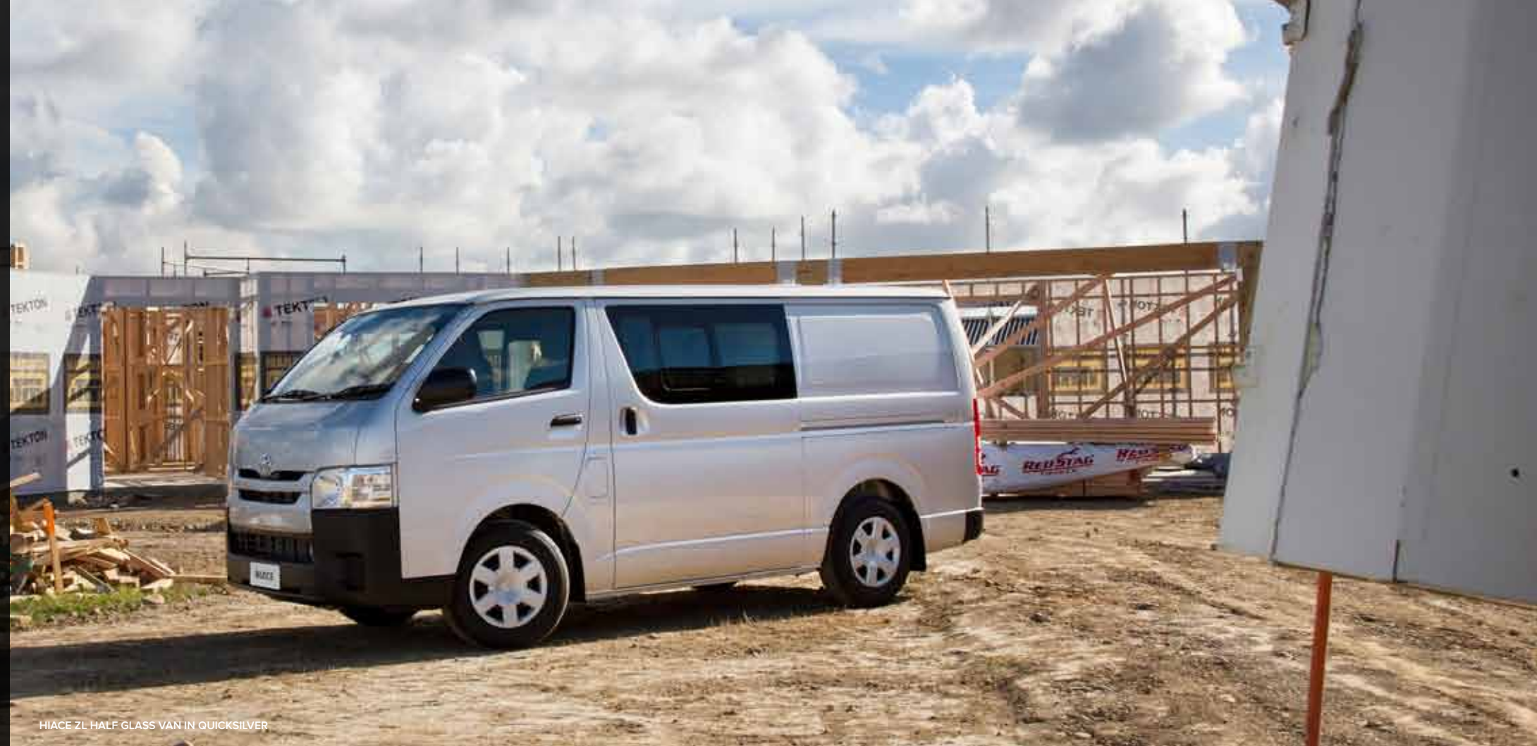
HIACE ZL HALF GLASS VAN IN QUICKSILVER

No wonder the spacious, powerful and versatile Toyota Hiace has been the van of choice for Kiwi tradespeople and businesses of all sizes for more than 40 years. There are many different ways the Hiace works: as a two, five or 12-seater, with powerful and efficient petrol or diesel engines with your choice of manual or automatic transmissions. Be prepared to start your day with the best Hiace yet. The specification includes safety features like VSC and with a choice of exterior body styles, the Hiace is available in handy configurations that offer variations in load capacity, seating capacity and dedicated people movers.