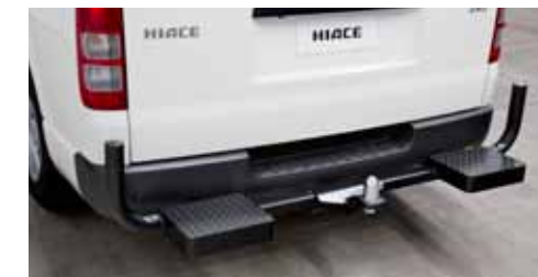
Towbar/Bullbar with Steps and Accessories The combination Towbar/Bullbar can safely tow 1400kg braked, 750kg unbraked. Available without step plates.