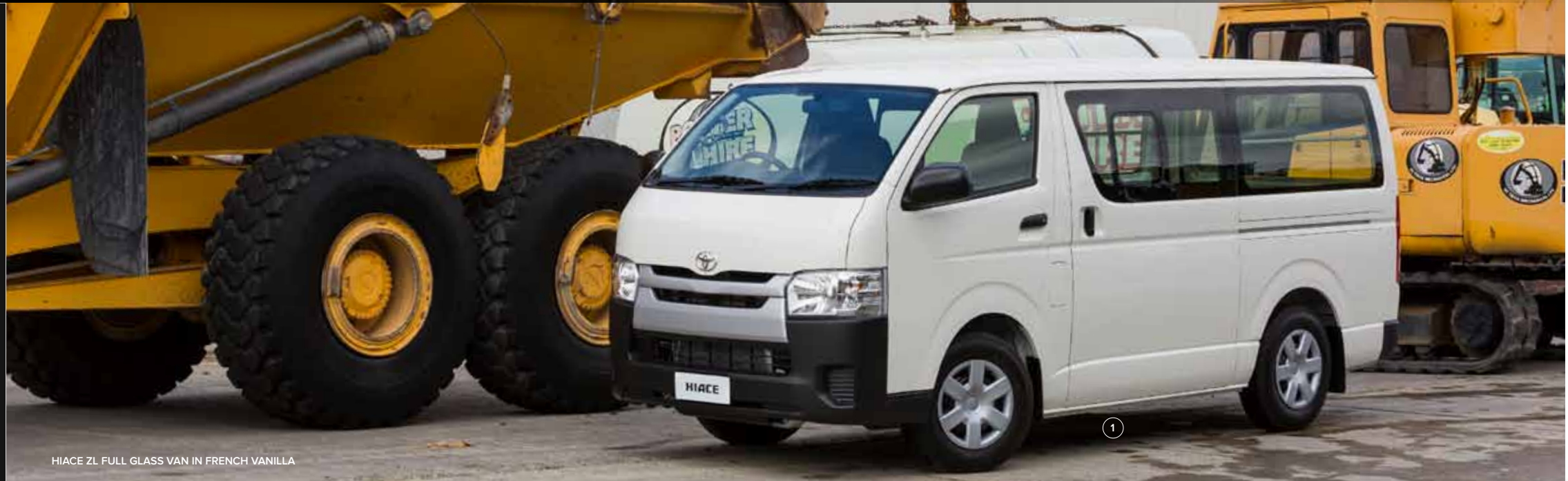
HIACE ZL FULL GLASS VAN IN FRENCH VANILLA

The Hiace ZL arrives with standard 15" steel wheels. Available in half-panel and full glass body styles, the recognisable exterior shape of the Hiace lends itself to promotional signage.