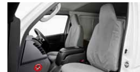
Front Seat Covers - Canvas Protect the front seats of your Hiace with these durable grey canvas seat covers.