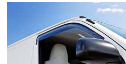
Weathershields allow fresh air into the cabin while protecting you from the elements. They are lightly tinted to reduce glare and resistant to UV discolouration.