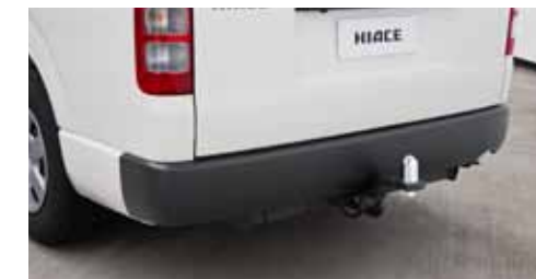
Towbar and Accessories Safely tow 1400kg braked/700kg unbraked trailers with this fixed tongue towbar and accessories.