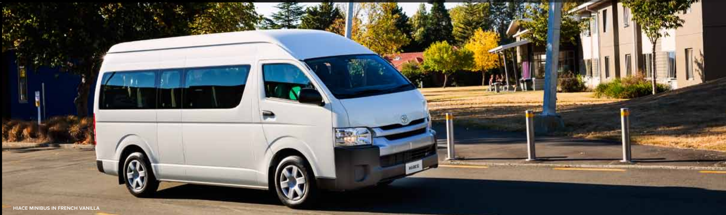
HIACE MINIBUS IN FRENCH VANILLA

Need to get colleagues, the sports team or the extended family somewhere safely and comfortably? The popular and practical Minibus is the proven vehicle for the job. With individual seats for all 12 occupants, wide-opening doors for easy access and the powerful 3.0-litre turbo diesel engine taking care of the hard work, the Hiace Minibus remains the best way to travel in numbers.