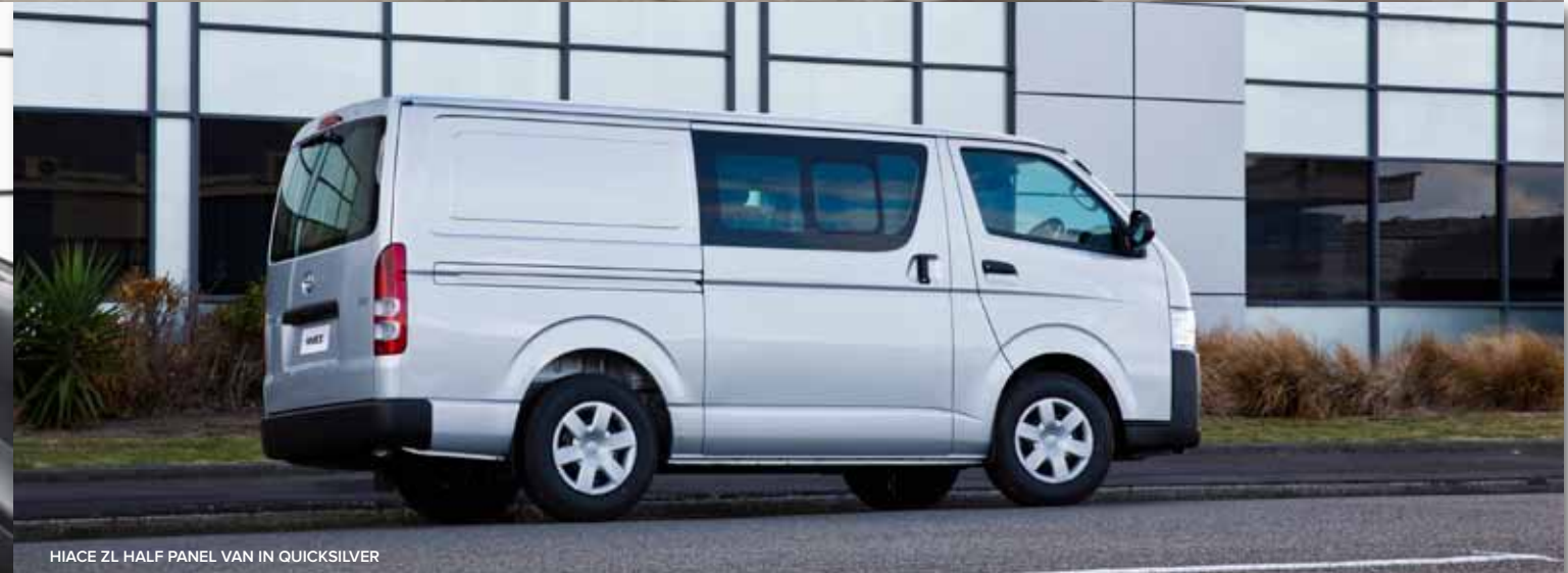
HIACE ZL HALF PANEL VAN IN QUICKSILVER