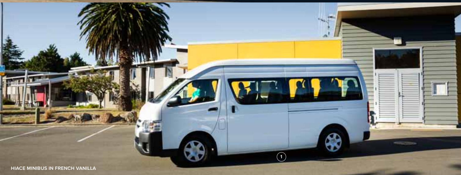
HIACE MINIBUS IN FRENCH VANILLA