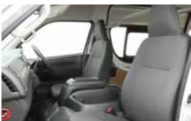
DARK GREY FABRIC