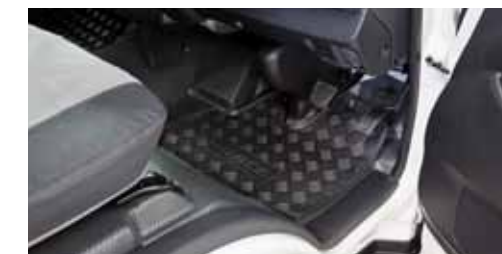
Front Floor Mats - Rubber These heavy duty rubber floor mats will protect the floor of your Hiace. Driver's side has two clips for safety.