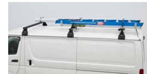
Roof Racks A wide range of roof racks and load carrying accessories are available from your local Toyota Dealer.