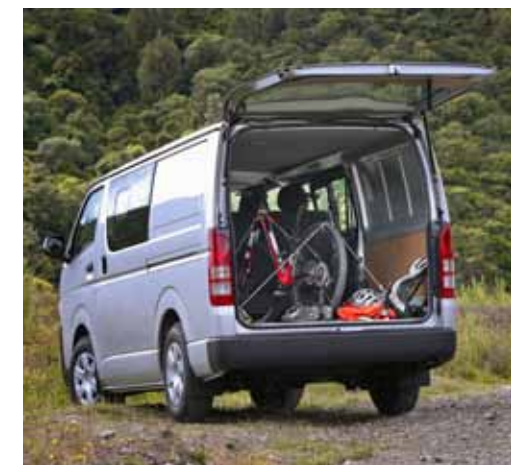
The load space in Hiace adapts to any load with dual sliding doors, a high lift rear door and tie down hooks inside.

Additionally every Hiace features Bluetooth hands-free phone connectivity and audio streaming, voice recognition, steering wheel audio controls, cruise control, powered front windows, tie-down hooks in the van cargo floor and UV reduction glass throughout.