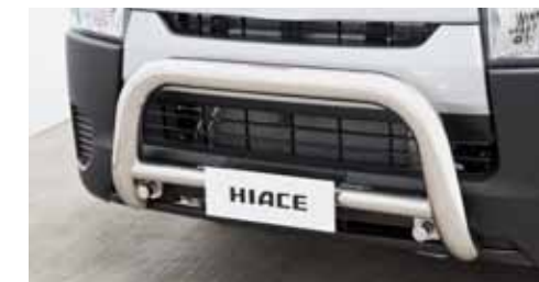
Nudge Bar - Standard Made from stainless steel this SRS airbag compatible nudge bar has driving light mounts.

Front seat pre-tensioners instantly tighten the seat belts at the time of a collision to help enhance occupant restraint performance. The force limiter function loosens the seat belts while maintaining the load to help mitigate the impact to the chest regions of the front seat occupants.