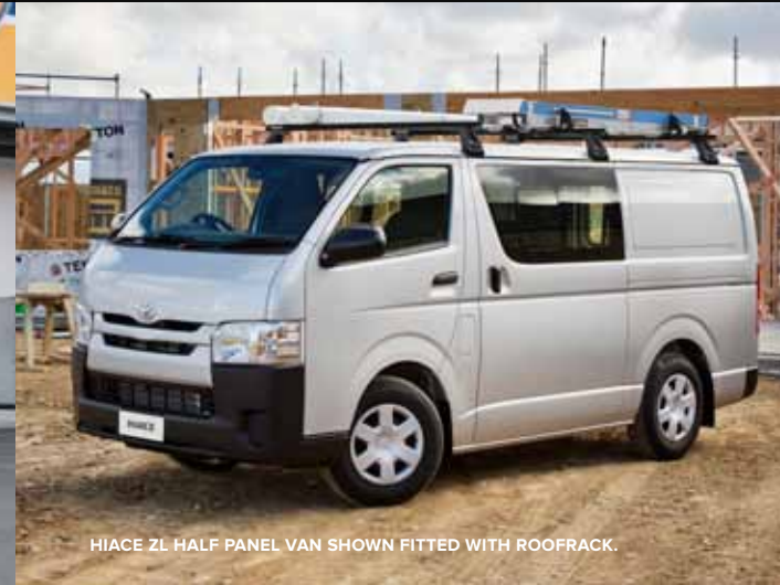
HIACE ZL HALF PANEL VAN SHOWN FITTED WITH ROOF RACK.

With a Hiace on your fleet, there's also a range of Toyota Genuine Accessories that will allow you to customise your Hiace to suit your needs.