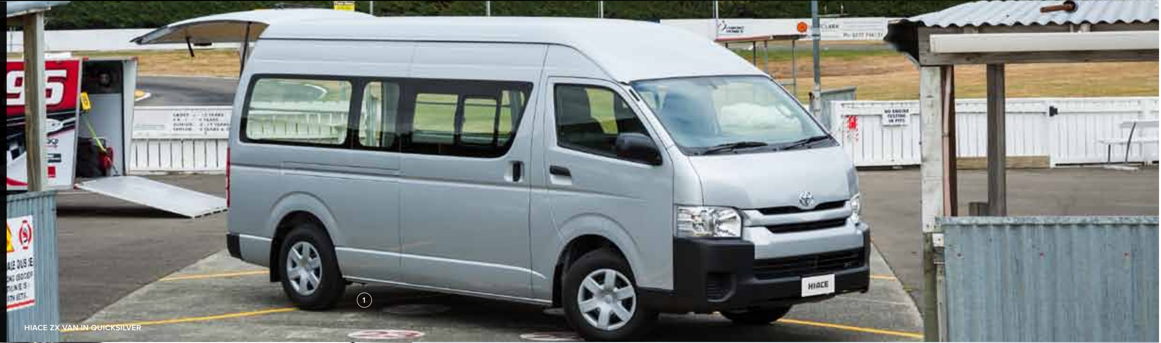
HIACE ZX VAN IN QUICKSILVER

The Hiace ZX's interior is as cavernous as it is clever. The intelligently designed layout helps you to maximize the number and size of items you can carry, while making short work of deliveries, drop-offs or removals. And the combination of a wide opening rear and dual sliding side doors means you can easily reach any items you're moving. The low level loading, rear step bumper and tie-down hooks makes ZX the large van of choice. With ample space between the rear wheel arches, standard building panels fit with ease.