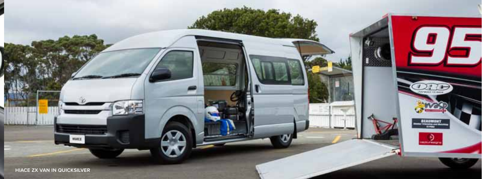
HIACE ZX VAN IN QUICKSILVER