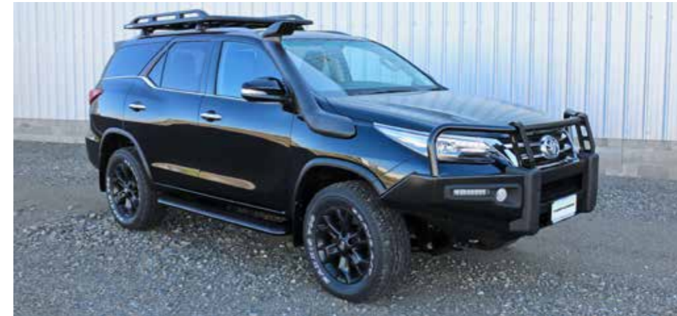
Fortuner GXL shown accessorised : Steel Premium Bullbar; Side Steps- Steel (with black painted step panels); Snorkel- Ram Head; 18" Alloy Wheels-Matte Black; Tow Kit; Canvas Seat Covers ; Aftermarket Roof Platform.