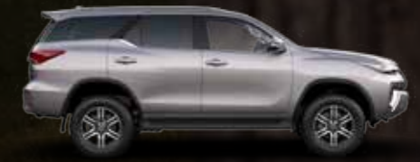
FORTUNER GXL IN SILVER SKY

Fortuner draws upon Toyota's proven four-wheel drive heritage and combines it with the premium level of fit, finish and standard specification already showcased in our comprehensive SUV range.