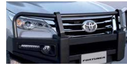
Steel Premium Bull Bar - the ultimate in protection for off-road and everyday use. Fabricated from high-tensile steel with a durable black powder-coat finish. Designed with angled wings for improved approach angles. Fully SRS airbag compatible - features driving light mounts.