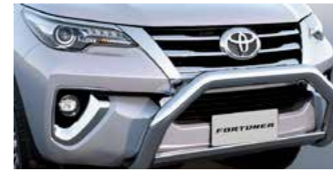
Nudge Bar - protect the front of your Fortuner with this great looking stainless steel nudge bar. The highly polished finish is low maintenance and hard wearing. The nudge bar is fully SRS airbag compatible and is ANCAP-5 star rated. Features mounts for driving lights.

Fitting Genuine Toyota Accessories also ensures the integrity of your vehicle, with components tested to exacting standards for New Zealand conditions and backed by a 3 year or 100,000 kilometres* warranty. *Whichever comes first. Warranty valid from when accessory fitted, at time of new vehicle purchase at your authorised Toyota Dealer.