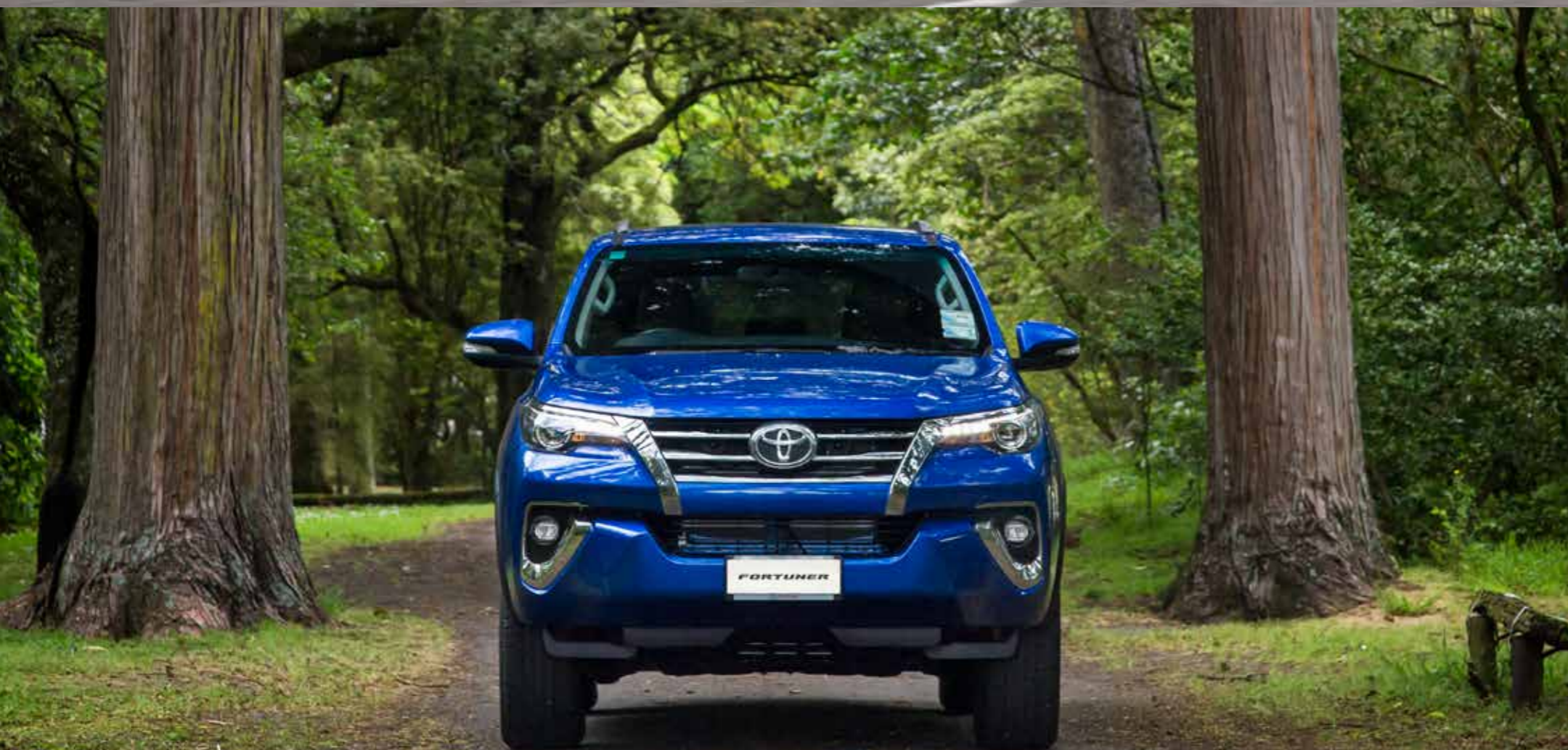
FORTUNER LIMITED IN NEBULA BLUE