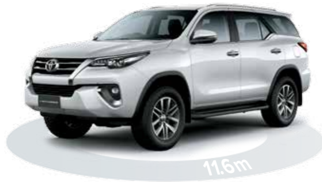
Hydraulic rack and pinion power-assisted steering is vehicle speed sensitive so low speed manoeuvres require minimal effort while at highway speeds less assistance is provided. The turning circle is a city friendly 11.6m.

Our Fortuner range also features driver and front passenger, driver's knee, front seat side plus front and rear curtain shield airbags. Every model is fitted with three-point ELR seatbelts in all 7 seating positions. Each seating position also receives its own headrest and there are two ISOFIX points and three tether anchors to install child seats to the second row.