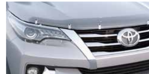
Headlight Protectors - Acrylic (Clear) - these covers protect the headlights from stone chips and road debris. Available for both GXL and Limited with LED headlights (as shown).