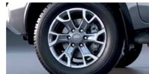
18 inch Alloy wheel - Grey Metallic - upgrade your Fortuner GXL to this 18" Alloy wheel package in metallic and grey finish with bright polished alloy highlights.