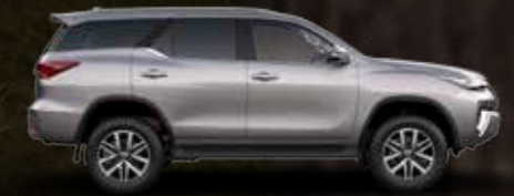
FORTUNER LIMITED IN SILVER SKY