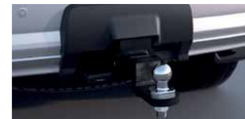
Tow Kit Package - the towbar has a removable tongue and is rated to a maximum braked load of 2800kg. Includes the trailer wiring harness, accessory fuse box and towball.