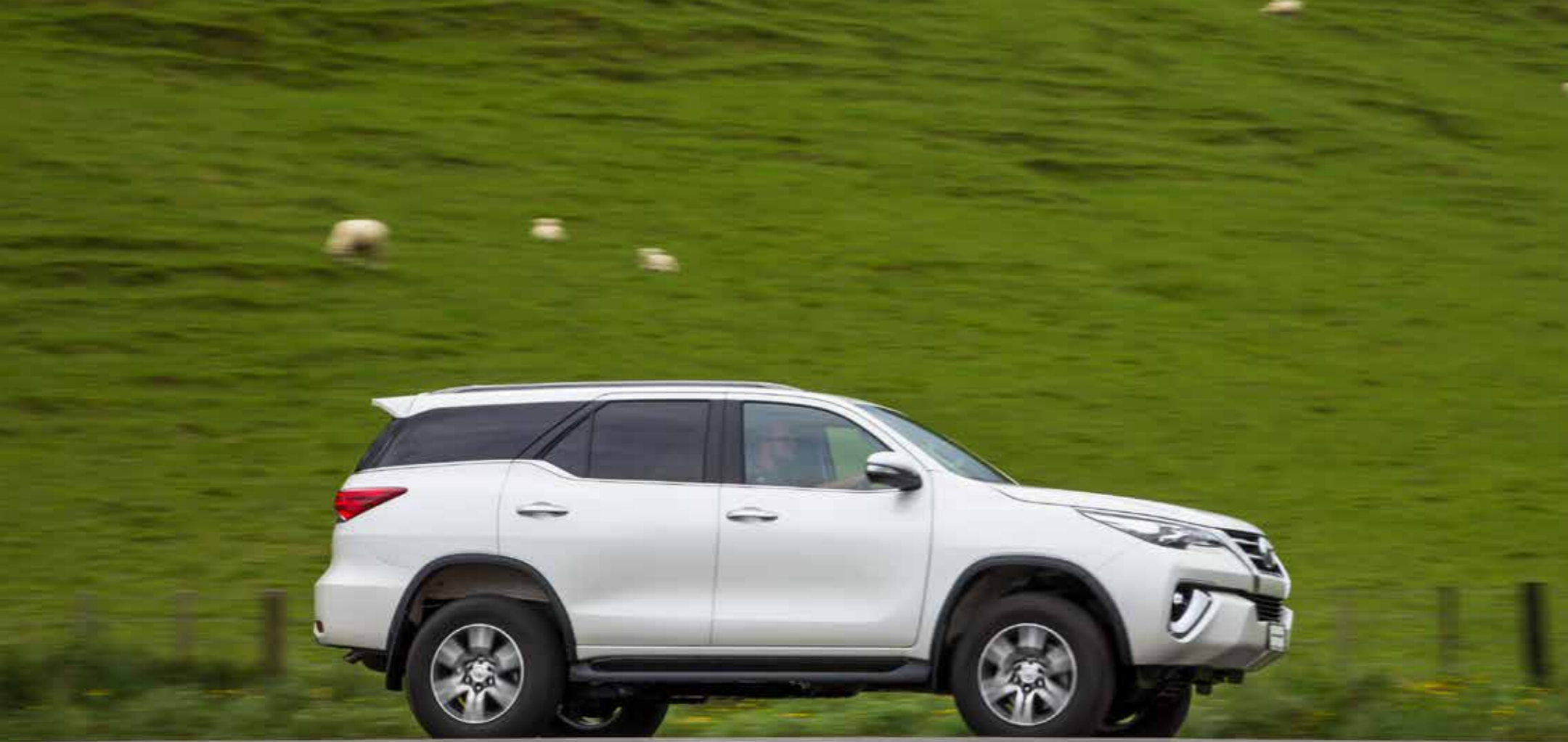
FORTUNER GXL IN CRYSTAL PEARL