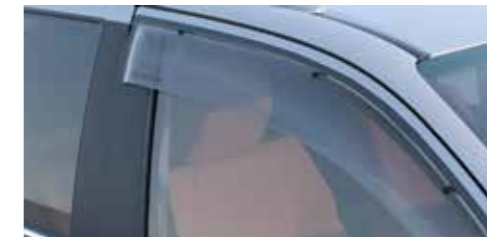
Weathershields - Acrylic (Clear) - these clear acrylic weathershields allow fresh air into the cabin while keeping the weather out.