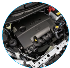
FRONT WHEEL DRIVE 1.5L PETROL MANUAL TRANSMISSION