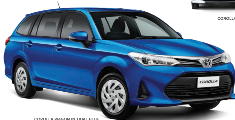
COROLLA WAGON IN TIDAL BLUE

You'll also note just how peaceful it is inside the Corolla wagon; Toyota has worked hard to improve on silencing material used in the model's interior panels to ensure the quietest possible cabin, regardless of the road surface under your wheels.