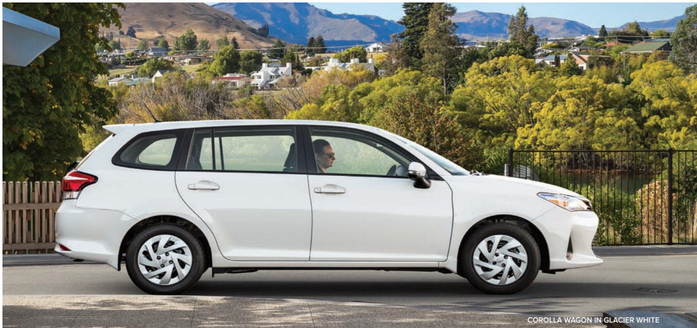
COROLLA WAGON IN GLACIER WHITE