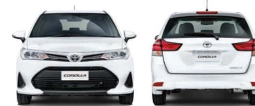
COROLLA WAGON IN GLACIER WHITE