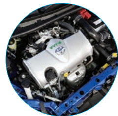
FRONT WHEEL DRIVE 1.5L PETROL CONTINUOUSLY VARIABLE TRANSMISSION

And that boot is what it's all about too, offering 407-litres of luggage space with the rear seats up, or a full van-like 872-litre cargo area with the rear seats folded flat.