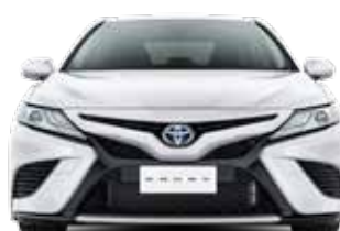
CAMRY V6 & ZR

Camry has evolved into a model that effortlessly incorporates the best characteristics of both the elegant tourer and the sporty athletic performer. Suffice to say, across its broad specification base, there is a Camry that will appeal to everyone.