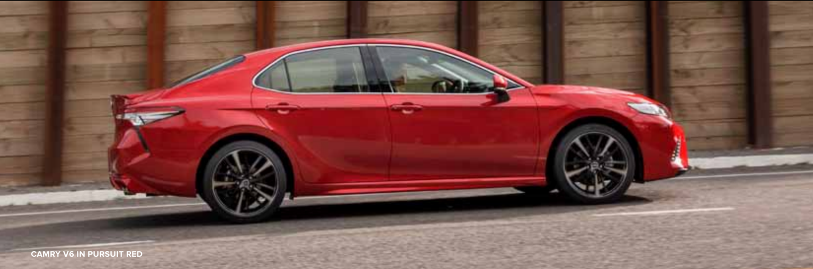
CAMRY V6 IN PURSUIT RED

The 5-star ANCAP rated Camry gives you peace of mind on the road, whether in the city or cruising the highways and byways.