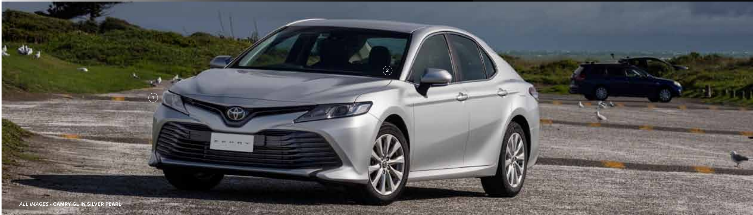
ALL IMAGES - CAMRY GL IN SILVER PEARL

Toyota's Camry GL boasts the reliability of Toyota's trusted 2.5-litre four-cylinder petrol engine, offering comfortable motorway cruising without compromising on fuel economy.