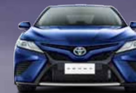
CAMRY ZR HYBRID IN BLUE CRUSH