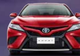
CAMRY V6 IN PURSUIT RED