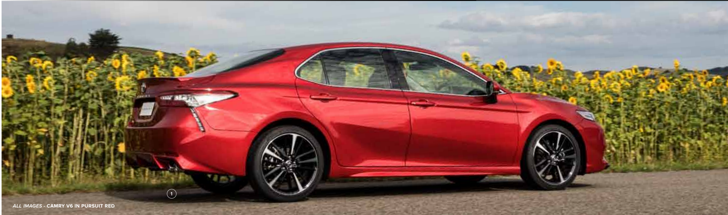
ALL IMAGES - CAMRY V6 IN PURSUIT RED

Performance-themed features such as an all-new 8-speed automatic transmission, twin exhaust system, high gloss black metallic sports grille, sports-tuned suspension and, inside the cabin, sports seats up front enliven this worthy addition to the Camry line-up.