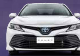
CAMRY GX HYBRID IN GLACIER WHITE