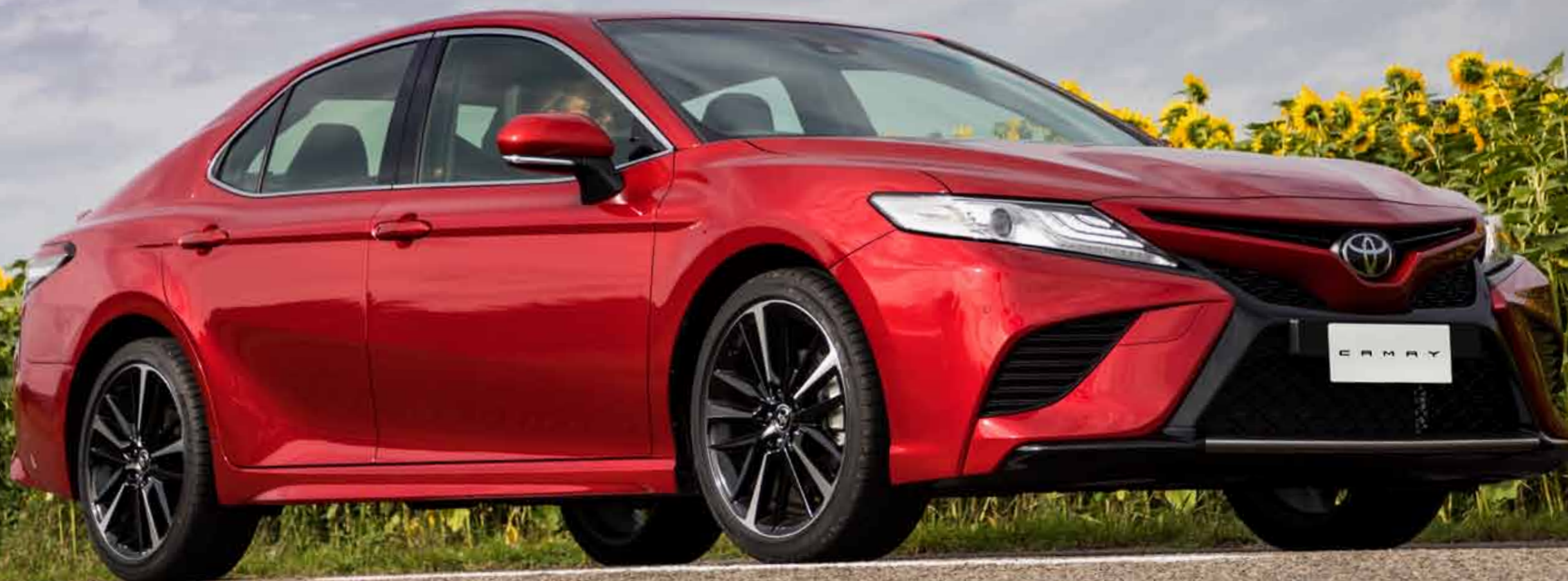
CAMRY V6 IN PURSUIT RED