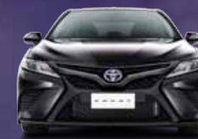
CAMRY SX HYBRID IN ECLIPSE