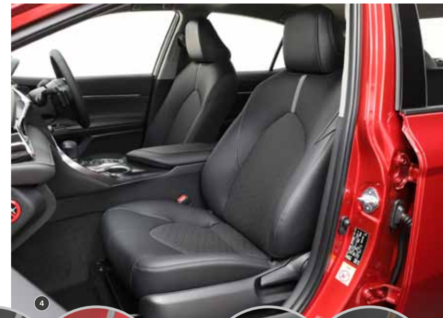
CAMRY GL, GX, SX