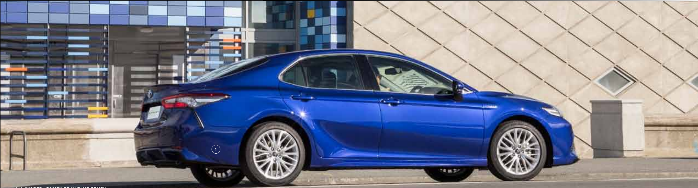
ALL IMAGES - CAMRY ZR IN BLUE CRUSH

The good stuff doesn't end there, however. Wireless charging, satellite navigation and leading-edge safety technology such as Blind Spot Monitoring and a Rear Cross Traffic Alert system are included as standard in the ZR grade. LED lighting technology outside and stylish illuminated ambient lighting inside make the Camry ZR a class act from front to back.