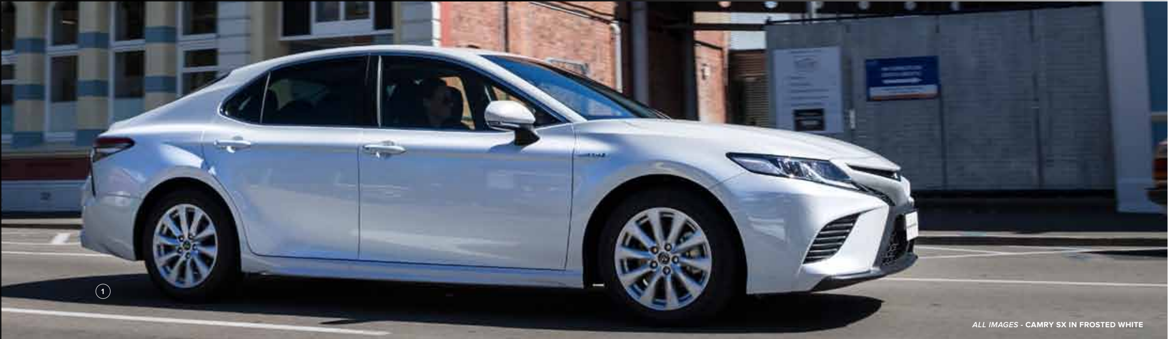
ALL IMAGES - CAMRY SX IN FROSTED WHITE

Inside, a three-spoke leather steering wheel and shift knob, resin and stainless steel scuff plates on the door sills and an 8-way powered driver's seat add to the Camry's form and function. Additionally, the SX grade receives an 8" colour TFT multi-information touchscreen display and satellite navigation with the added practicality of SUNA Traffic* technology.