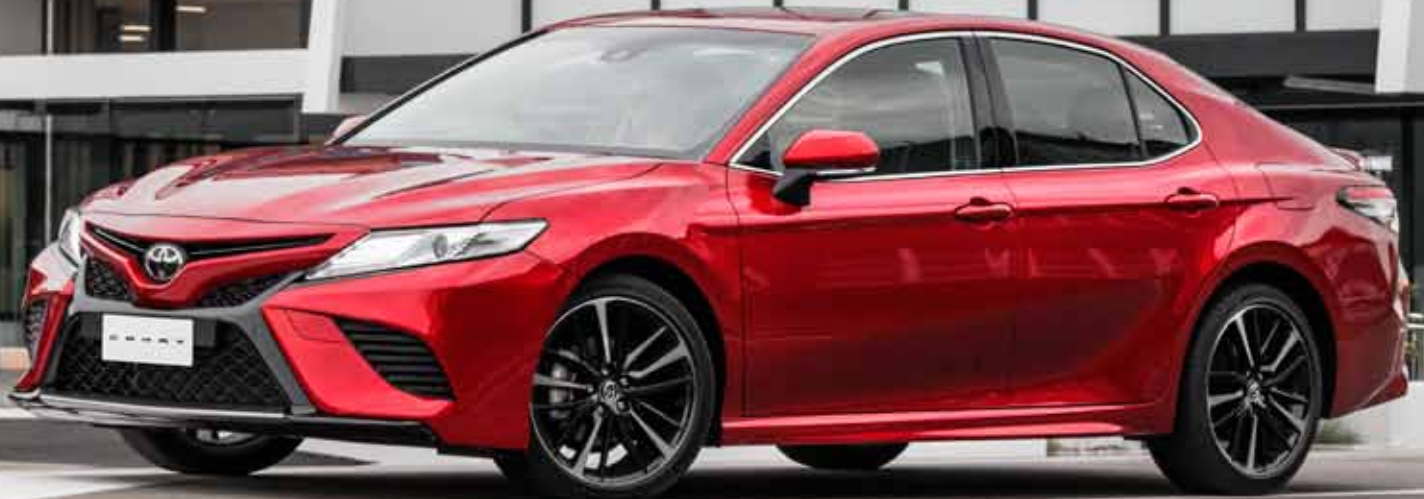
CAMRY V6 IN PURSUIT RED