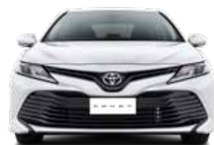
CAMRY GL & GX

Meanwhile, the sporty and powerful nature of the Camry V6 featuring an engine which receives both more power and torque for this iteration – is paired with a newly developed 8-speed direct shift automatic transmission, for the ultimate in driver involvement.