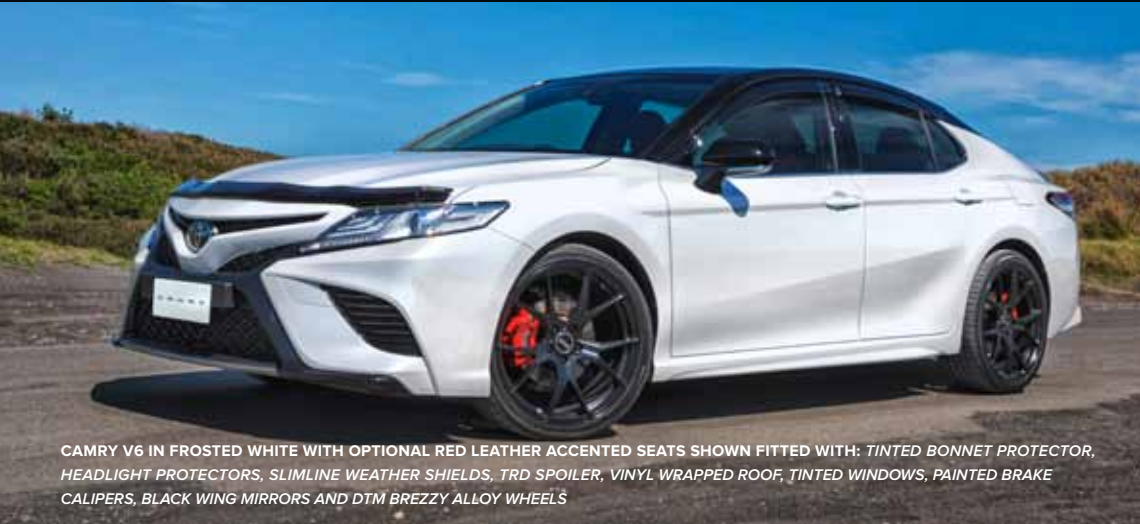
CAMRY V6 IN FROSTED WHITE WITH OPTIONAL RED LEATHER ACCENTED SEATS SHOWN FITTED WITH: TINTED BONNET PROTECTOR, HEADLIGHT PROTECTORS, SLIMLINE WEATHER SHIELDS, TRD SPOILER, VINYL WRAPPED ROOF, TINTED WINDOWS, PAINTED BRAKE CALIPERS, BLACK WING MIRRORS AND DTM BREZZY ALLOY WHEELS

With a Camry available for every taste, there’s also a Toyota Genuine Accessory component that will help your Camry reflect your personality. Front, back, interior and exterior; Camry is covered.