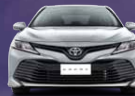
CAMRY GL IN SILVER PEARL