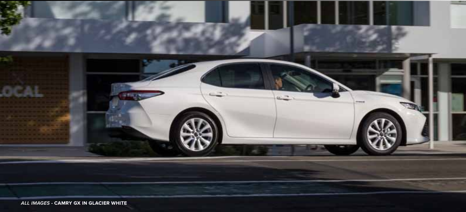
ALL IMAGES - CAMRY GX IN GLACIER WHITE