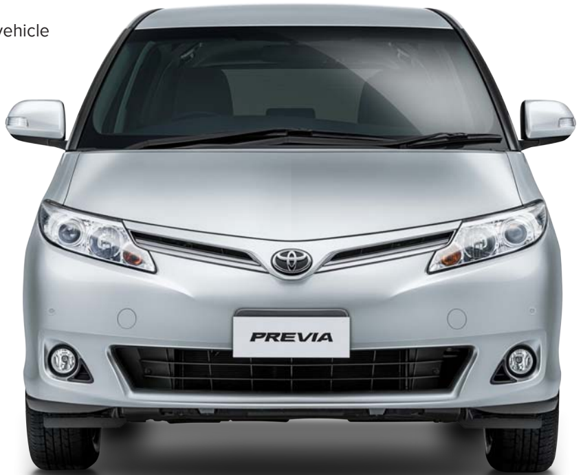
PREVIA IN SILVER PEARL

Transporting up to eight occupants is a heavy responsibility. That's why Toyota engineers have carefully considered whatever may lie around that next corner, incorporating numerous active and passive safety features to keep you safe.