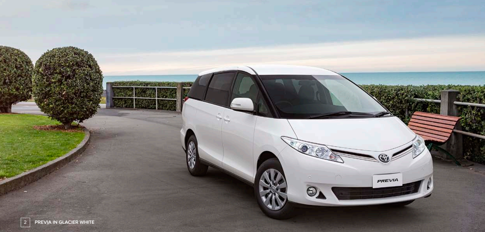
2 PREVIA IN GLACIER WHITE