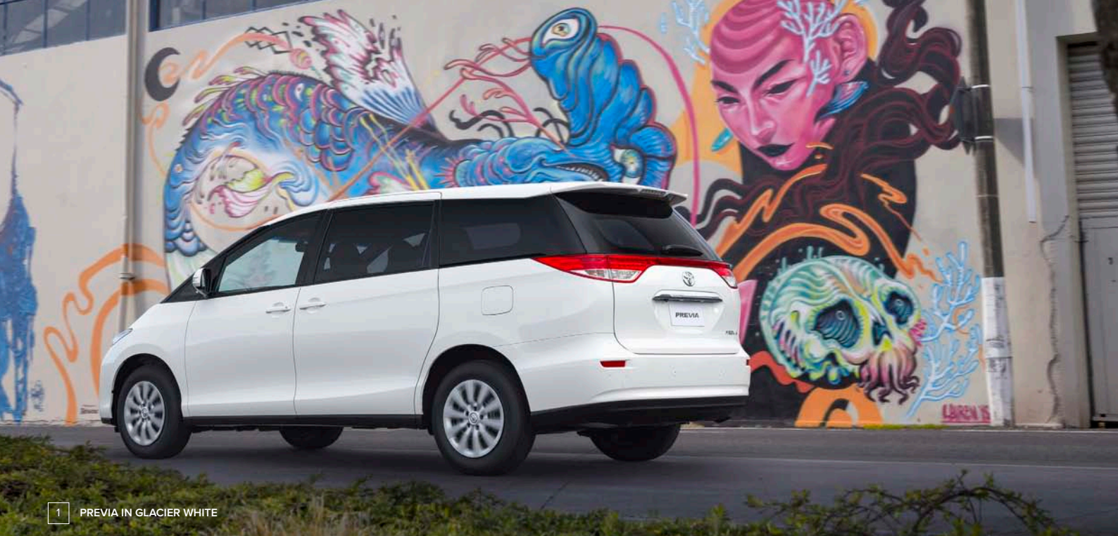
1 PREVIA IN GLACIER WHITE