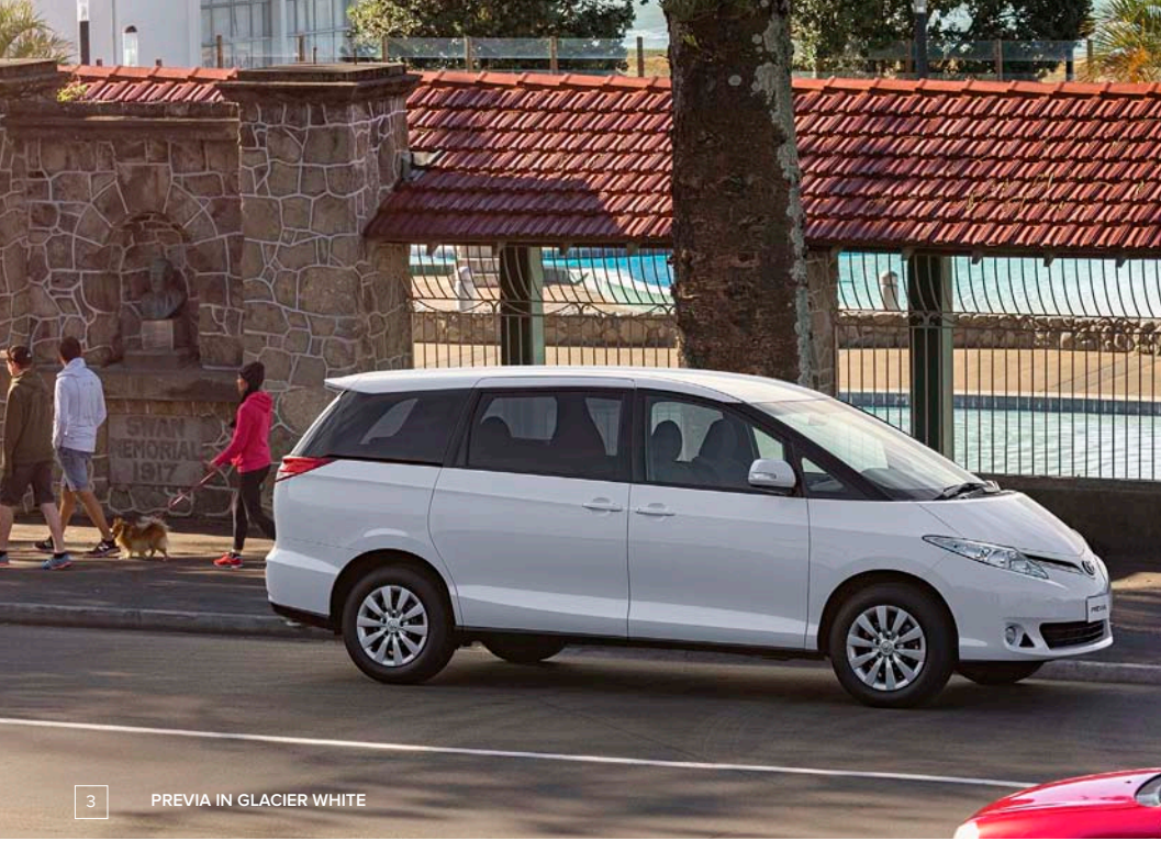
3 PREVIA IN GLACIER WHITE