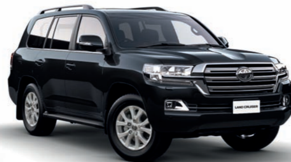
218 Eclipse MICA - FIRM DEALER ORDER