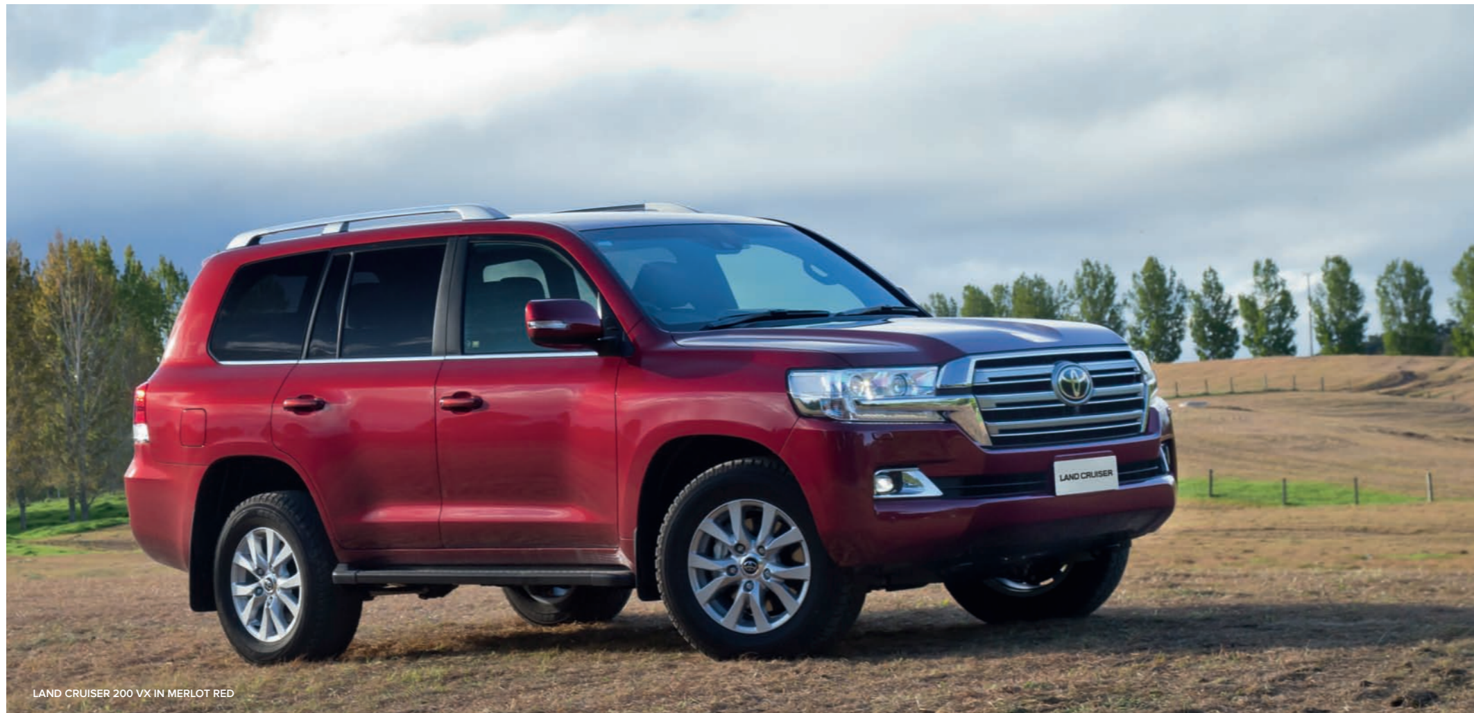
LAND CRUISER 200 VX IN MERLOT RED