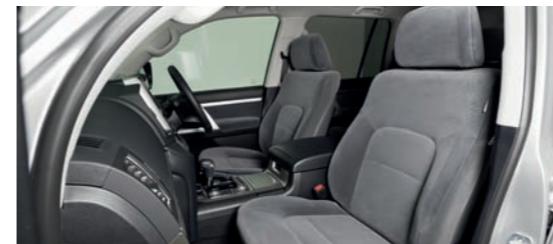
VX GREY FABRIC