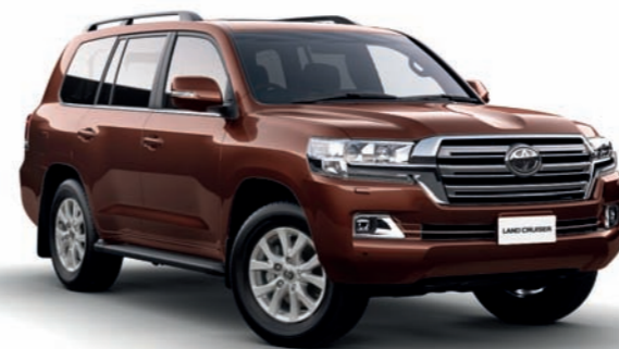
4S6 Copper Brown MICA