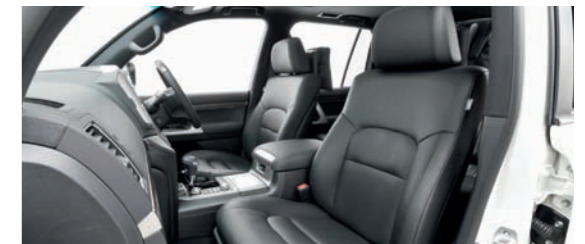
VX Limited BLACK LEATHER ACCENTS