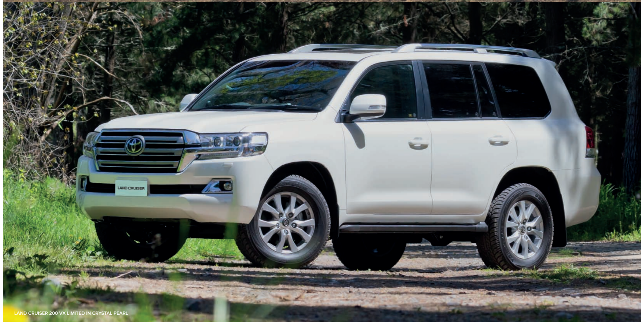
LAND CRUISER 200 VX LIMITED IN CRYSTAL PEARL