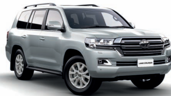
1F7 Silver Pearl METALLIC