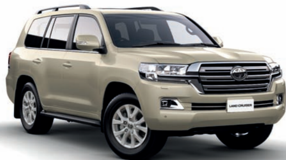
4R3 Vintage Gold MICA METALLIC - FIRM DEALER ORDER