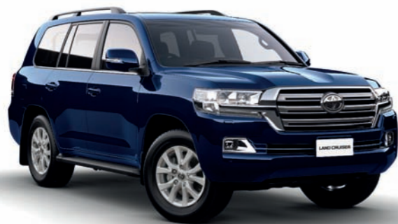
8P8 Blue Onyx MICA