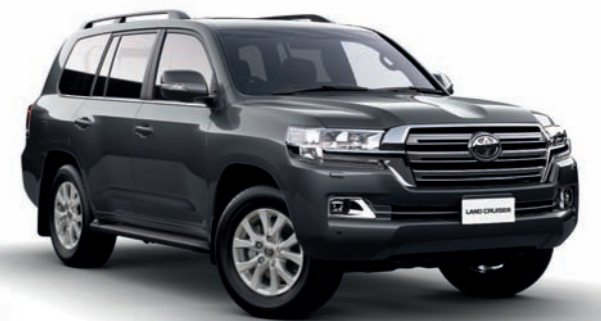
1G3 Graphite METALLIC