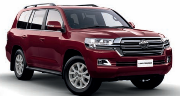
3Q3 Merlot Red MICA METALLIC