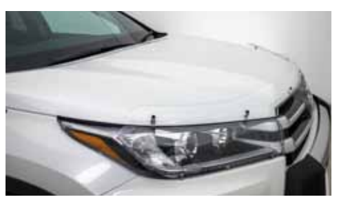
Bonnet Protector. This acrylic bonnet protector is custom-shaped to protect the bonnet from stone chips, insects and paint damage. Resistant to UV discolouration.

*Whichever comes first. Warranty valid from when accessory fitted, at time of new vehicle purchase at your authorised Toyota Dealer.