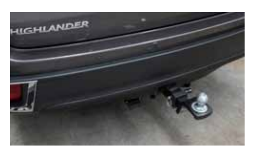
Towbar and wiring harness. This removable tongue tow bar and accessories allow you to tow a maximum braked load of 2000kg and unbraked load of 700kg. Tested to stringent standards you'll have peace of mind no matter what you tow.