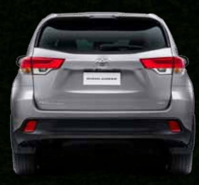
HIGHLANDER GX IN PREDAWN GREY

*Fuel consumption and CO<sub>2</sub> emissions will vary depending on driving conditions/style, vehicle condition and options/accessories fitted. Fuel consumption (combined ADR 81/02).