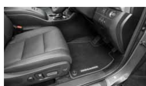
Carpet Floor Mats. Protect the floor area of your Highlander from daily wear and tear with tailored carpet floor mats. The driver's side floor mat features two retaining clips to ensure it stays securely in place.