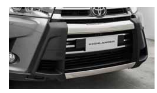
Nudge Bar. Integrates with Highlander's bold front design. The Nudge Bar and has been subjected to Toyota's rigorous testing whilst the unique bracket system has been developed in tandem with the vehicle to ensure correct deployment of airbags to give you peace of mind.