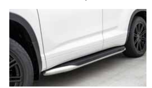
Side steps. Crafted from high grade polished stainless steel to add serious style while making entering and exiting your Highlander easier. Complete with anti-slip surfaces for added safety, side steps not only look fantastic, but give you that extra reach to load up your roof racks for a weekend of fun.