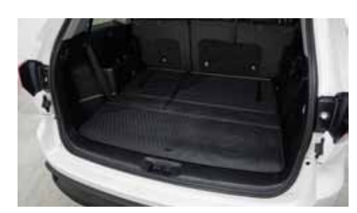
Cargo mat. Protect the cargo area of your Highlander with this cargo mat. Custom moulded to ensure a secure fit and made from a highly durable and flexible rubber, it manages dirt with ease. Allows for use of the rear se