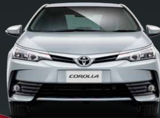
COROLLA GLX IN SILVER ASH