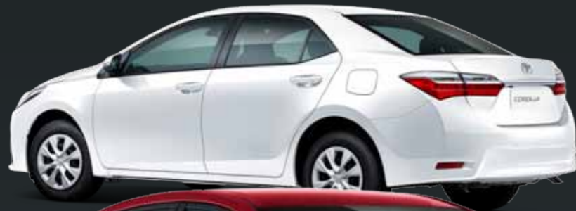
COROLLA GX IN GLACIER WHITE