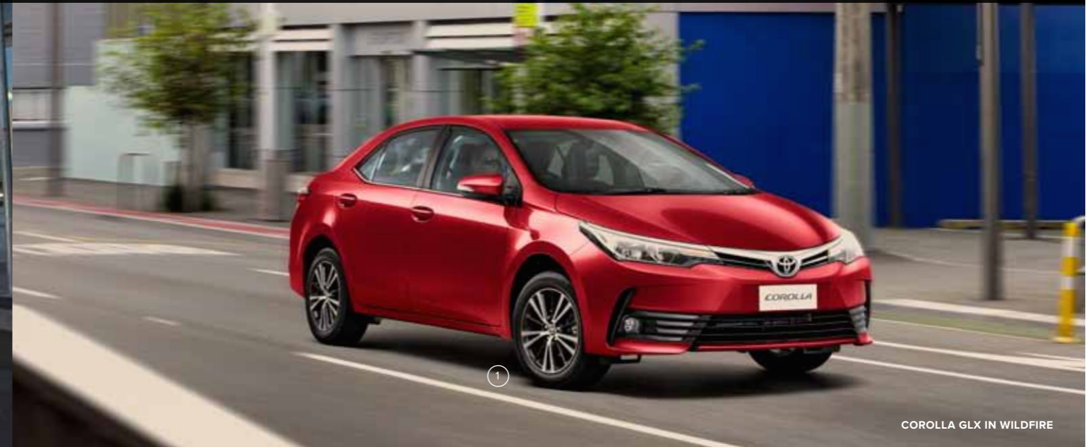
COROLLA GLX IN WILDFIRE