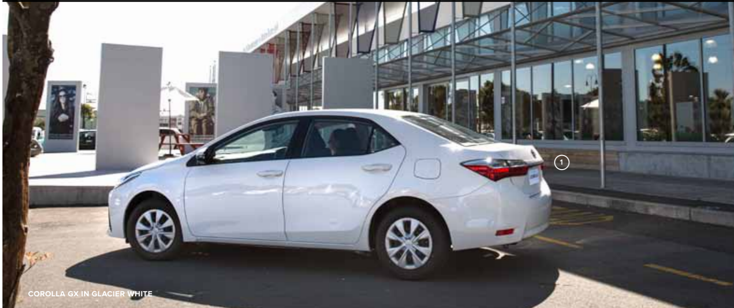
COROLLA GX IN GLACIER WHITE

Giving you even more premium with your practicality, the GLX builds on comprehensive specification with even more impressive features, such as a Satellite Navigation system with SUNA traffic avoidance*, smart entry and start system, along with a Multi-Information Display (MID) screen, front fog lights and stylish 16" alloy wheels.