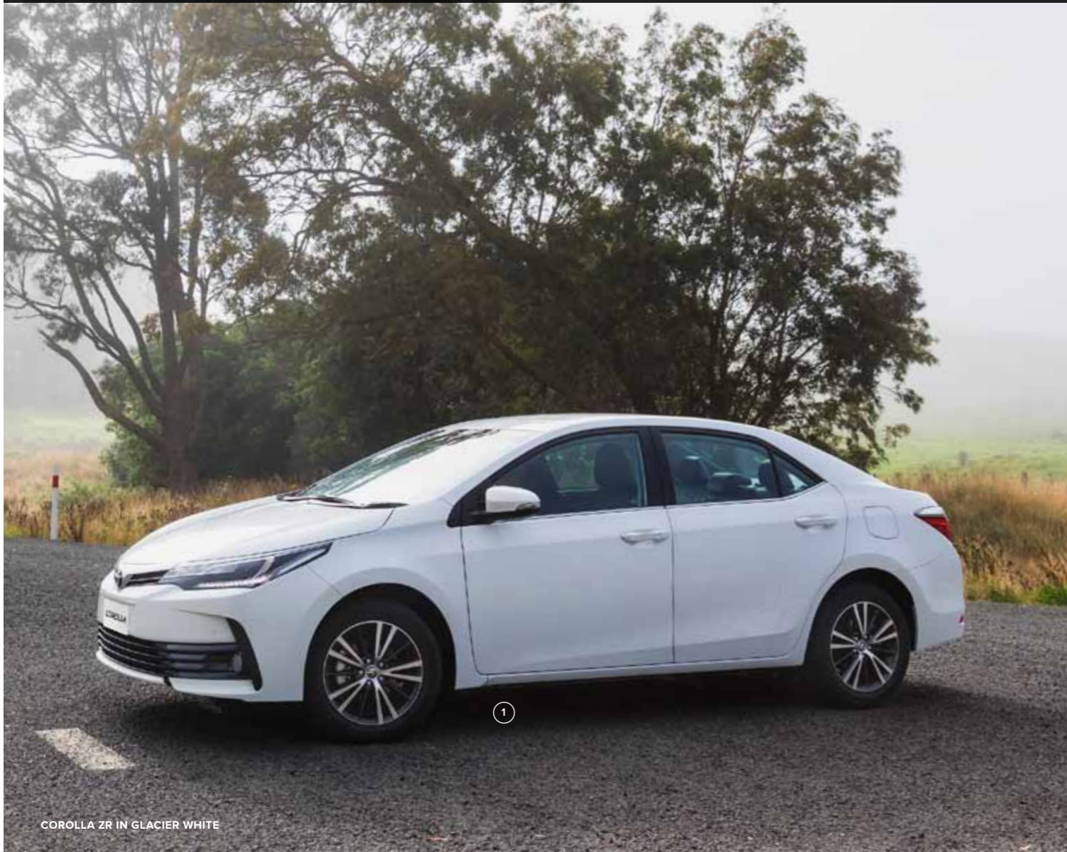
COROLLA ZR IN GLACIER WHITE

The top of the range Corolla Sedan ZR boasts leather accented seat facings and premium technology, including LED Daytime Running Lights (DRL), an integrated alarm system, paddle shifters on the steering wheel, rain sensing windscreen wipers, climate control air conditioning and Satellite Navigation with SUNA traffic avoidance system*.