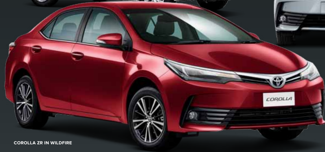
COROLLA ZR IN WILDFIRE

With a powerful 1.8-litre petrol engine at the heart of the Corolla sedan, your journey will be comfortable whether it's across town or out on the state highway. Power doesn't come at the cost of fuel economy though; thanks to the use of low friction components and Toyota's fantastic engine efficiency technology, the Corolla sedan delivers improved combined fuel economy of 6.4-litres/100km*.