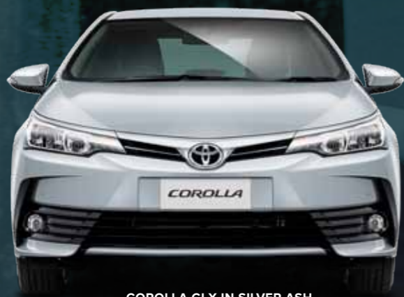
COROLLA GLX IN SILVER ASH