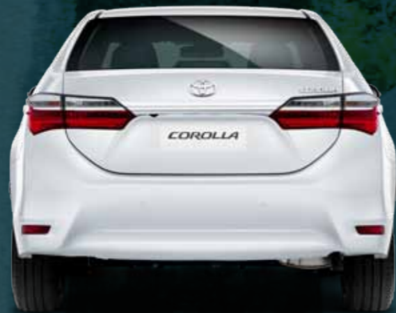
COROLLA GX IN GLACIER WHITE

The Corolla sedan range takes an iconic nameplate and builds on it with great modern looks, practical dimensions, impressive levels of comfort, fantastic fuel economy and the latest in Toyota safety technology. The proven reliability of the world's biggest-selling nameplate is just the start; with three different grades of Corolla sedan to choose from, the Corolla range has never presented so much specification.