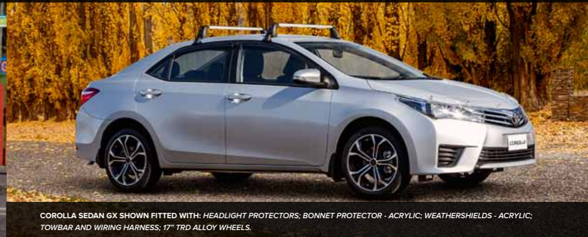
COROLLA SEDAN GX SHOWN FITTED WITH: HEADLIGHT PROTECTORS; BONNET PROTECTOR - ACRYLIC; WEATHERSHIELDS - ACRYLIC; TOWBAR AND WIRING HARNESS; 17" TRD ALLOY WHEELS.

Only Toyota Genuine Accessories are designed and manufactured to the same high standard as original parts. They are engineered using manufacturer data to ensure that vehicle integrity is not compromised. This means the functionality of important precision systems such as airbags will not be impaired by their installation.