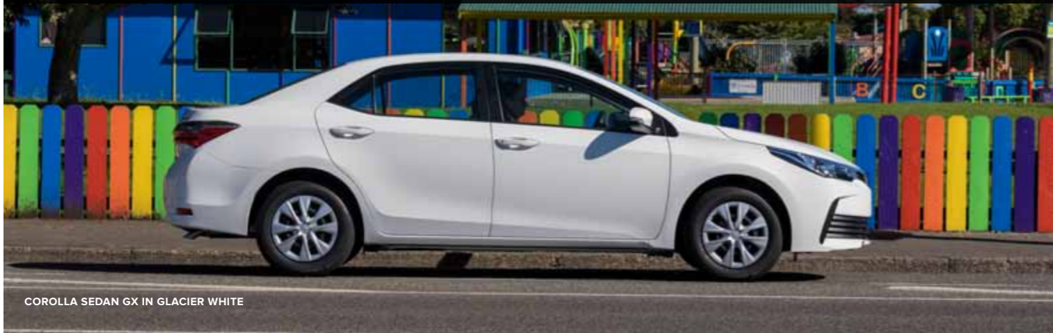
COROLLA SEDAN GX IN GLACIER WHITE

The Corolla range now features the Toyota Safety Sense package. The result of years of research and development, Toyota Safety Sense brings together a number of safety technologies, including a Pre-Crash Safety System, Lane Departure Alert and Automatic High Beam.