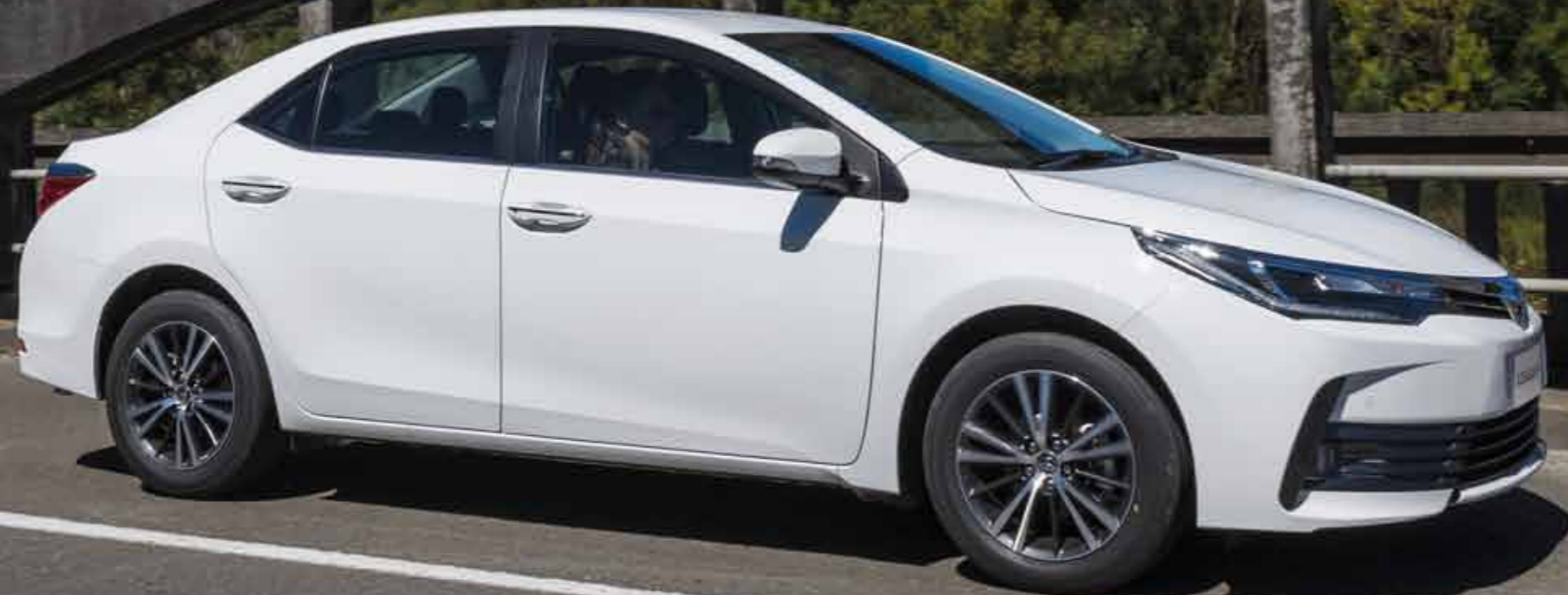
COROLLA ZR IN GLACIER WHITE