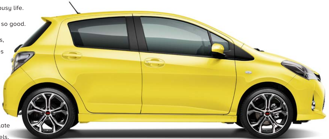
YARIS ZR IN VIVID YELLOW

The Yaris ZR takes this restyle template even further, with 17" TRD alloy wheels, sports-style side skirts and rear roof spoiler, a black rear diffuser (matched with a chrome-tipped exhaust) and stylish green-tinted windscreen, side glass and rear privacy glass.