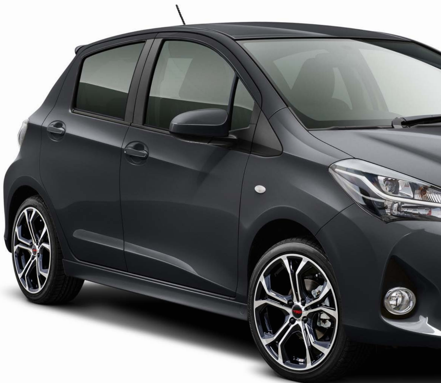
YARIS ZR IN GRAPHITE