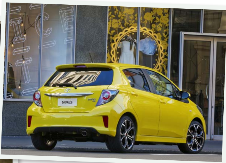
YARIS ZR IN VIVID YELLOW

Through successive generations the city-friendly Yaris has proven itself a trusty hatchback. It continues to excel as a talented compact car with all the features a big car boasts. Now, with a fresh new design, an incredible level of specification across the range and a new, sporty ZR model featuring plenty of premium extras, the Yaris is set to surprise. We all need a little Yaris.