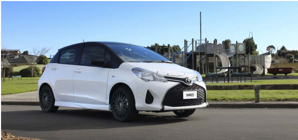
Yaris GX 'Sport Concept' shown fitted with; headlight protectors ; bonnet protector – acrylic; side skirts; rear spoiler; towbar and wiring harness; 17x7" Aftermarket Motegi MR119 (from DTM Wheels) and custom matte black vinyl graphic.