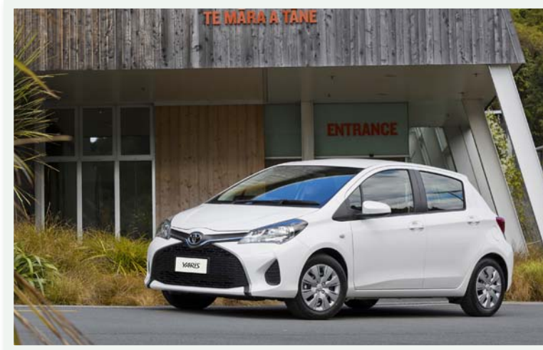
YARIS GX IN GLACIER WHITE