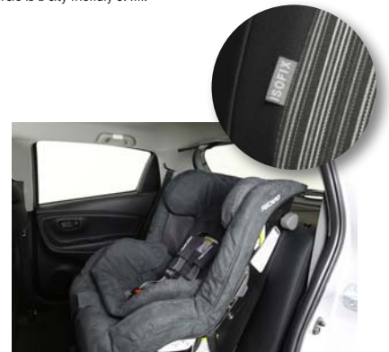
Well-located ISOFIX rear seating fixing points enable child seating to be more easily attached.