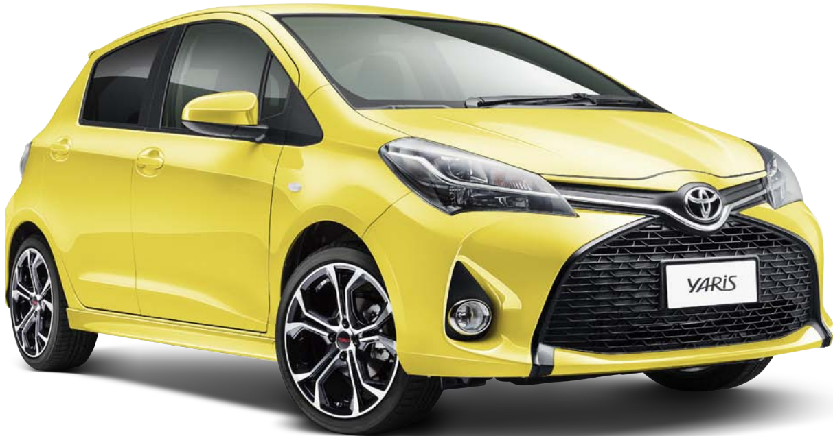
YARIS ZR IN VIVID YELLOW

The Yaris ZR effortlessly underscores everything that is fun about a compact hatchback, with sports-style additions like side skirts, a rear roof spoiler and LED lights in the front and rear. Stylish privacy glass, an exclusive alloy design and sporty accents inside the cabin complete the package. There's also the option of adding Satellite Navigation with voice recognition and SUNA Traffic Avoidance System which provide real-time traffic data and alternative route information in order to help the driver avoid delays.