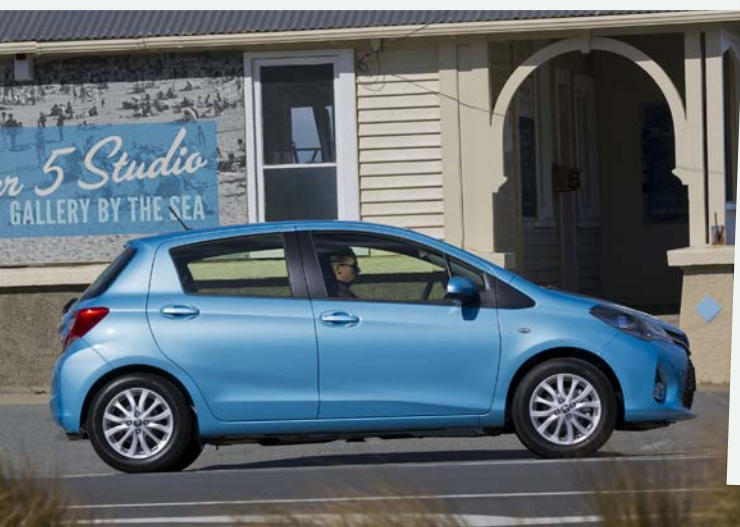
YARIS SX IN COOL SODA