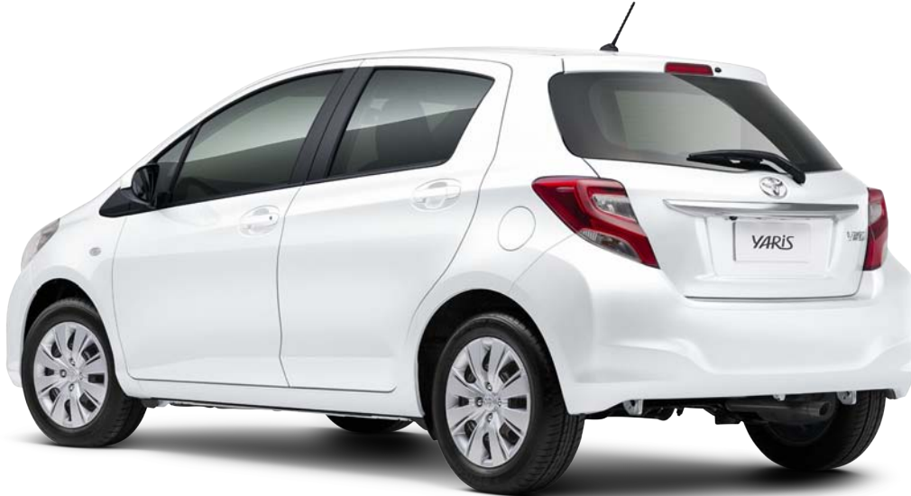
YARIS GX IN GLACIER WHITE

The practical GX is packed with the sort of convenience items and standard technology that will truly surprise. A comfortable cabin, with impressive features such as a reversing camera and Bluetooth hands-free capability give the GX specifications you'd usually expect from a larger vehicle.