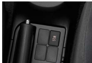
Vehicle Stability Control (VSC) and Traction Control (TRC) work in the background to add an extra margin of safety.

Electric Power Steering (EPS) is vehicle speed sensitive so low speed manoeuvres require minimal effort while at highway speeds less assistance is provided. The turning circle is a city friendly 9.4m.