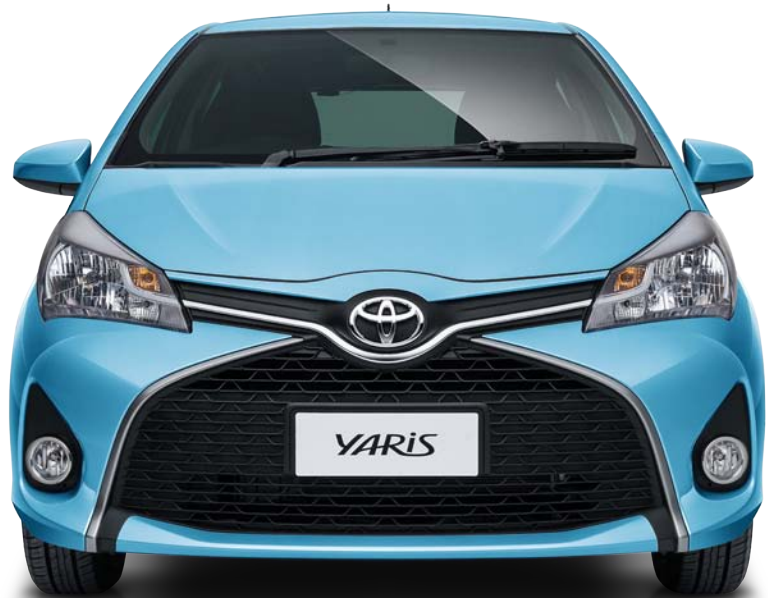
YARIS SX IN COOL SODA

The 4-speed ECT automatic transmission really makes driving in the city stress-free.