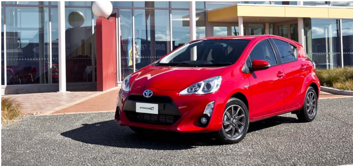
Prius c shown fitted with 15 inch Podium alloy wheels.