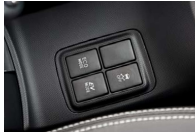
Vehicle Stability Control (VSC) and Traction Control (TRC) work in the background to add an extra margin of safety.

And for even more peace of mind, the technologically advanced body structure of the Prius c has been designed to minimise the effect of any collision with pedestrians.