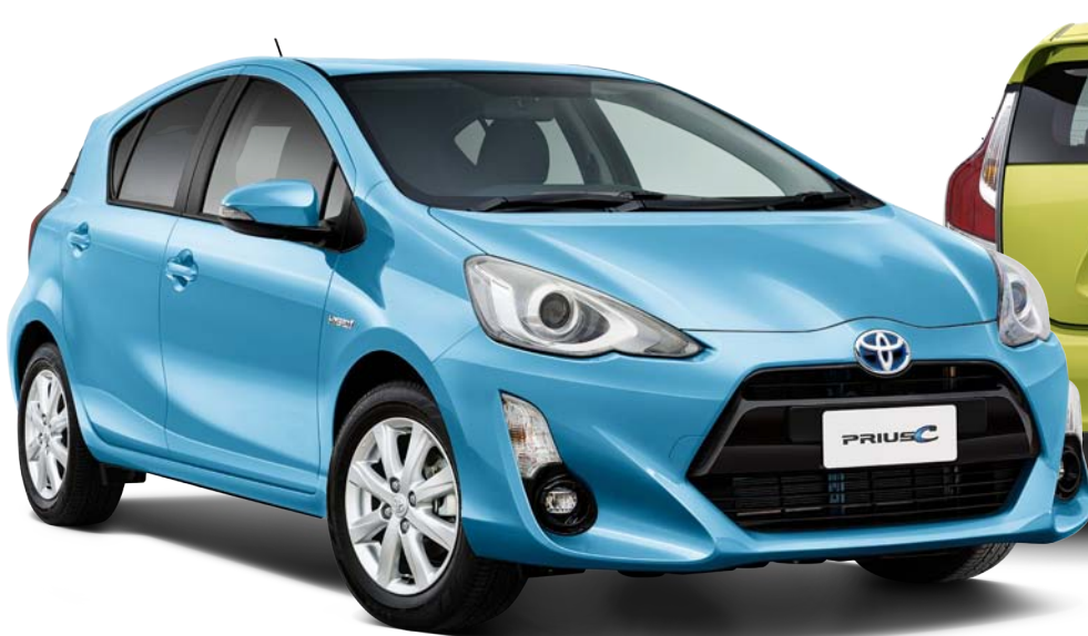
Prius c s-Tech in Cool Soda

The Prius c s-Tech gives you even more, adding a stylish leather-like interior, LED headlights and privacy glass to the comprehensive Prius c specification.