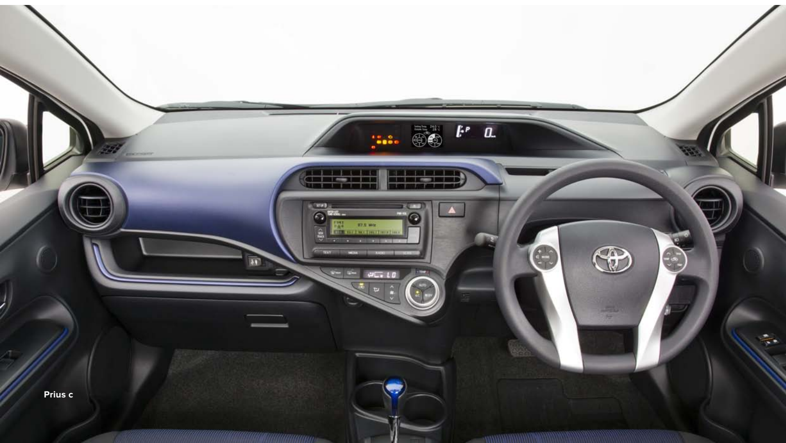
Touch Tracer steering wheel controls for changing audio or air conditioning settings without looking down help keep you safe.