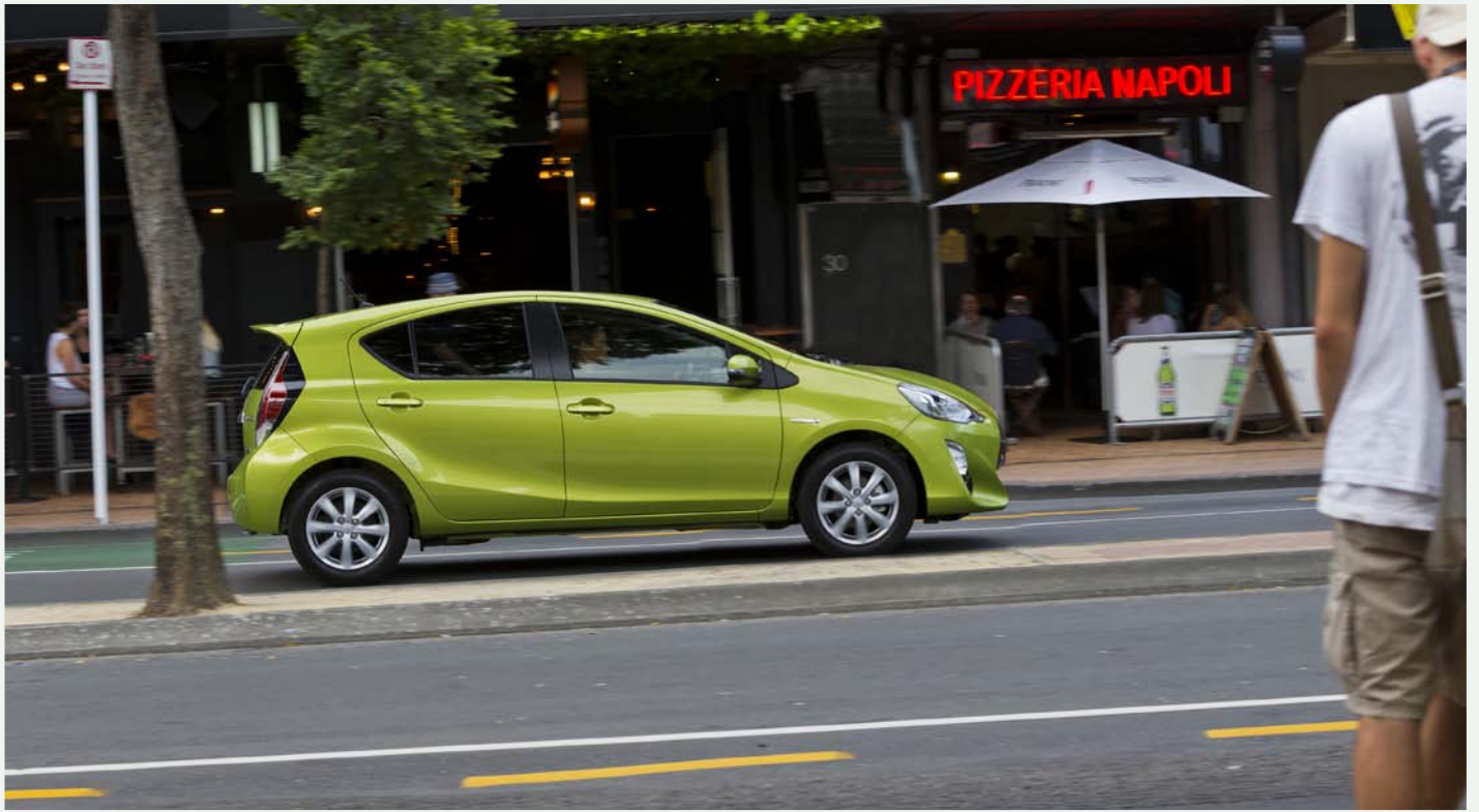
Prius c s-Tech in Zest