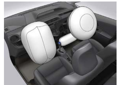
Prius c occupants are well protected with driver and passenger front, front side, front/rear curtain shield and driver's knee airbags.