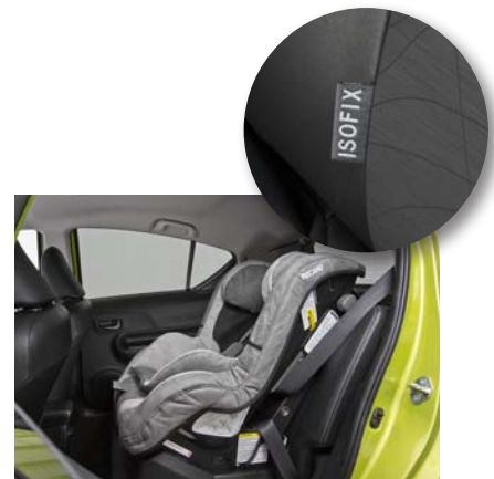
Well-located ISOFIX rear seating fixing points enable child seating to be more easily attached.