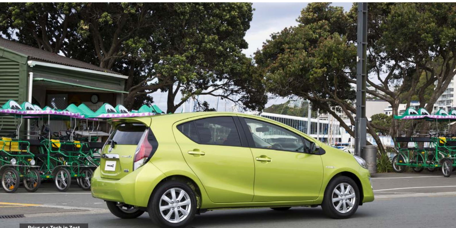
Prius c s-Tech in Zest

The Prius c has instant street appeal, with a compact body style that packs space and technology aplenty into its 3995mm length.