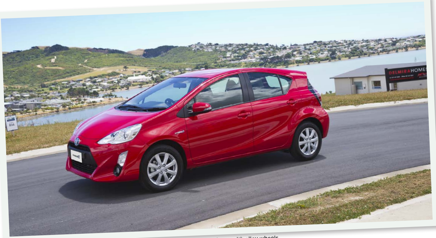
Prius c in Cherry with alloy wheels