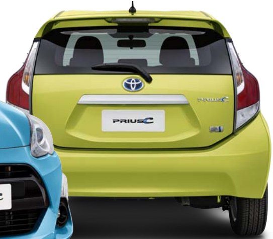
Prius c s-Tech in Zest