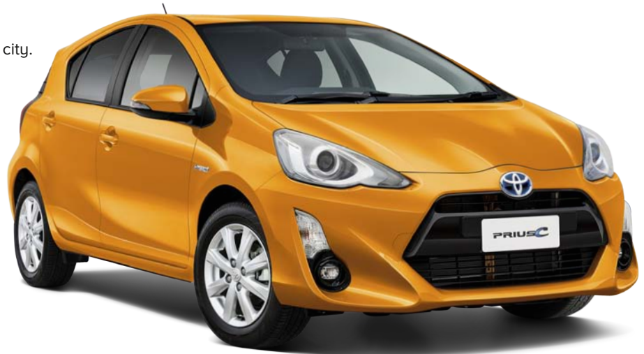
Prius c s-Tech in Tango

In all there are nine colour choices available that accentuate the crisp exterior styling of the smart Prius c, including Zest and Tango, recent additions to the range.