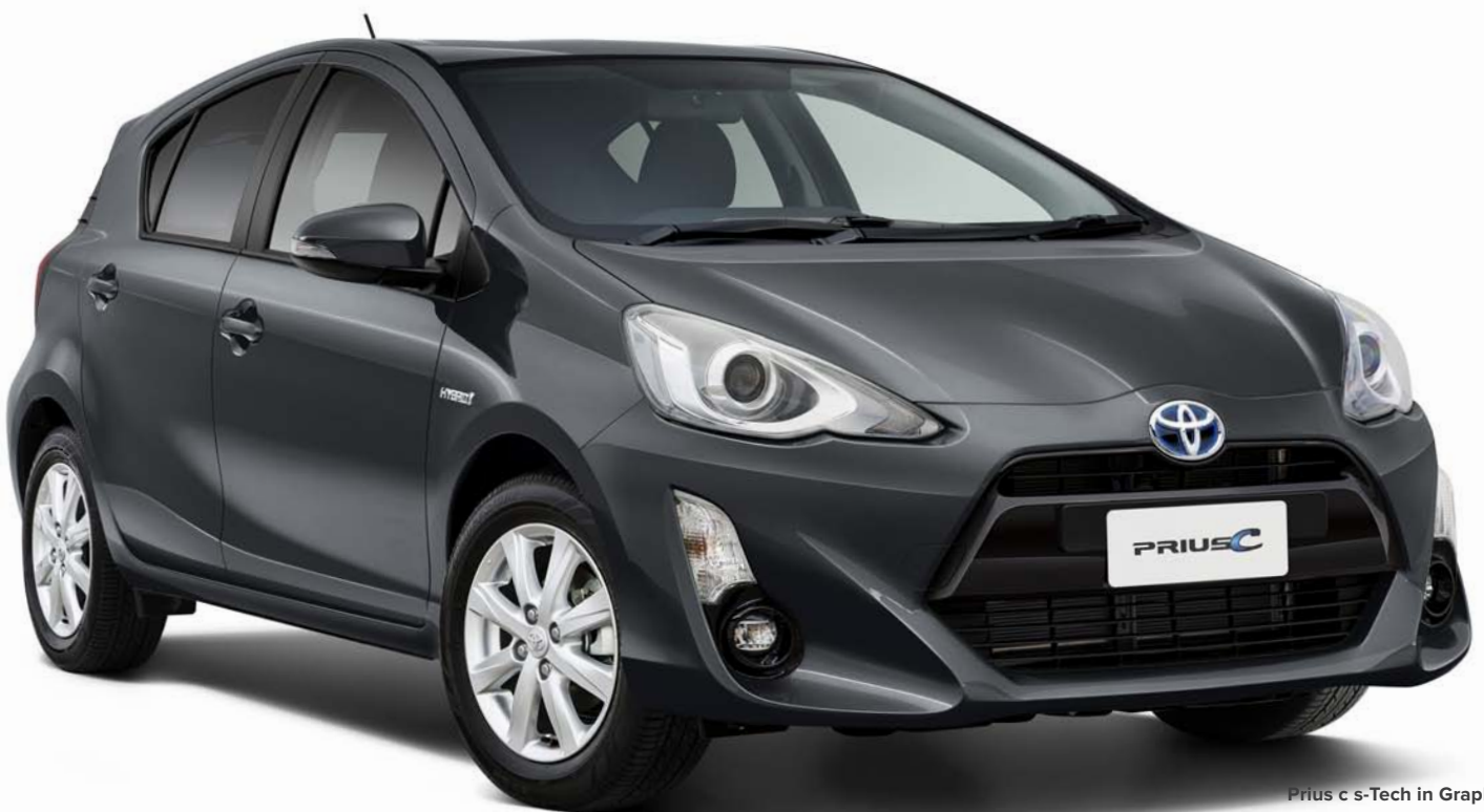
Prius c s-Tech in Graphite

The Prius c is a spirited alternative to the mainstream notion of what a hybrid vehicle should be, delivering high-tech driving fun, paired with an affordable price tag.