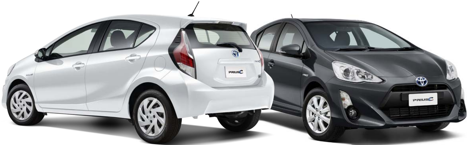
Prius c in Glacier White with steel wheels

The 1.5 litre petrol engine with Hybrid Synergy Drive generates all the power you could want with the fuel economy and leading environmental standards you expect from this leading environmentally-minded technology.