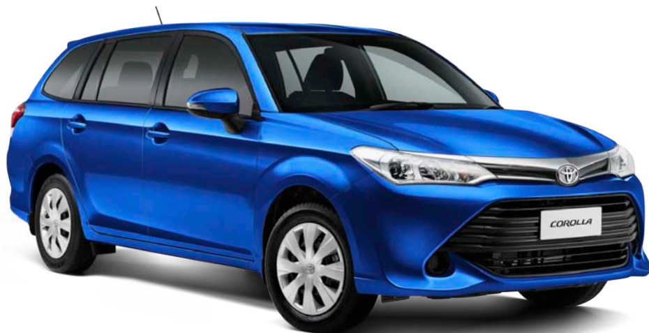
COROLLA WAGON IN TIDAL BLUE