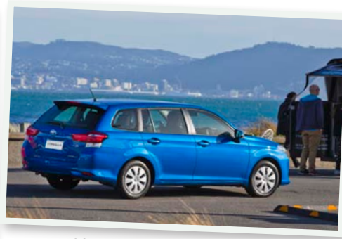
COROLLA WAGON IN TIDAL BLUE