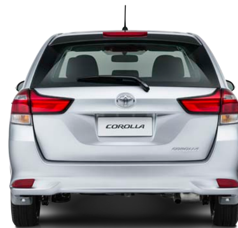
COROLLA WAGON IN SILVER PEARL