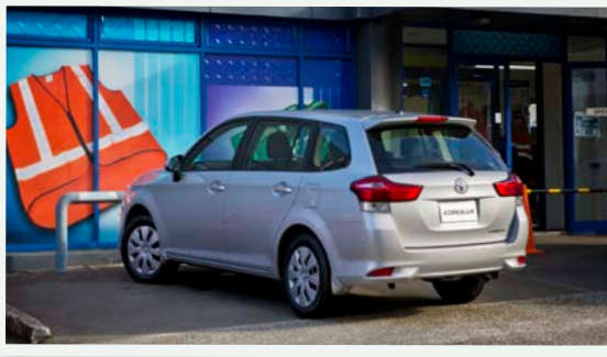
COROLLA WAGON IN SILVER PEARL