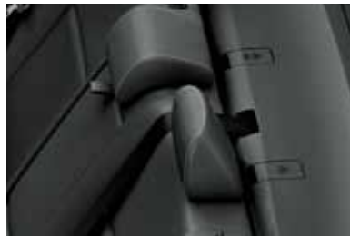
Three tether anchor fixing points on the rear parcel shelf enable child seating to be easily attached.