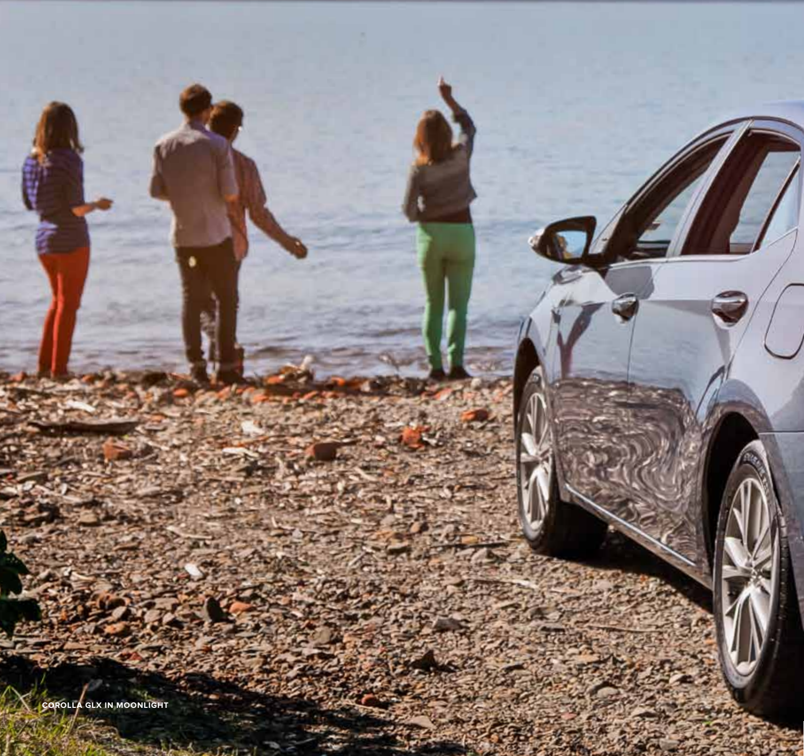
COROLLA GLX IN MOONLIGHT