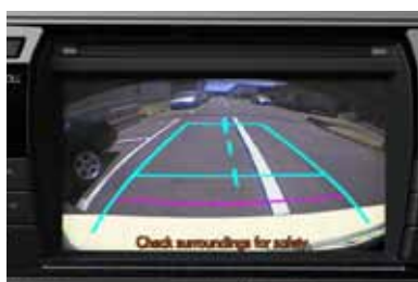
Driver's of all models benefit from a rear view camera with static backing lines.