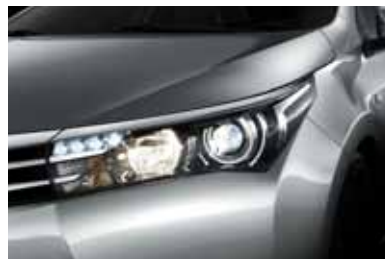
Highly visible LED Daytime Running Lights (DRL) ensure you'll be seen sooner in Corolla ZR.