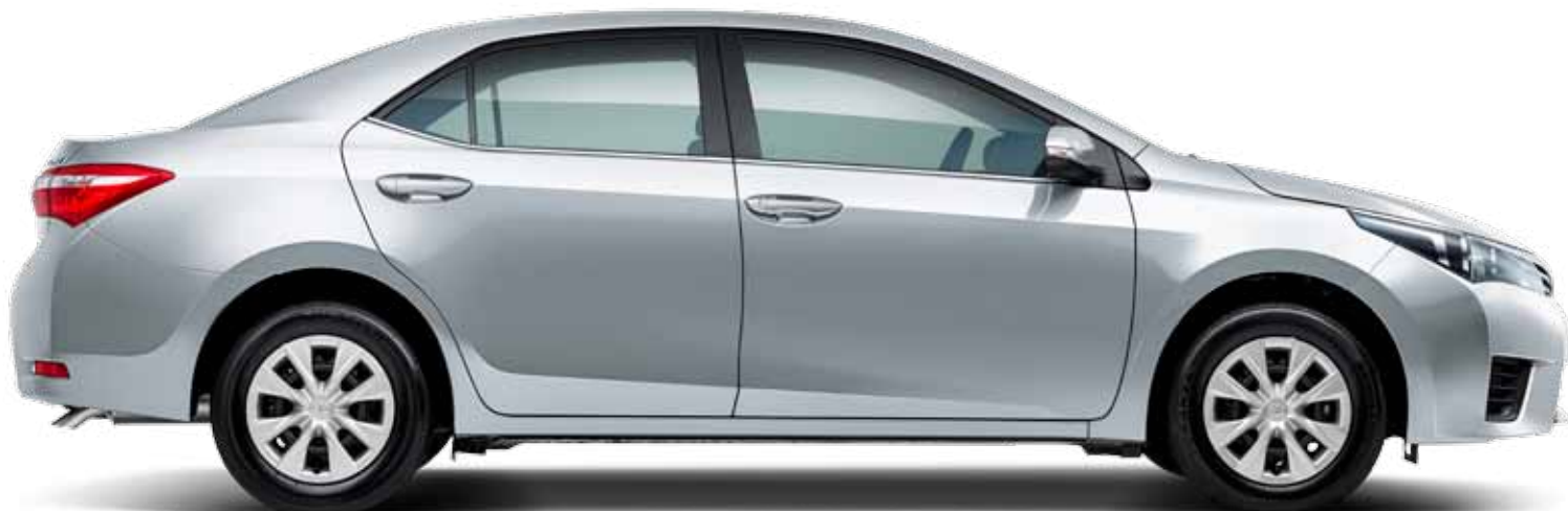
COROLLA SEDAN GX IN SILVER PEARL

A spacious cabin, with impressive features such as a reversing monitor, 5-star ANCAP safety rating, rear park assist and Bluetooth hands-free capability makes the GX a fantastic proposition for businesses and families alike.