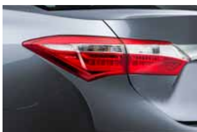
Brake lights and the high stop light on Corolla Sedan ZR are LED for efficiency and powerful illumination.