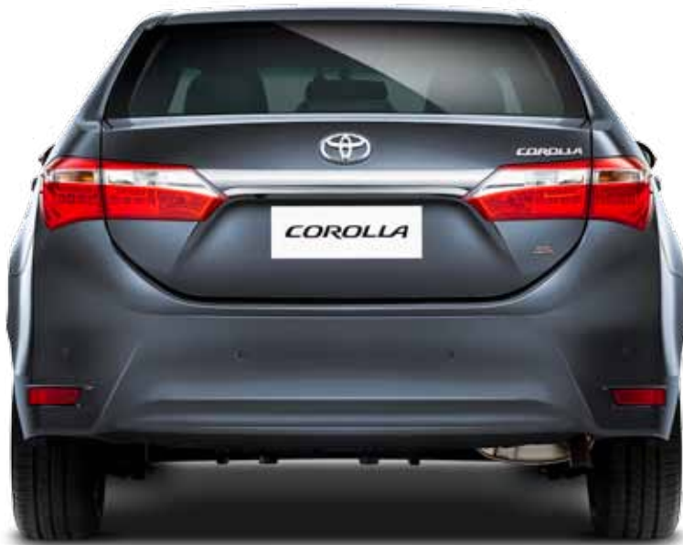
COROLLA SEDAN ZR IN MOONLIGHT

Corolla Sedan has achieved 5-stars in the ANCAP safety test.