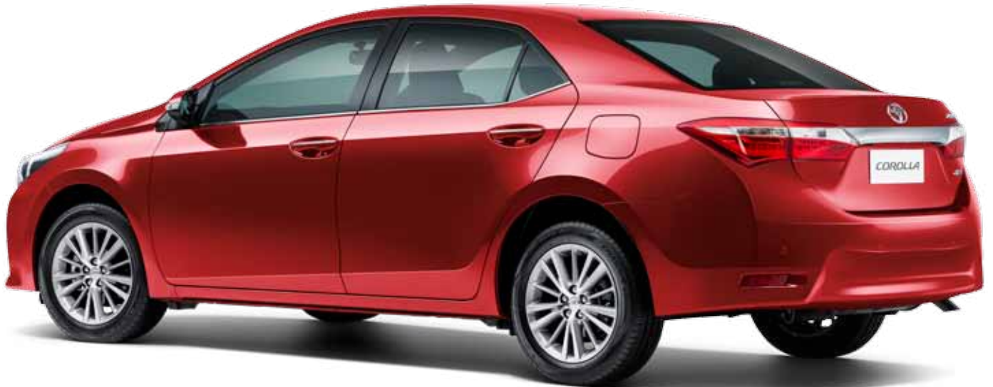
COROLLA SEDAN GLX IN WILDFIRE

Giving you even more premium with your practicality, the GLX builds on comprehensive specification with even more impressive features, such as a smart entry and start system which allows the driver to unlock the doors and start the car just by having the key in their pocket or bag, along with a Multi-Information Display (MID) screen, fog lights and stylish 16" Alloy wheels.