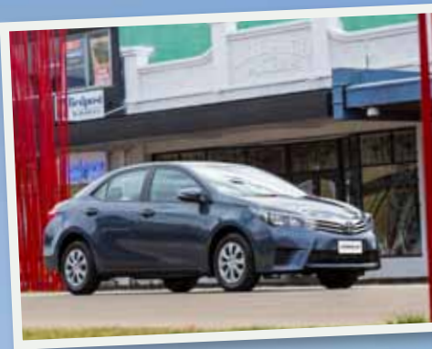
COROLLA GX IN MOONLIGHT