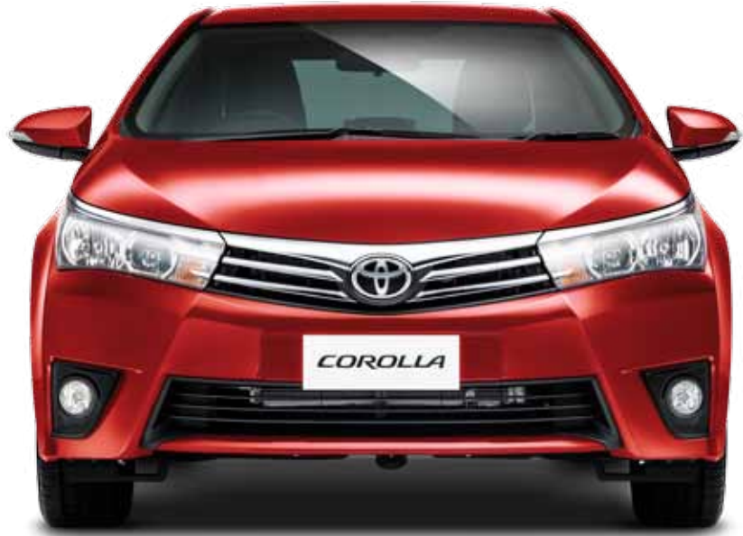
COROLLA SEDAN ZR IN WILDFIRE

With a peerless reputation for practicality and reliability, the new generation Corolla Sedan also arrives packed with convenience features and technology that will surprise. Mixing a comprehensive selection of standard equipment with the option of three distinct grades and a stylish exterior design, there is a Corolla to suit every driver, every day.