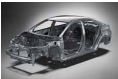
The foundation for Corolla Sedan safety is a body built of high-grade steel designed to protect all occupants.