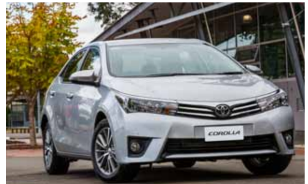
A reversing camera and rear parking sensors as standard across the range - part of Toyota's commitment to keeping you and your loved ones safe.