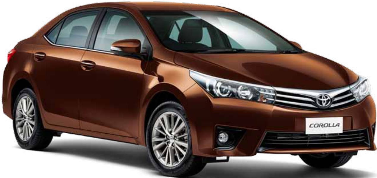
COROLLA SEDAN ZR IN SUNSET BRONZE

The top of the range Corolla Sedan ZR boasts genuine leather seat facings and premium technology, including LED Daytime Running Lights (DRL), an integrated alarm system, paddle shifters on the steering wheel, rain sensing windscreen wipers, climate control air conditioning and satellite navigation with SUNA traffic updates.