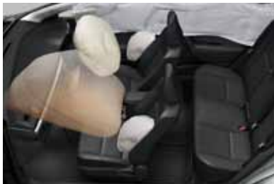
Corolla Sedan occupants are well protected with driver and passenger front, front side, front/rear curtain shield and driver's knee airbags.

The Corolla Sedan range also now features a reversing camera and full colour monitor with guidance lines, along with rear parking sensors. The GLX and ZR grades also feature front parking sensors; together this comprehensive line-up of sensors is designed to keep you and your loved ones safe.