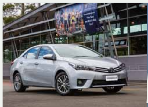
COROLLA GLX IN SILVER ASH