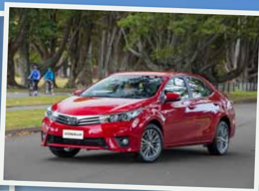
COROLLA ZR IN WILDFIRE