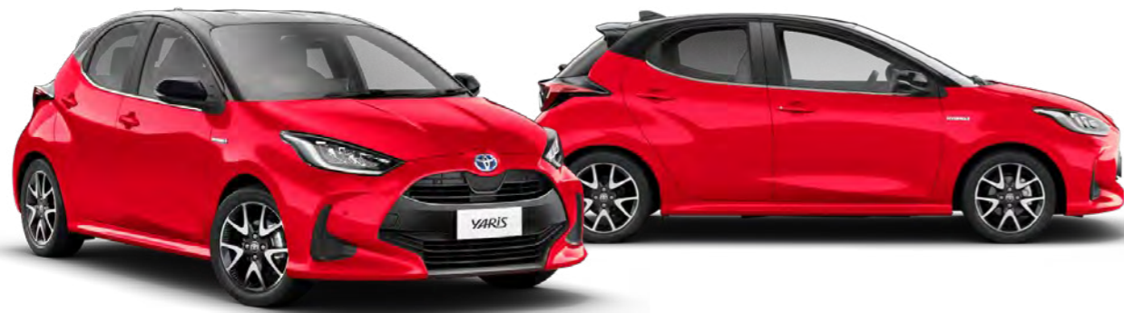
Coral with Ebony roof 2SR | ZR variants only