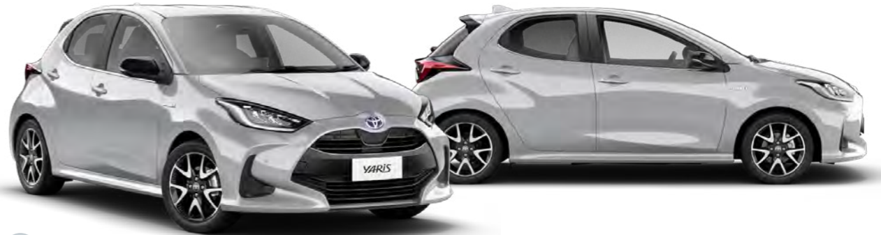
Silver Pearl 1F7