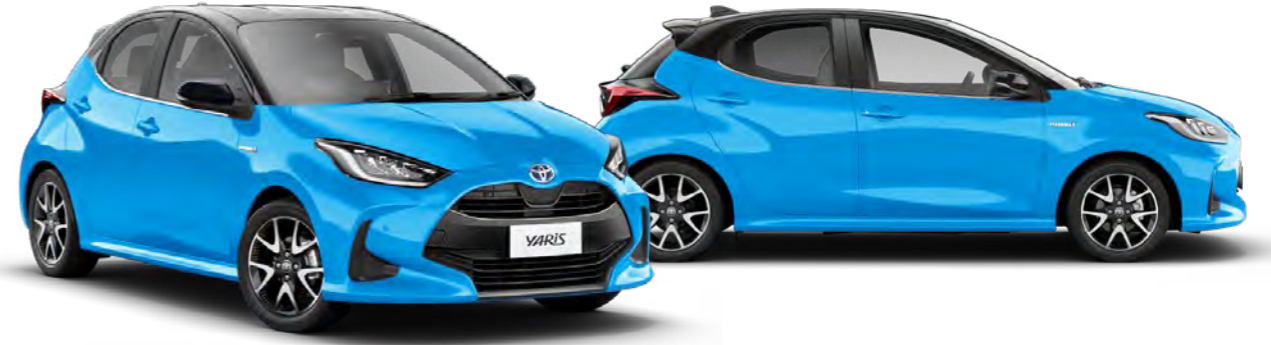
Eclectic Blue with Ebony roof 2RV | ZR variants only