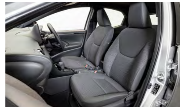
GX BLACK FABRIC