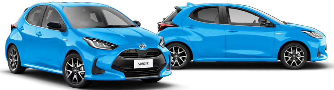
Eclectic Blue 8W9