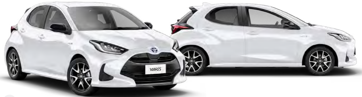
Glacier White 040