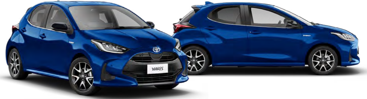
Blue Gem 8W7