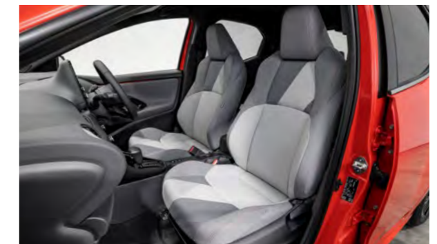
ZR GREY SPORT FABRIC