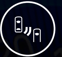
BLIND SPOT MONITOR