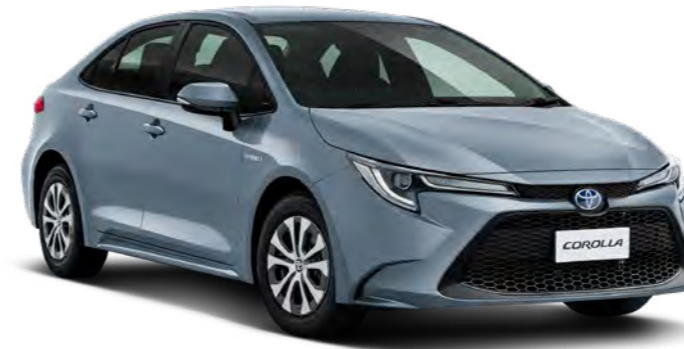
Celestite Grey 1K3