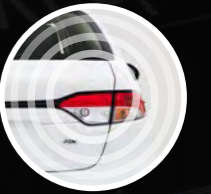
EMERGENCY STOP SIGNAL