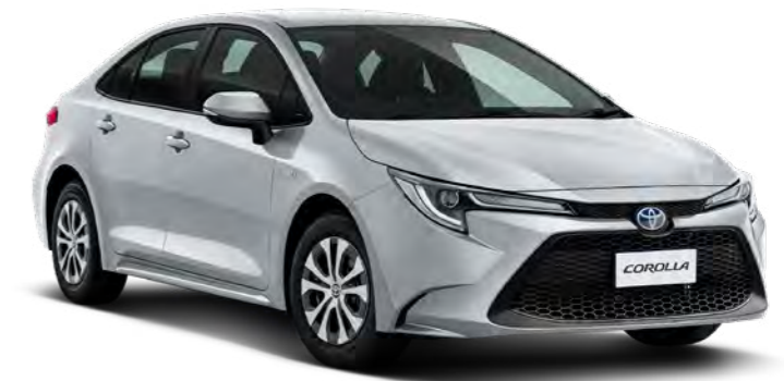
Silver Pearl 1F7