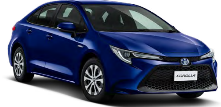
Blue Crush 8W7