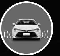
VEHICLE STABILITY CONTROL