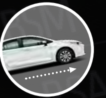
HILL-START ASSIST CONTROL