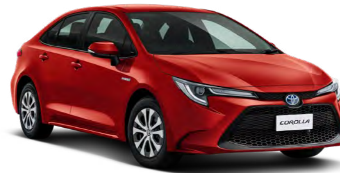
Volcanic Red 3U4