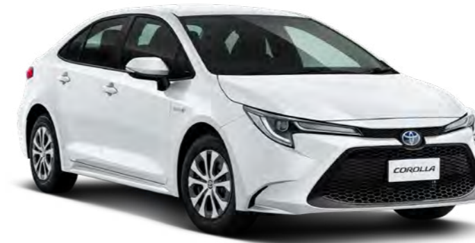
Glacier White 040