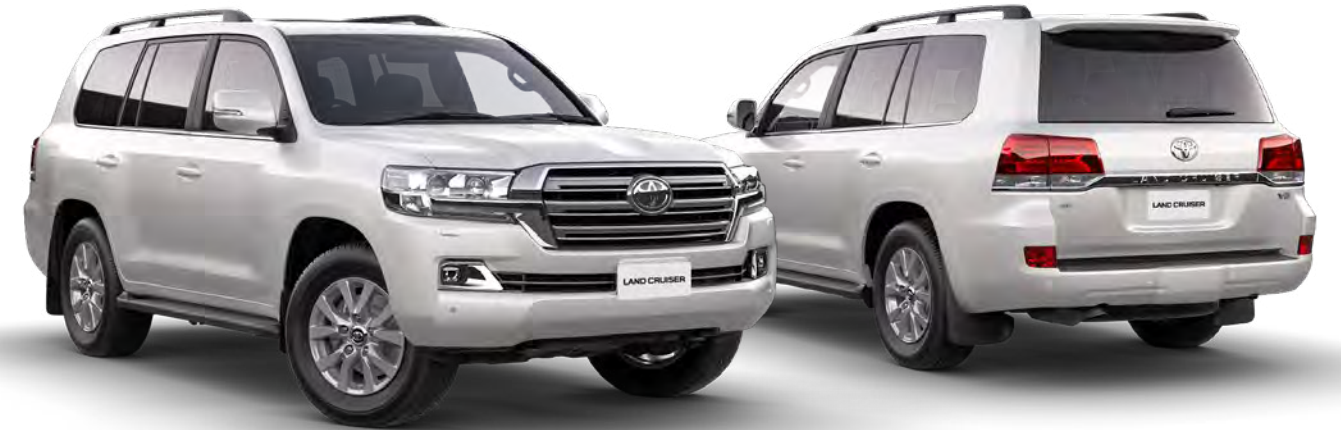
Crystal Pearl 070