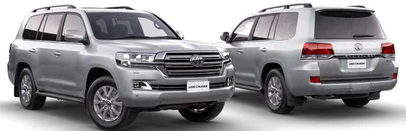
Silver Pearl 1F7