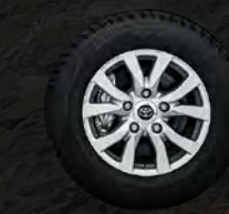
TYRE PRESSURE WARNING SYSTEM