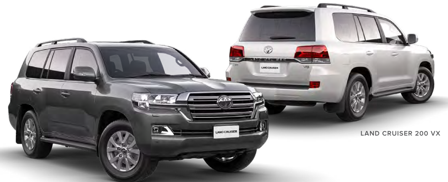
LAND CRUISER 200 VX LIMITED

Whether it's a trip to the snow or the premiere of a show, the Land Cruiser 200 is your dependable, premium partner for the journey ahead.