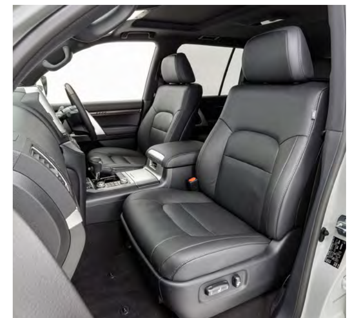
VX Limited BLACK LEATHER ACCENTED