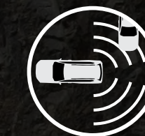
REAR CROSS TRAFFIC ALERT