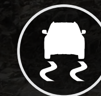
ACTIVE TRACTION CONTROL