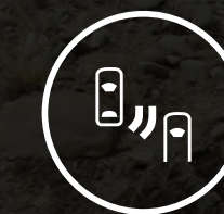
BLIND SPOT MONITOR