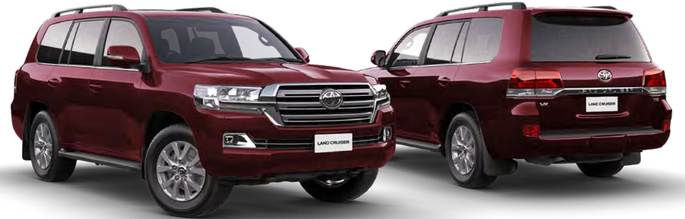
Merlot Red 3Q3