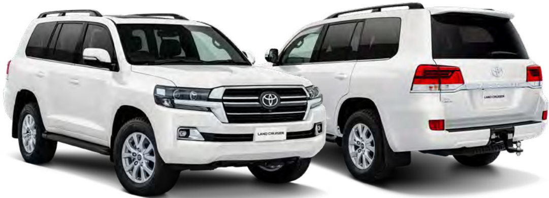
Crystal Pearl 070 Crystal Shine