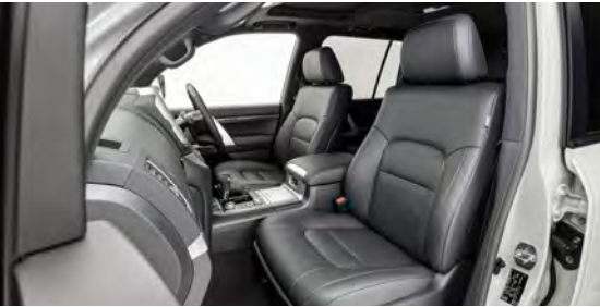
VX Limited Black Leather accented