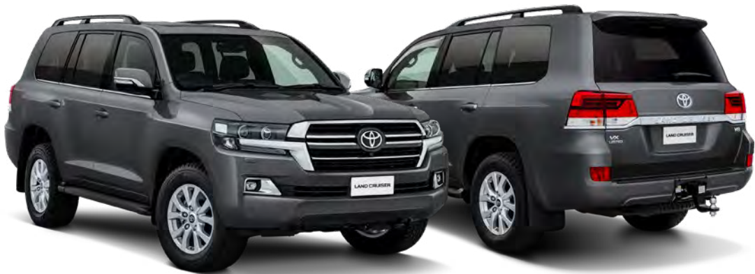
Graphite 1G3 Metallic