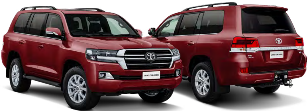
Merlot Red 3Q3 Mica Metallic