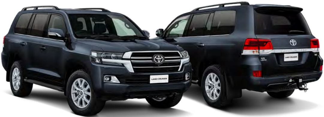
Eclipse 218 Mica