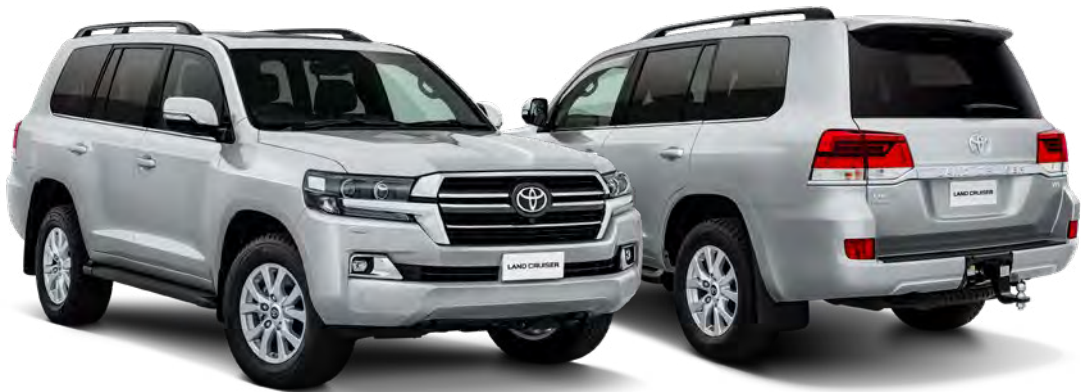
Silver Pearl 1F7 Metallic