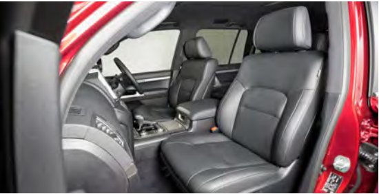
VX Black Leather accented