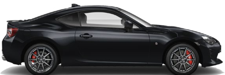
Midnight Black D4S