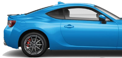
Hyper Blue DAR