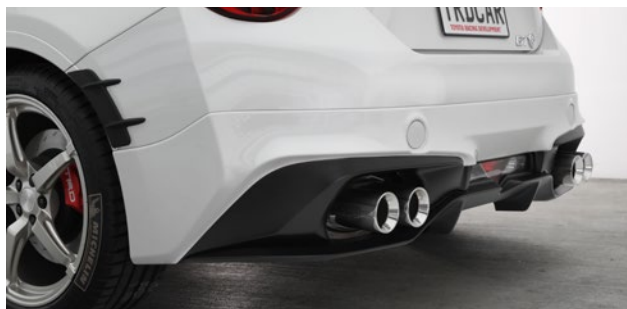
TRD Rear Bumper Spoiler. The Rear Bumper spoiler which is best installed with the TRD side skirts and front spoiler helps to extenuate the already aggressively looking 86. Requires TRD High response muffler.