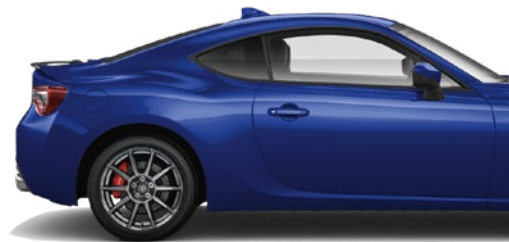
Gravity Blue K3X