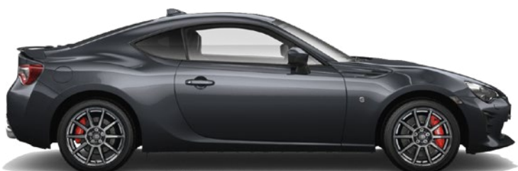
Magnetite Grey P8Y Metallic