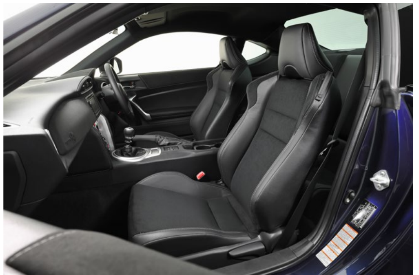
GT86 Black Leather & Alcantara Accented