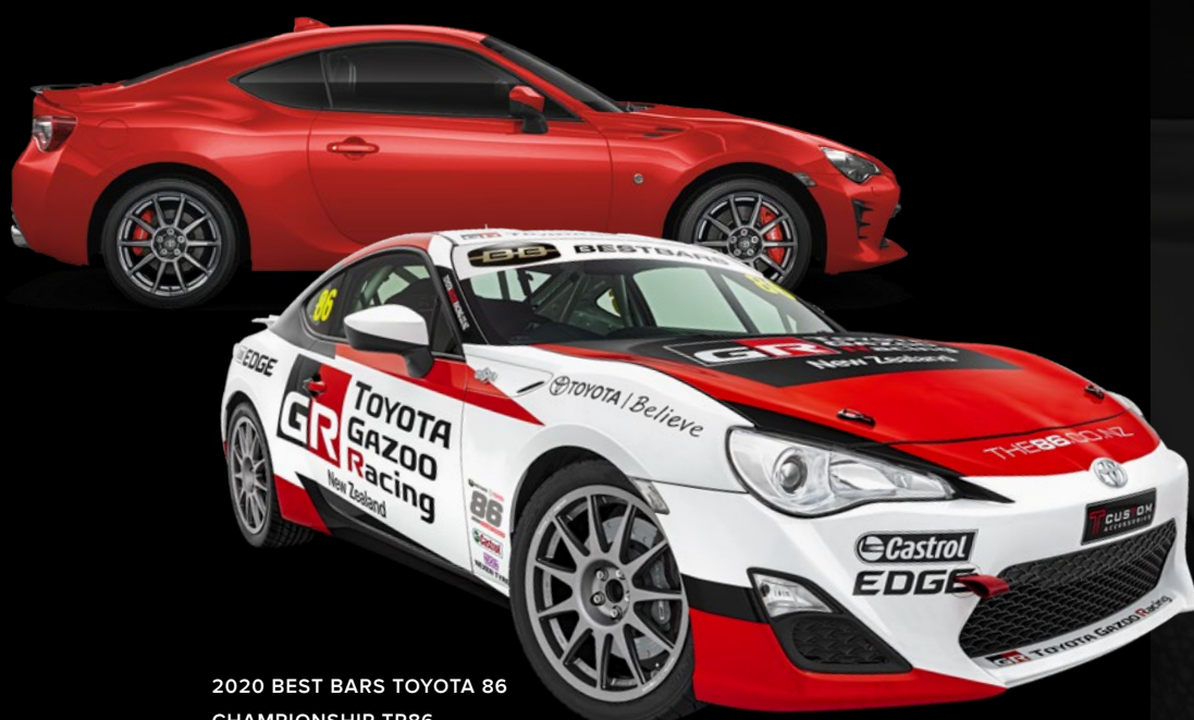
2020 BEST BARS TOYOTA 86 CHAMPIONSHIP TR86

If you are looking for convenience and ease the six-speed automatic transmission offers complete focus on the road ahead. In the GT86 auto, you can over-ride the auto transmission with paddle shifters.