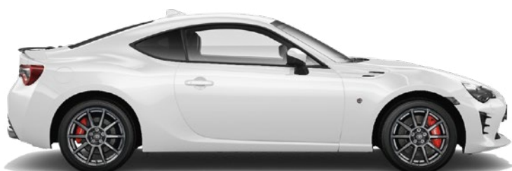
Crystal White 040 Pearl