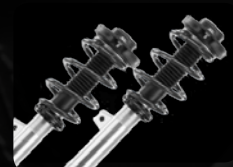
SACHS® PERFORMANCE DAMPERS