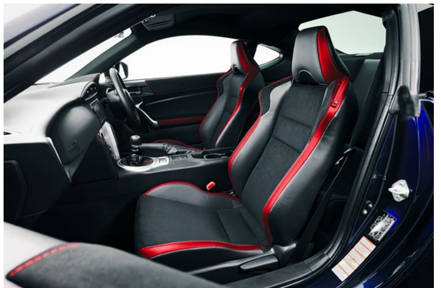
GT86 Black & Red Leather & Alcantara Accented