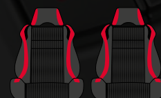
ALCANTARA & LEATHER ACCENTED SPORTS SEATS WITH FRONT SEAT HEATERS