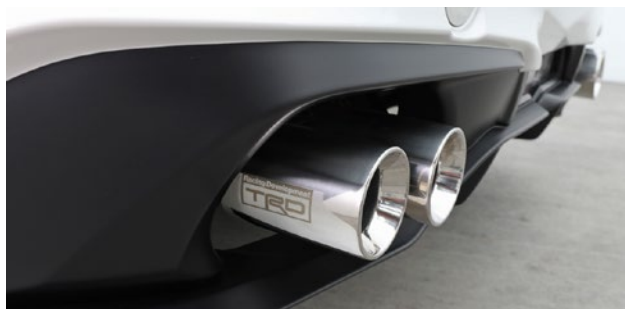
TRD High Response Muffler. The total of four exhausts (two on each side) gives the rear styling a burst of racing passion. Exceedingly good care was taken in tuning for the perfect sound, giving the engine a satisfying noise that you'll feel as much as hear. Requires TRD Rear Bumper Spoiler.