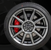
10-SPOKE GUN METALLIC 17" ALLOY WHEELS