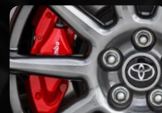
BREMBO® BRAKES WITH RED CALIPERS

AVAILABLE AS: 2.0L PETROL 6-SPEED MANUAL 2.0L PETROL 6-SPEED AUTO