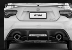
DUAL EXHAUST PIPES WITH REAR DIFFUSER