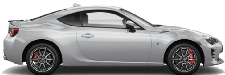
Ice Silver G1U Metallic