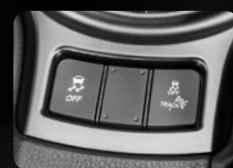
TRACK DRIVE MODE