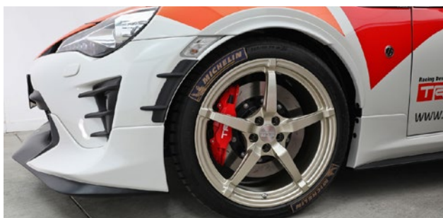
18" TRD 'SF3' (Forged) aluminium wheel. Forged alloy wheel with a 5 spoke design that offers rigidity and has suitable weight reduction at only 8.2kg per wheel.

Only Toyota Genuine Accessories are designed and manufactured to the same high standard as original parts. Fitting Toyota Genuine Accessories also ensures the integrity of your vehicle, with components tested to exacting standards for New Zealand conditions and backed by a 3 year or 100,000 kilometres* warranty. For more information on our Toyota Genuine Accessory range please contact your local Toyota Store or visit our website: www.toyota.co.nz