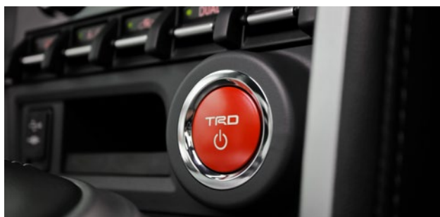
TRD Push button start. Awaken your racing spirit every time you push this TRD logo push start switch. Sharp design sense in these small details sets your vehicle apart from the crowd. Provides the same function and quality as the standard part.