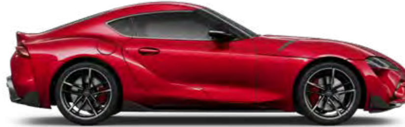
Renaissance Red D05