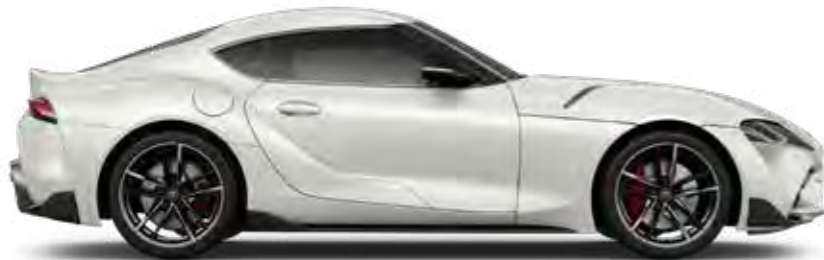
Sub Zero White D01