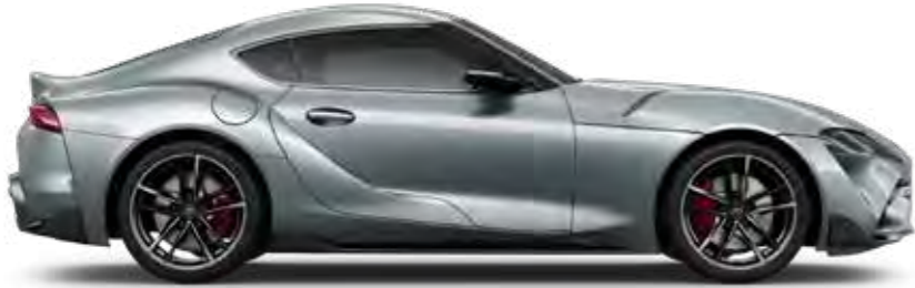
Turbulence Grey D03