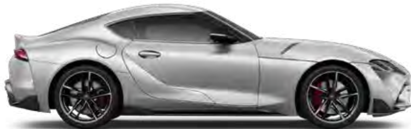
Tungsten Silver D02