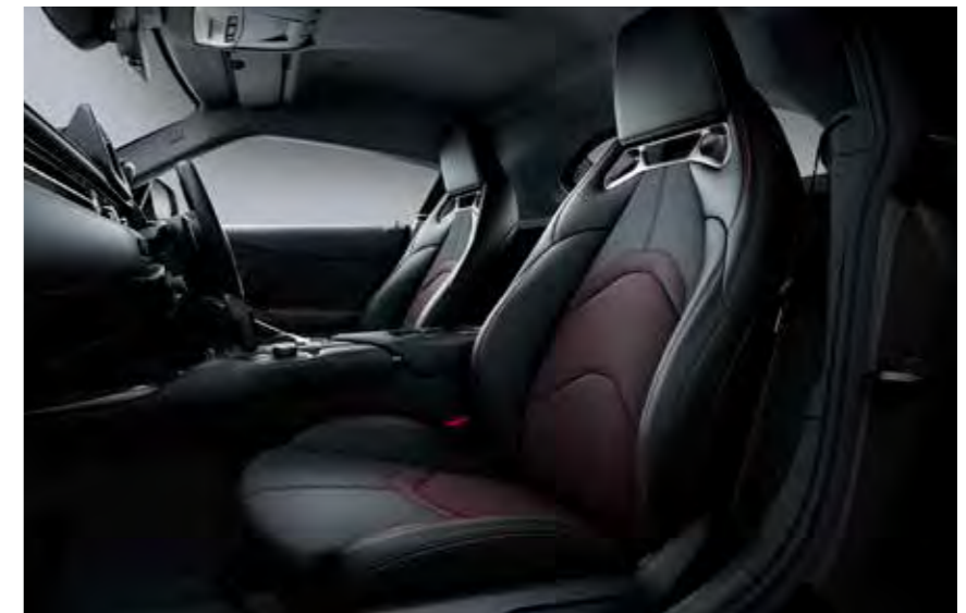
Black Leather & Alcantara accented