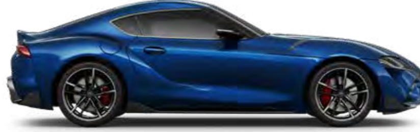
Downshift Blue D07