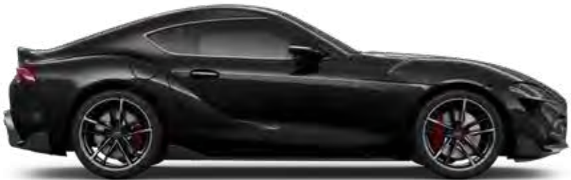
Nocturnal Black D04