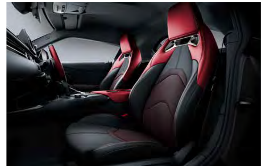
Ignition Red Leather & Alcantara accented