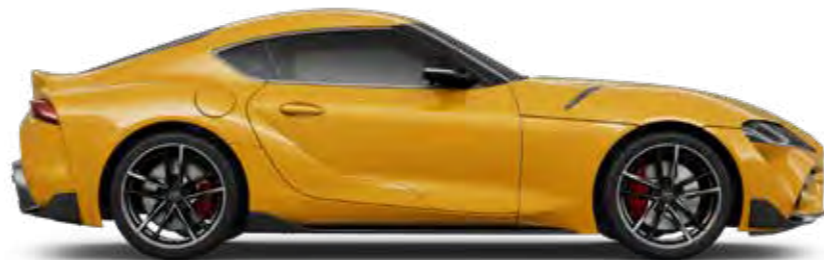
Nitro Yellow D06