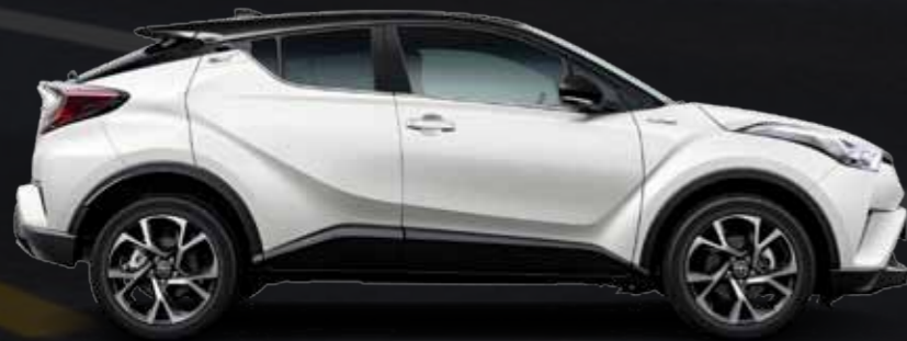
C-HR LIMITED IN CRYSTAL PEARL 2-TONE