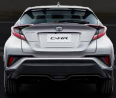
C-HR IN SHADOW PLATINUM