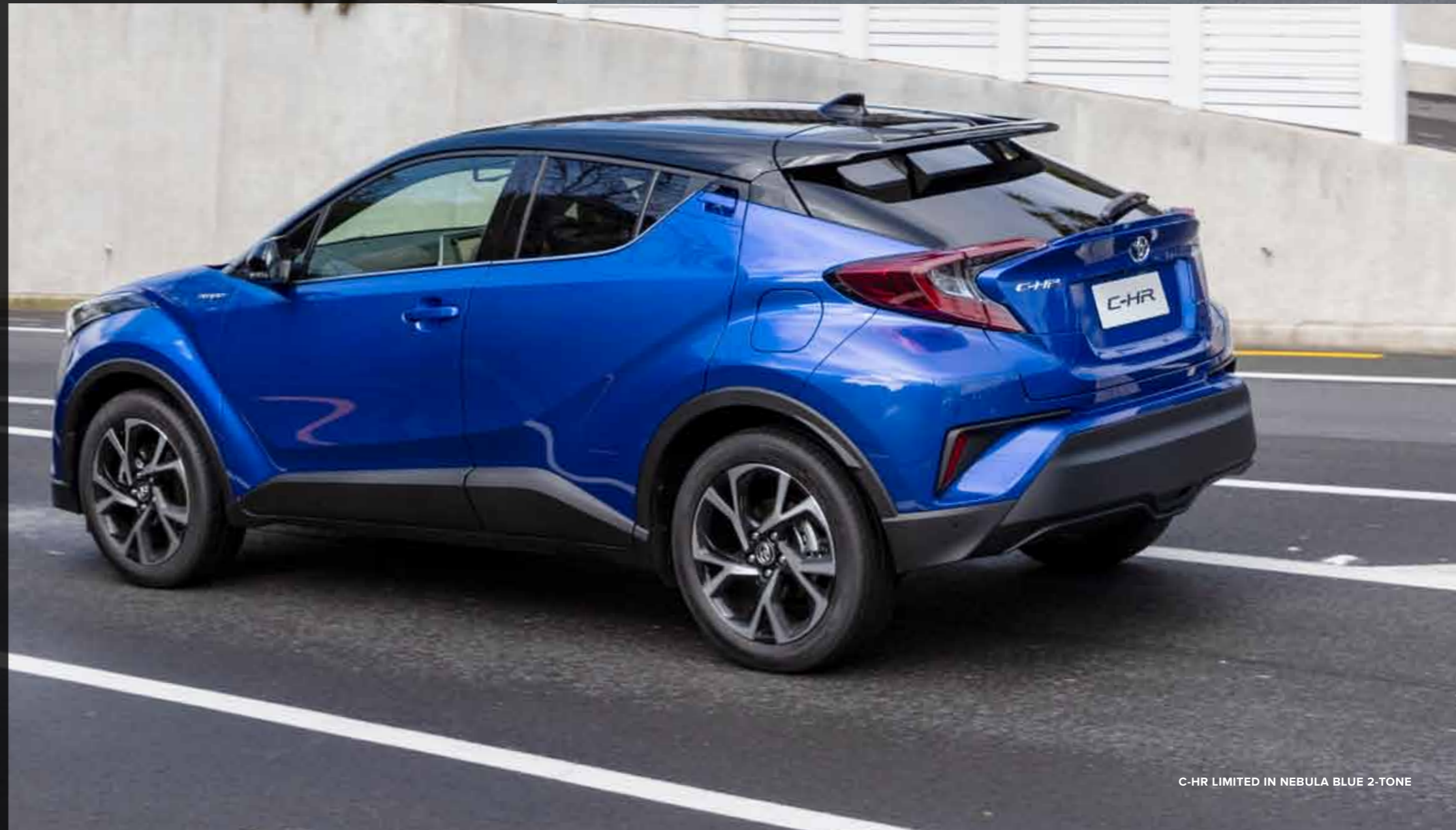
C-HR LIMITED IN NEBULA BLUE 2-TONE