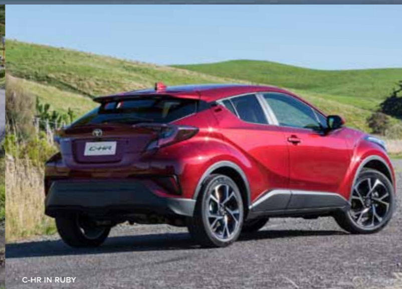
C-HR IN RUBY