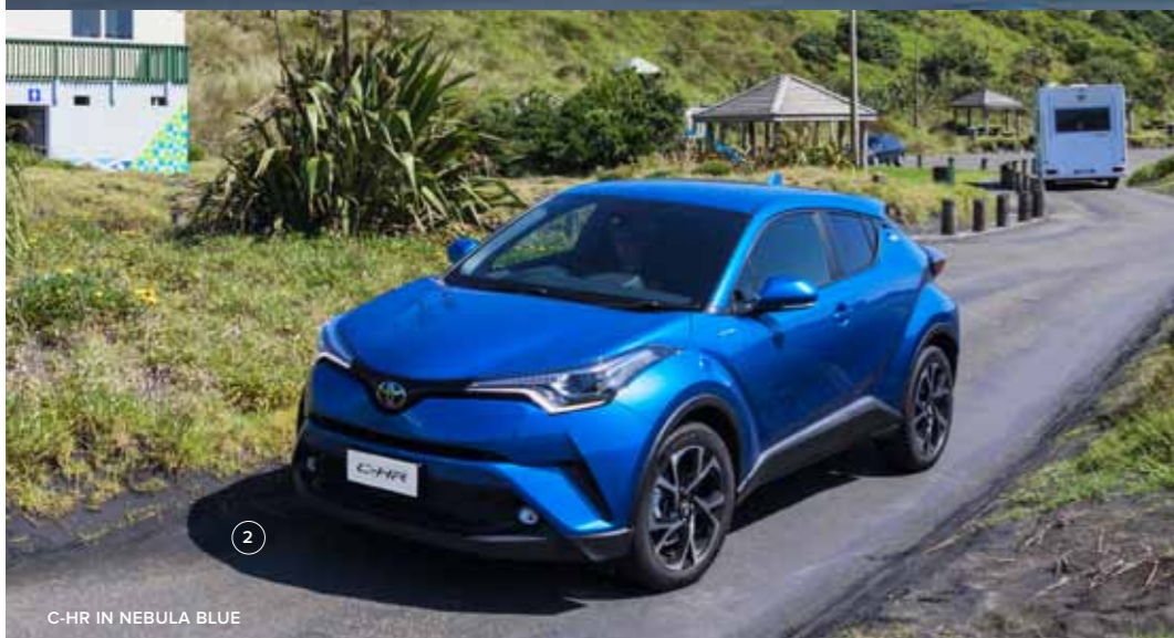
C-HR IN NEBULA BLUE