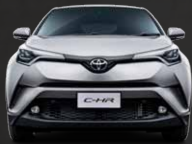
C-HR IN SHADOW PLATINUM