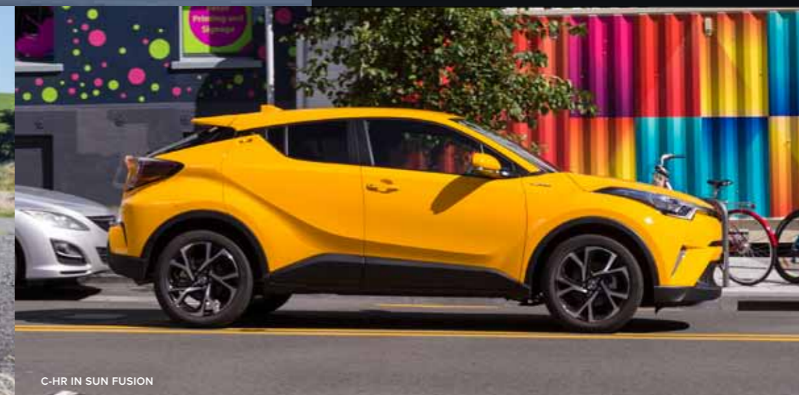
C-HR IN SUN FUSION