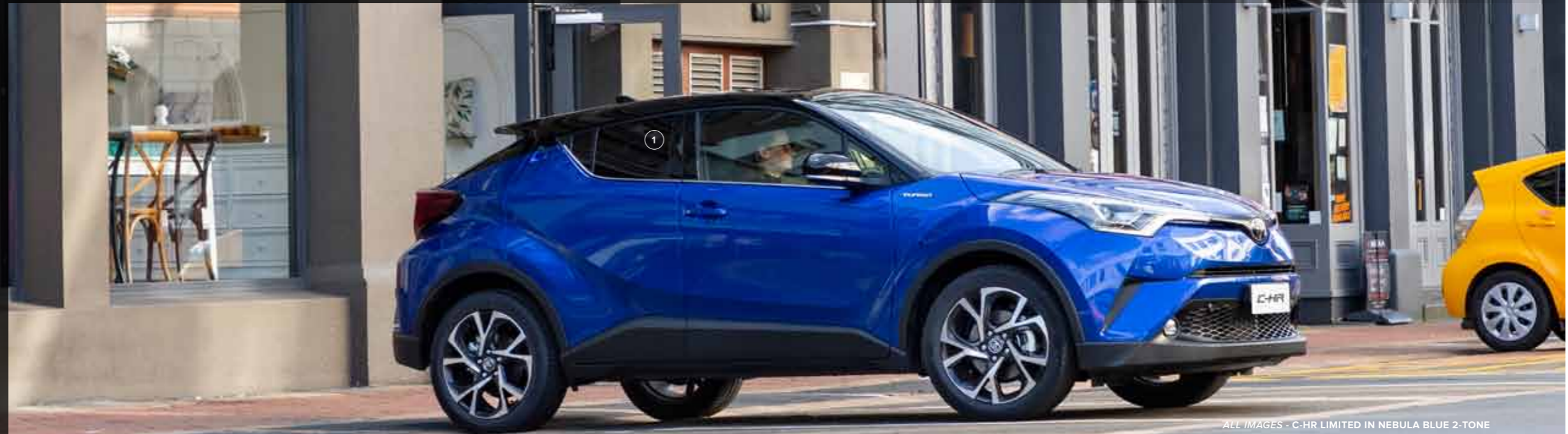
ALL IMAGES - C-HR LIMITED IN NEBULA BLUE 2-TONE

Inside the C-HR Limited, the attention to detail is astonishing, with a premium-look leather accented interior augmented with comfort tech aplenty, such as seat heaters, driver's seat lumbar support, smart key entry and push button start. At night, subtle blue illumination highlights front door trims and cup holders, enlivening the C-HR Limited's interior even further.