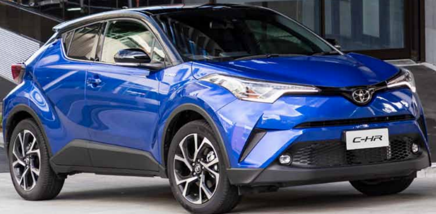
C-HR LIMITED IN NEBULA BLUE 2-TONE