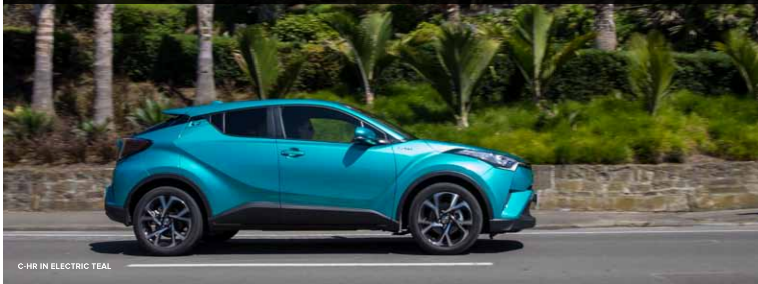
C-HR IN ELECTRIC TEAL

In keeping with a comprehensive package offering, the dynamic C-HR crossover coupe offers a truly impressive level of standard safety equipment for extra peace of mind.