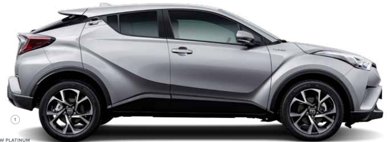
C-HR IN SHADOW PLATINUM