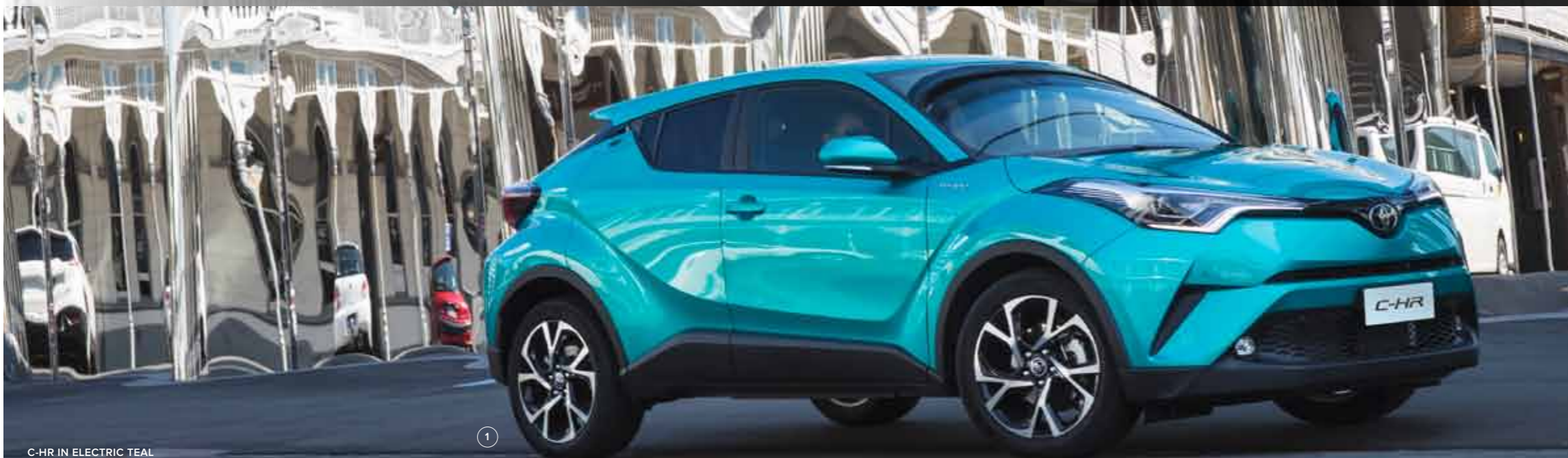
C-HR IN ELECTRIC TEAL

Suffice to say, there has never been a Toyota that looks quite like the C-HR.