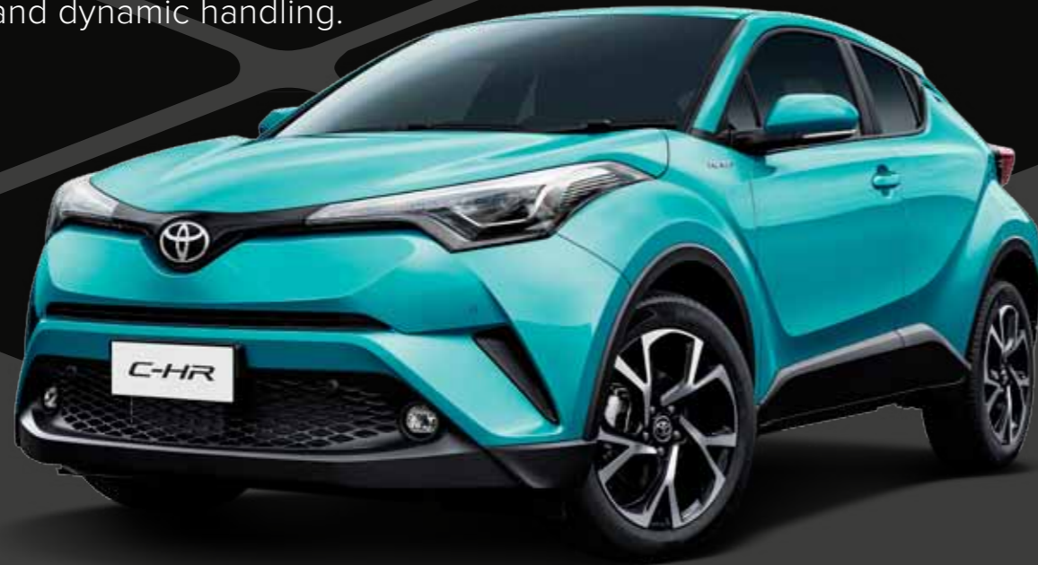
C-HR IN ELECTRIC TEAL

It's the right recipe, isn't it? A sporty compact crossover coupe with just the right mix of turbo power and dynamic handling.