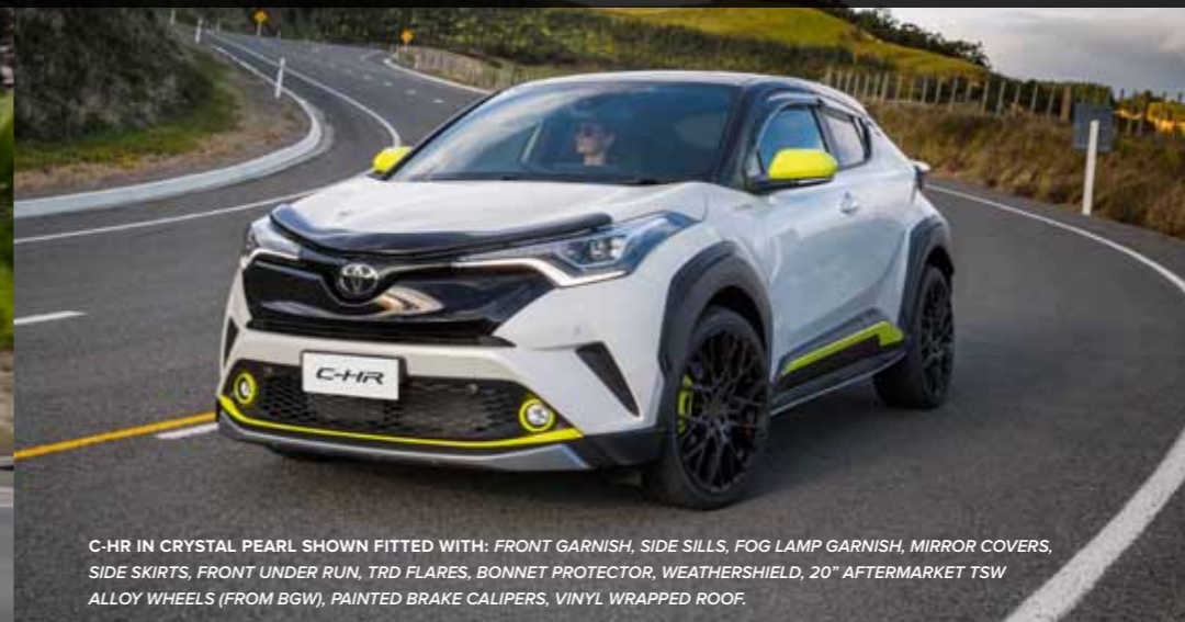
C-HR IN CRYSTAL PEARL SHOWN FITTED WITH: FRONT GARNISH, SIDE SILLS, FOG LAMP GARNISH, MIRROR COVERS, SIDE SKIRTS, FRONT UNDER RUN, TRD FLARES, BONNET PROTECTOR, WEATHERSHIELD, 20" AFTERMARKET TSW ALLOY WHEELS (FROM BGW), PAINTED BRAKE CALIPERS, VINYL WRAPPED ROOF.

There is a Toyota Genuine Accessories component that will help your C-HR reflect your personality. Front, back, interior and exterior; C-HR is covered.