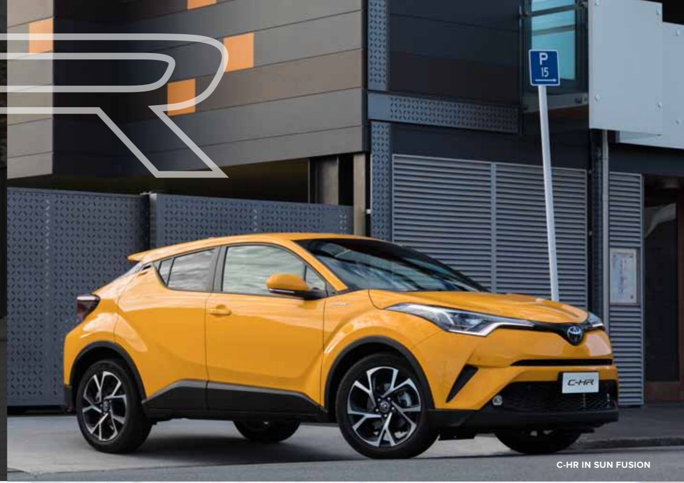
C-HR IN SUN FUSION

Step it up a notch in the C-HR Limited with front seat heaters, leather accented interior, driver's seat power lumbar support, smart key entry and push button start.