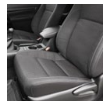
EXTRA CAB BLACK FABRIC