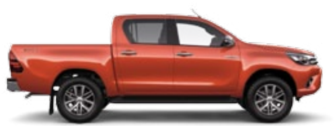
4R8 Inferno SR5 & SR5 LIMITED MODELS