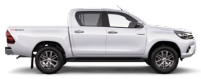
040 Glacier White ALL MODELS