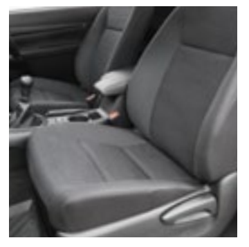
SINGLE CAB CHASSIS BLACK FABRIC