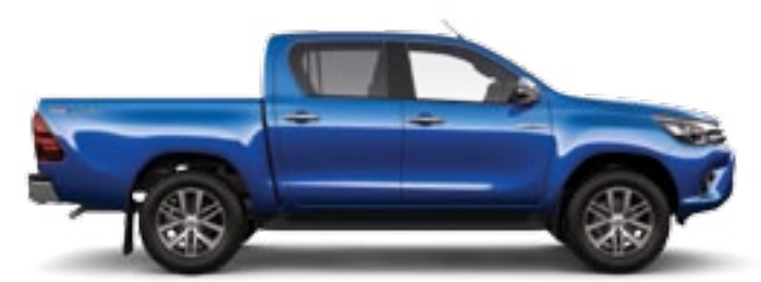
8X2 Nebula Blue ALL MODELS