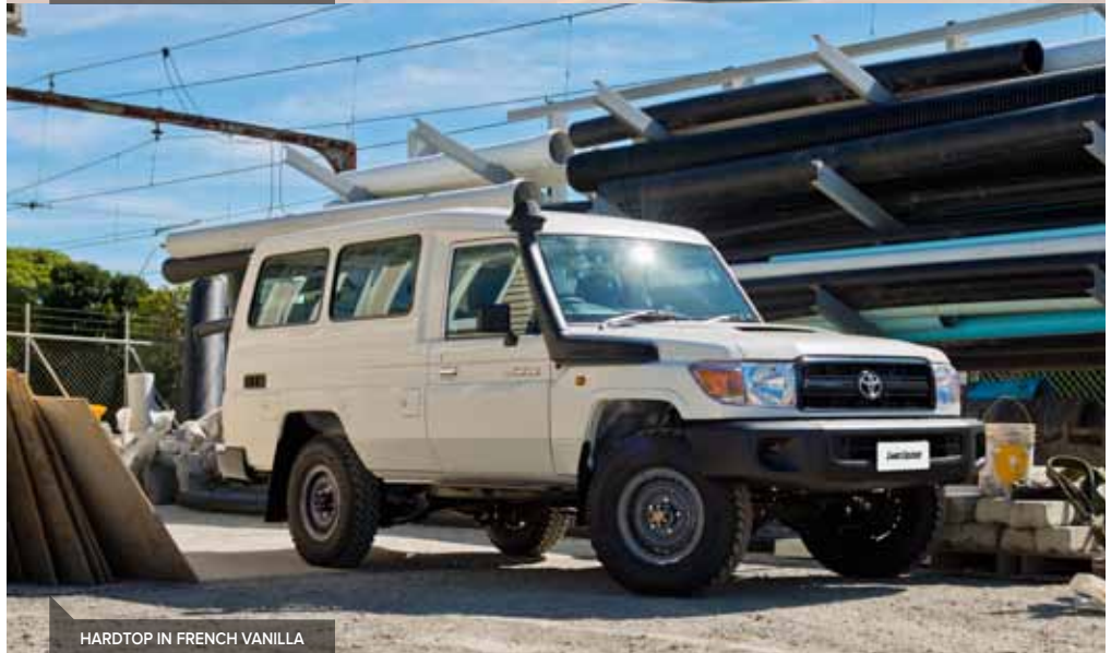
HARDTOP IN FRENCH VANILLA