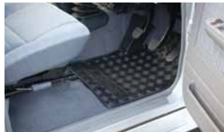
ACCESSORY While your Land Cruiser 70 is managing the mud outside you can keep control of it inside with these accessory rubber floor mats.