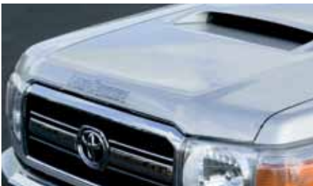
ACCESSORY Acrylic bonnet and headlight protection will keep your Land Cruiser 70 looking good, sold separately.