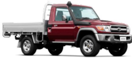
LX SINGLE CAB CHASSIS IN MERLOT RED