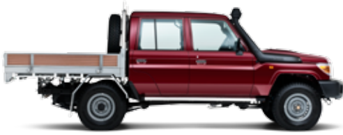
DOUBLE CAB CHASSIS IN MERLOT RED