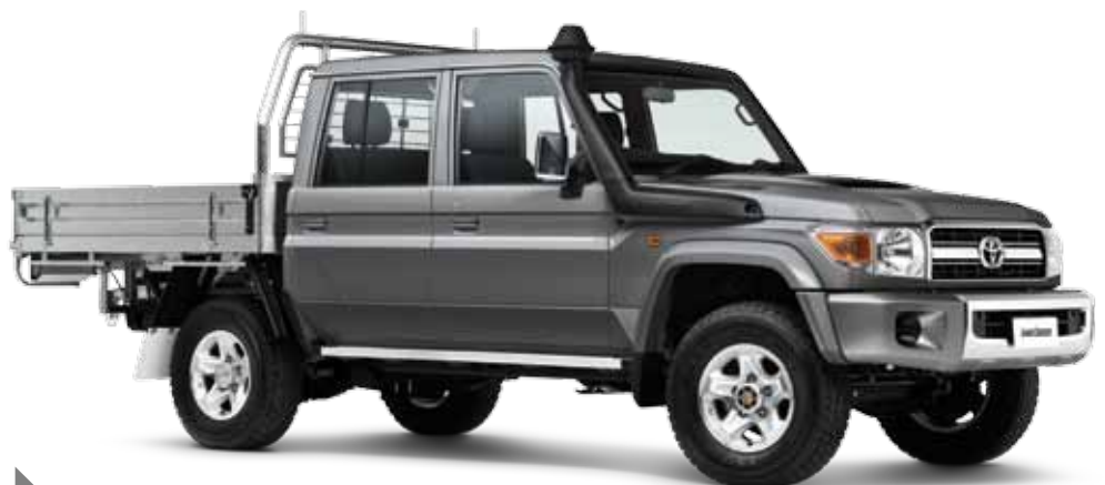
LX DOUBLE CAB CHASSIS IN GRAPHITE

Driver and front passenger airbag protection is provided as part of a revised steering wheel and dash layout.