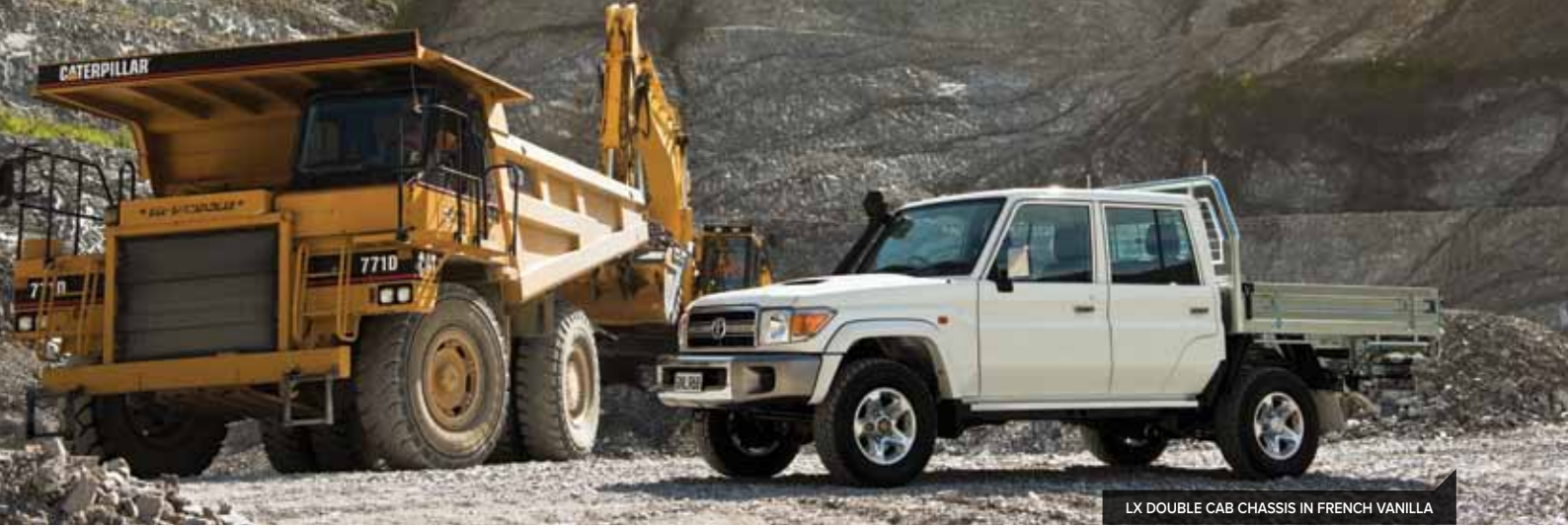
LX DOUBLE CAB CHASSIS IN FRENCH VANILLA WITH ACCESSORY DECK FITTED

OPTIONS & ACCESSORIES Only Toyota Genuine Accessories are designed and manufactured to the same high standard as original parts. They are engineered using manufacturer data to ensure that vehicle integrity is not compromised. This means the functionality of important precision systems such as airbags will not be impaired by their installation.