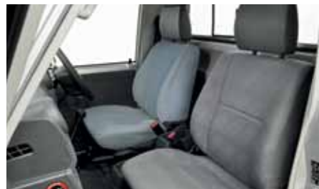
ACCESSORY The fabric trimmed seats are shaped for all day comfort. When you are hard at work or play dirt can find its way into the cab. Forget about it with accessory heavy duty canvas seat covers that are removable and washable. Drivers seat cover shown.

Make Land Cruiser 70 your own. Talk with your dealer about the factory fitted options and dealer fitted accessories that are available.