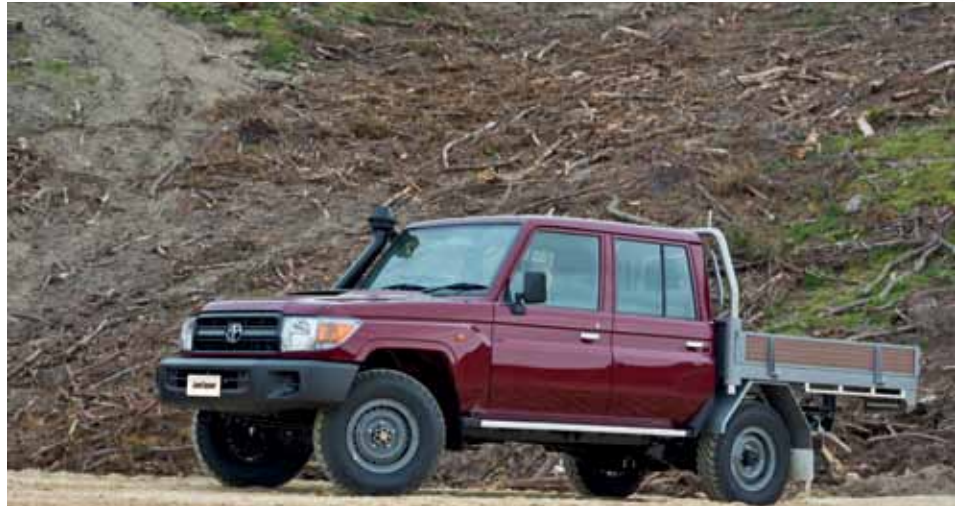
DOUBLE CAB CHASSIS IN MERLOT RED

If the day will be a long one the Double Cab models have the large 130 litre fuel capacity.