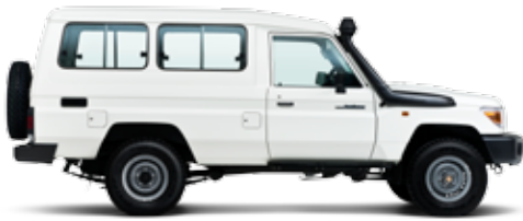
HARDTOP IN FRENCH VANILLA