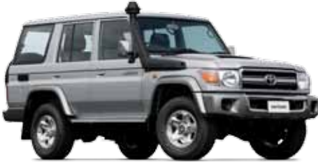
LX WAGON IN SILVER PEARL