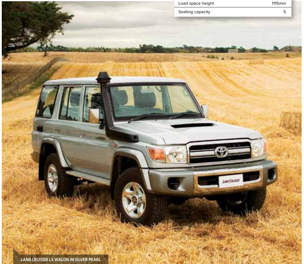
LAND CRUISER LX WAGON IN SILVER PEARL

At the head of Land Cruiser 70 series line-up, the LX five door Wagon combines the creature comforts you'd expect from a Toyota with the freedom to hunt out the best leisure spots New Zealand has to offer. Land Cruiser 70 LX Wagon will open your eyes to the pure pleasure of four wheel driving at its best.