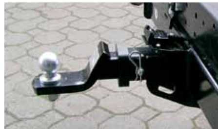
ACCESSORY As well as carrying a decent load, Land Cruiser 70 can tow too. To ensure you maximise Land Cruisers ability, get a towbar certified for a 750 - 3500kg load.