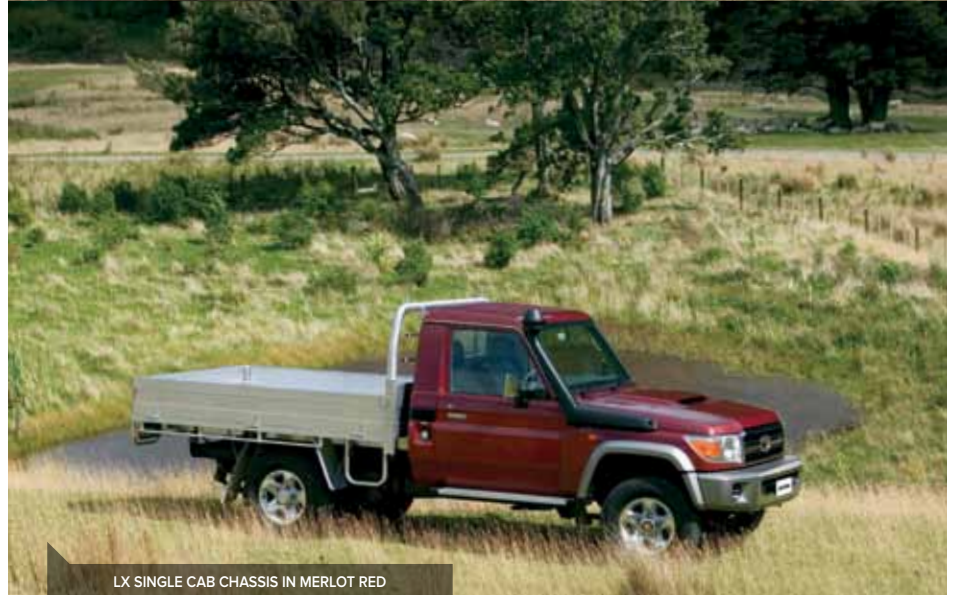
LX SINGLE CAB CHASSIS IN MERLOT RED