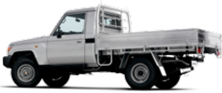
SINGLE CAB CHASSIS IN SILVER PEARL