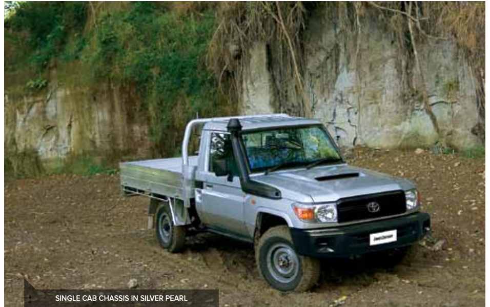
SINGLE CAB CHASSIS IN SILVER PEARL

While Land Cruiser 70 is all go, big powerful ventilated disc brakes all round slow things down in a hurry.