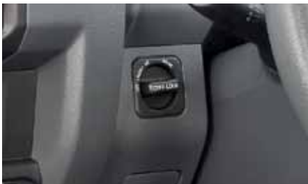
HIGH COUNTRY PACKAGE Front and rear differential locks add greater traction when the going gets really tough. As a factory fitment this option needs to be specified at time of order.

OPTIONS & ACCESSORIES Only Toyota Genuine Accessories are designed and manufactured to the same high standard as original parts. They are engineered using manufacturer data to ensure that vehicle integrity is not compromised. This means the functionality of important precision systems such as airbags will not be impaired by their installation.