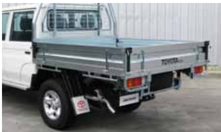
ACCESSORY This Tray body assembly is fabricated from heavy duty galvanised steel with an aluminium checkerplate tray deck. Rear Ladder Rack is available as an option, sold separately.