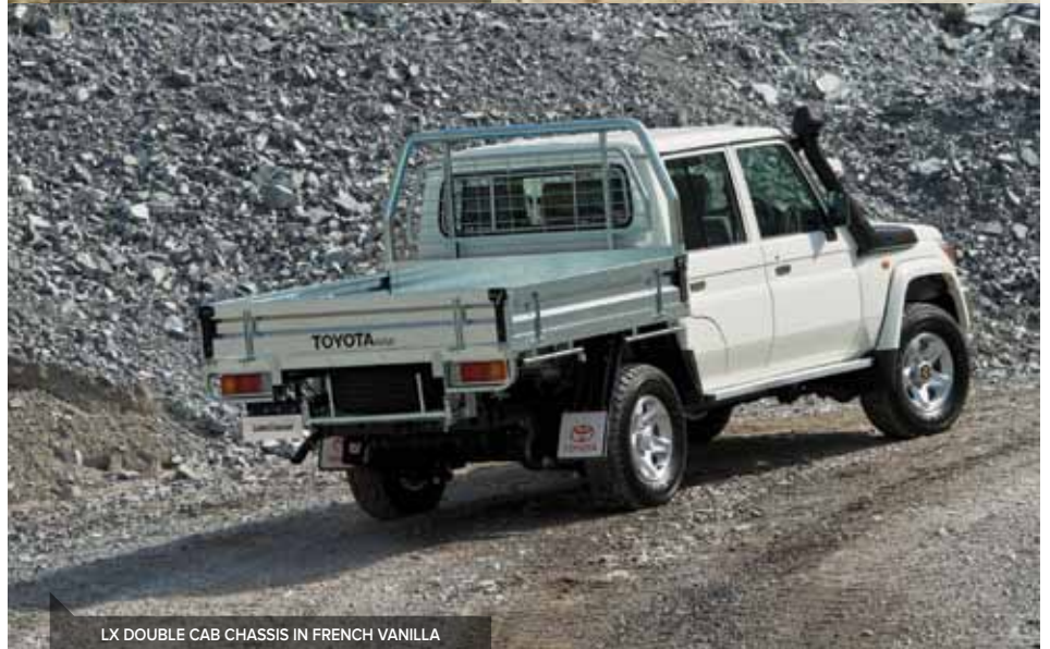
LX DOUBLE CAB CHASSIS IN FRENCH VANILLA