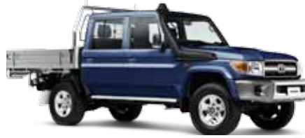
LX DOUBLE CAB CHASSIS IN MIDNIGHT BLUE