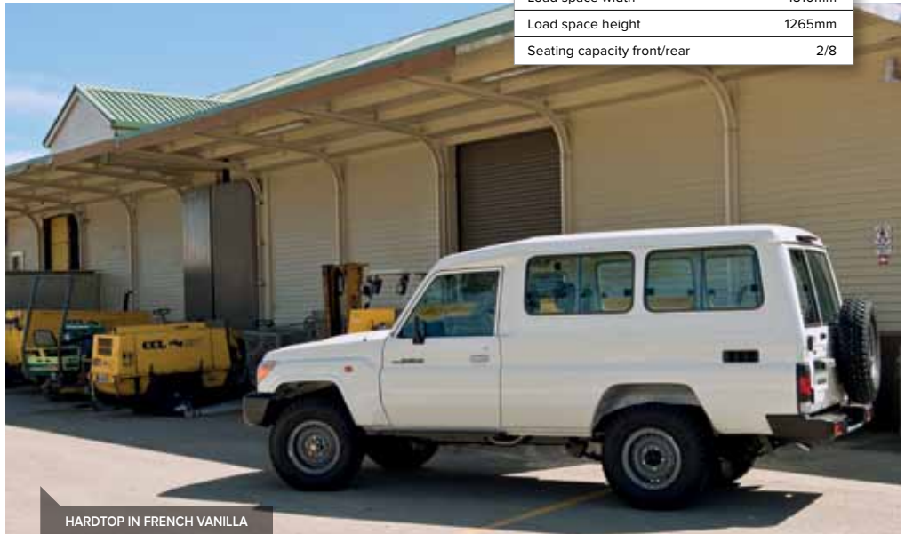
HARDTOP IN FRENCH VANILLA

With seating for 10, Land Cruiser 70 Hardtop has the space and the grunt to carry the whole crew, and all the gear that travels with them. Transporting staff to off-road work locations is easy thanks to the parallel rear bench seats carrying eight passengers. Covered in hard wearing vinyl, these rear seats can accommodate a small army and then fold away when not in use to reveal a large cargo area.