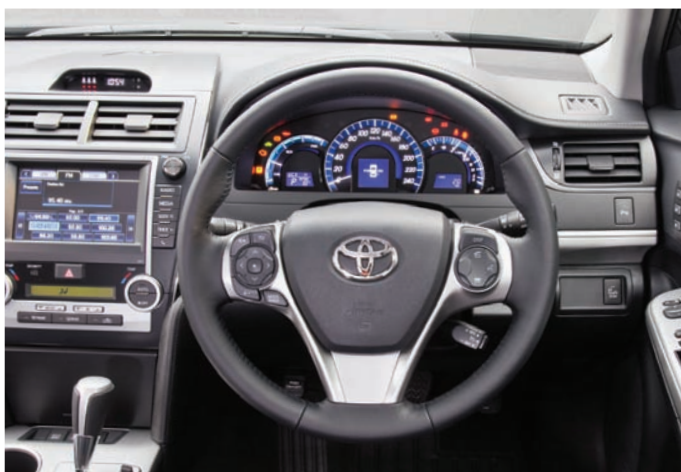
A sense of spaciousness and freedom is realised with the wide sweeping dash and sophisticated instrument panel.