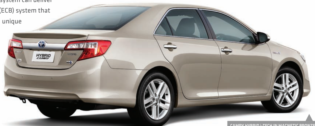
CAMRY HYBRID i-TECH IN MAGNETIC BRONZE