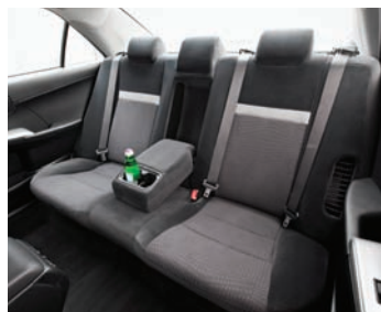
Camry Hybrid has rear seat space for three adults or when required the split folding seat backs can accommodate longer luggage items.