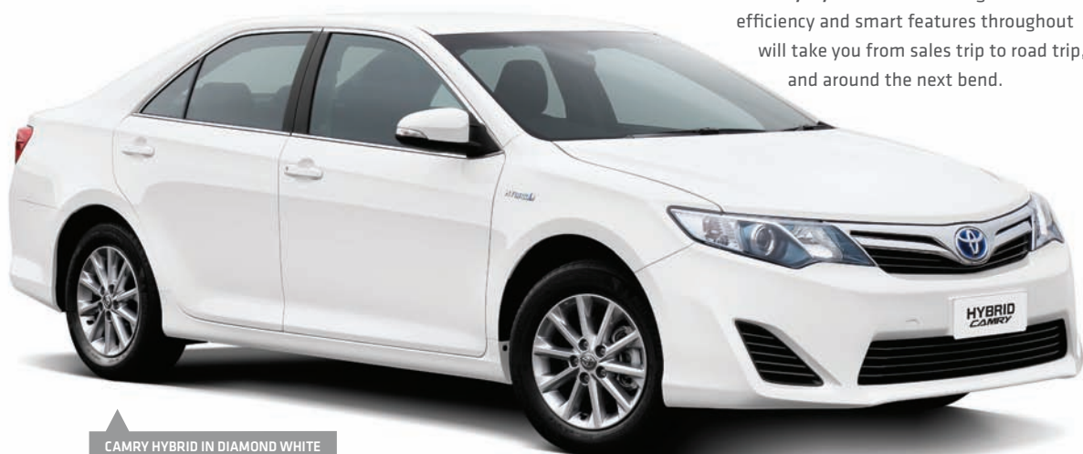
CAMRY HYBRID IN DIAMOND WHITE

The Camry Hybrid's class leading fuel efficiency and smart features throughout will take you from sales trip to road trip, and around the next bend.