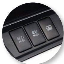
Camry Hybrid combines the best of both world's. In ECO mode the sophisticated systems balance the petrol engine and electric motor for optimum efficiency. In EV mode drive comes from the electric motor.