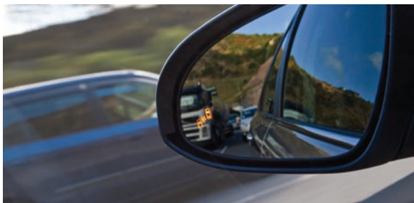
Camry Hybrid i-Tech has Blind Spot Monitoring (BSM) to help avoid surprises from other road users travelling in the inside lane.

Collision safety technology has been incorporated throughout, from the body panels and construction, through to new seat design that not only increases comfort, but actively absorbs collision energy. And we've gone further. Driver and passenger front, front side, front/rear curtain shield and driver's knee airbags are standard in all models.