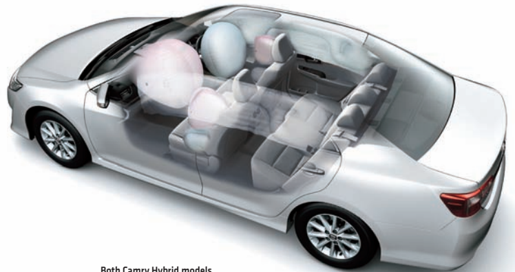
Both Camry Hybrid models have extensive occupant protection with seven airbags throughout the cabin.