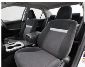
Camry Hybrid is finished in high grade fabric. The cabin offers a quiet and comfortable space for five adults.