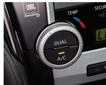
Attention has been lavished on small details like the air conditioning controls and the variable texturing of surfaces.