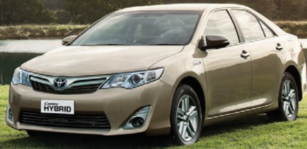
CAMRY HYBRID i-TECH IN MAGNETIC BRONZE