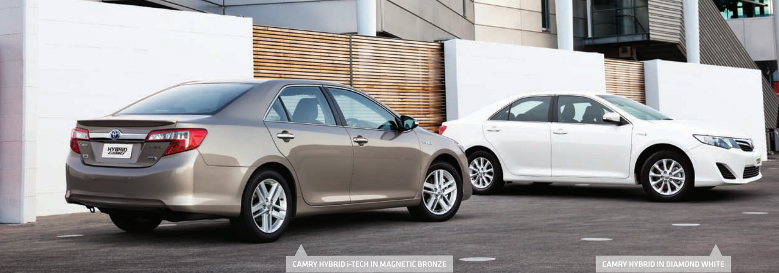
CAMRY HYBRID i-TECH IN MAGNETIC BRONZE