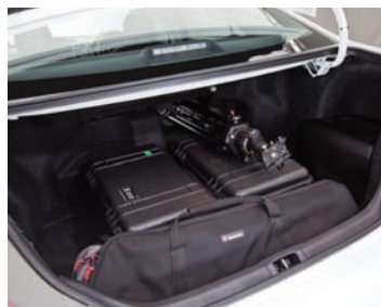
Camry Hybrid has a full sized boot with 421 litres of luggage space. The right side rear seat folds forward providing an access hatch so long items can be carried.