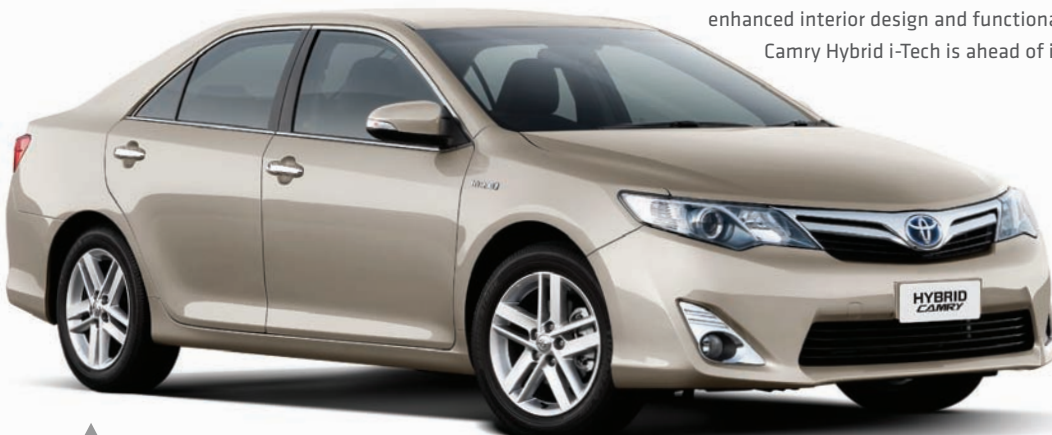
CAMRY HYBRID i-TECH IN MAGNETIC BRONZE

Camry Hybrid i-Tech combines powerful acceleration with the added luxury of enhanced interior design and functionality. Camry Hybrid i-Tech is ahead of its time.