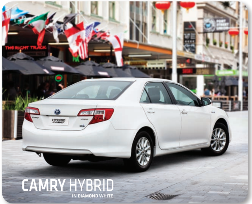
CAMRY HYBRID IN DIAMOND WHITE