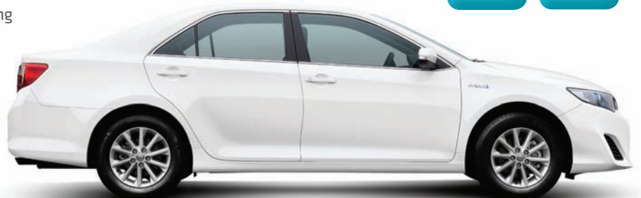
CAMRY HYBRID IN DIAMOND WHITE