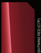
LIGHTNING RED (C7P)