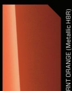
BURNT ORANGE (Metallic H8R)