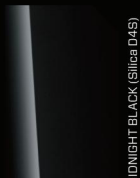
MIDNIGHT BLACK (Silica D4S)