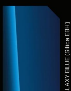
GALAXY BLUE (Silica 68H)