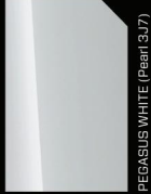
PEGASUS WHITE (Pearl 3.17)

The 86's 2.0L front boxer engine has D-4S direct injection to provide you with power when you need it. The engine achieves a 147kW @ 7000 rpm and has 205Nm of torque @ 6,400 rpm. At 5000 revs the car's attitude changes and it's on!