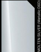
MOLTEN SILVER (Metallic 060)