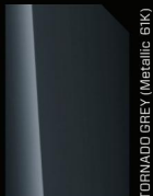
TORNADO GREY (Metallic 61K)